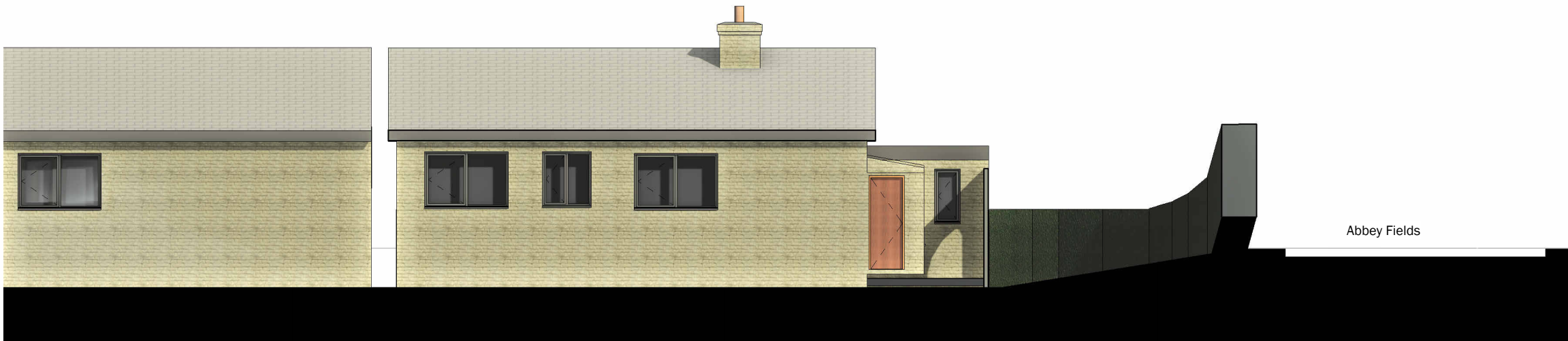
1 EXISTING NORTH 1 : 50