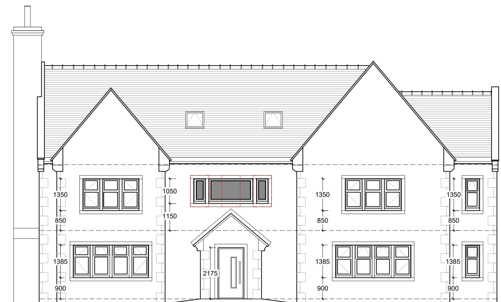
PROPOSED SOUTH ELEVATION Scale 1:100