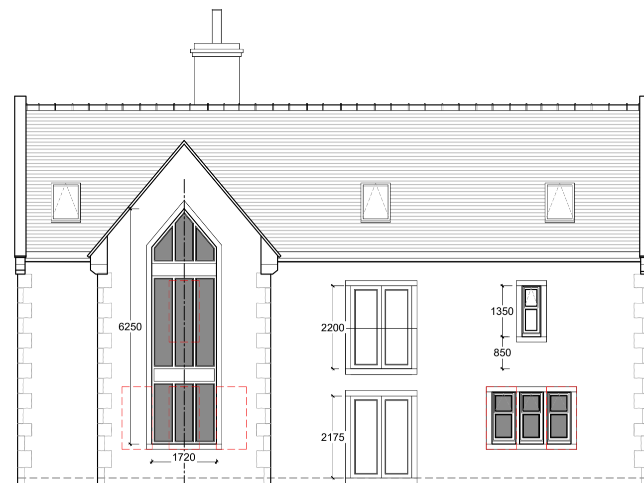
PROPOSED EAST ELEVATION Scale 1:100