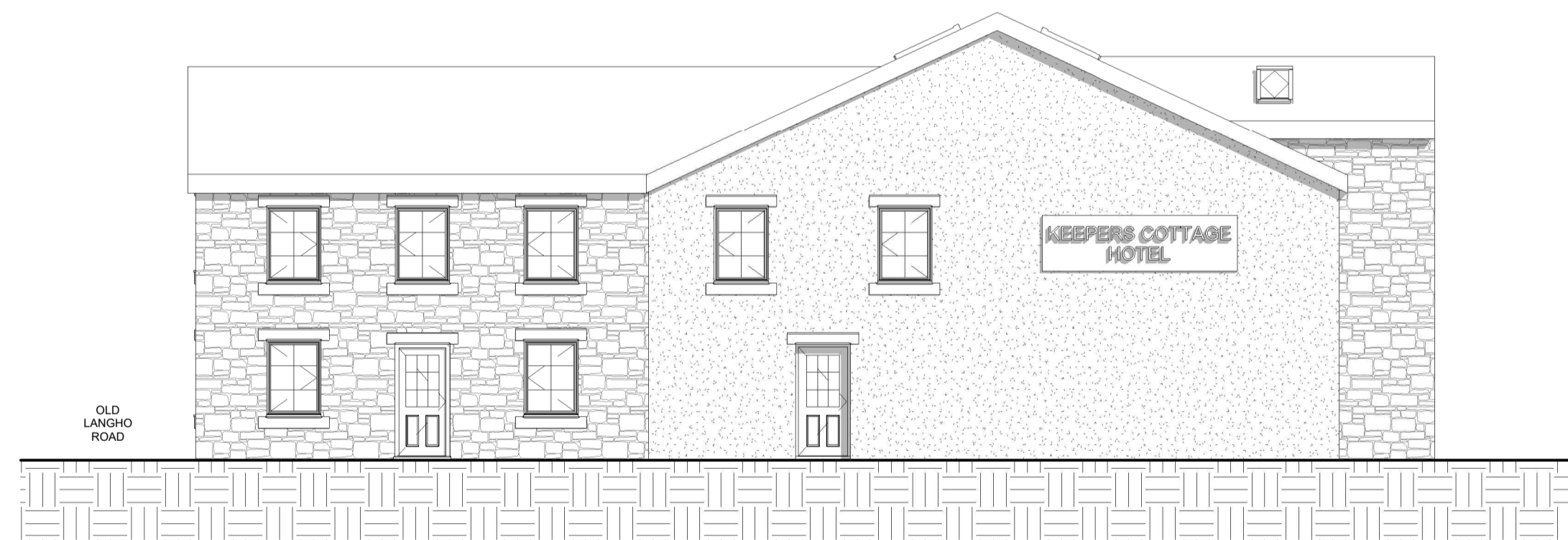
3 PROPOSED SOUTH WEST 1 : 100