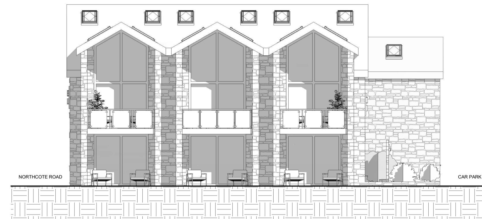
2 PROPOSED SOUTH EAST 1 : 100