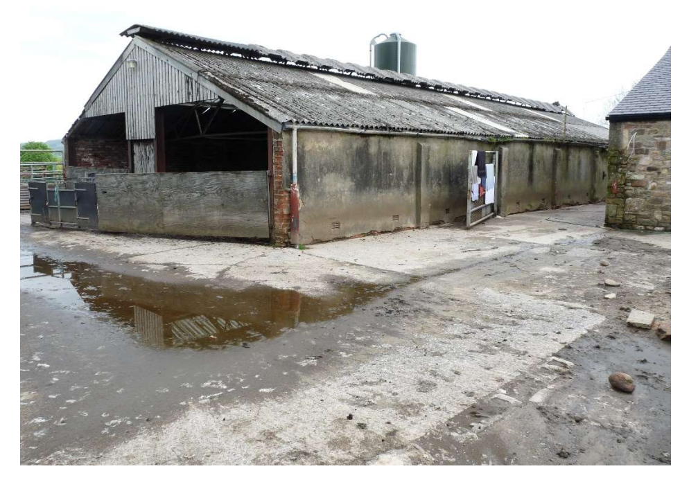
Rear elevation building width reduced 3.2 m