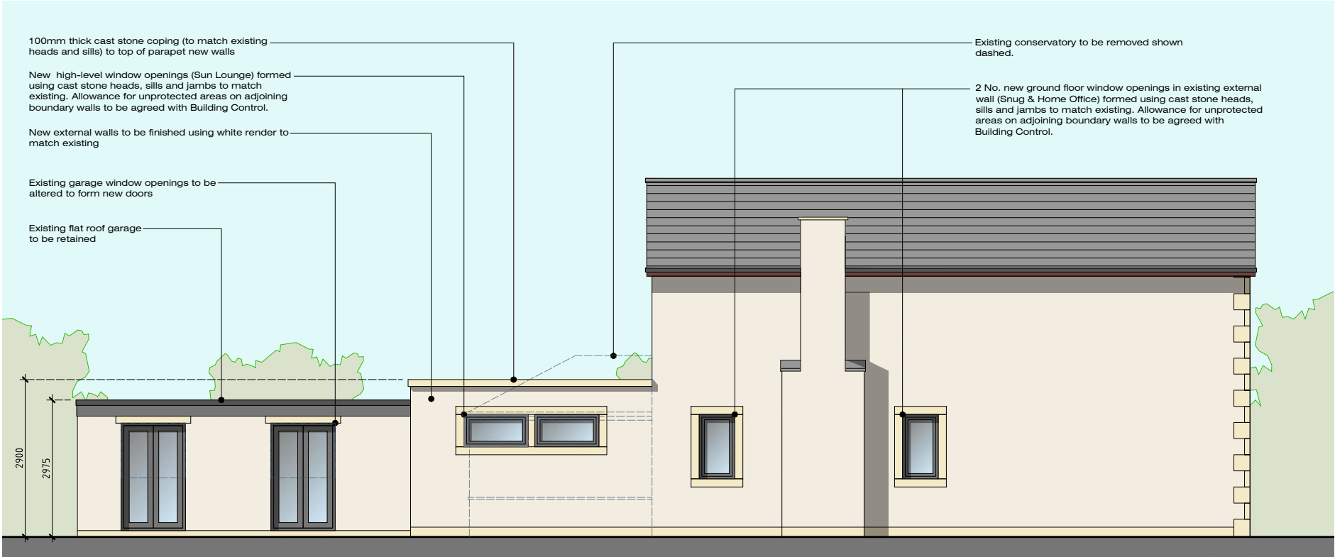
Side (South-East) Elevation