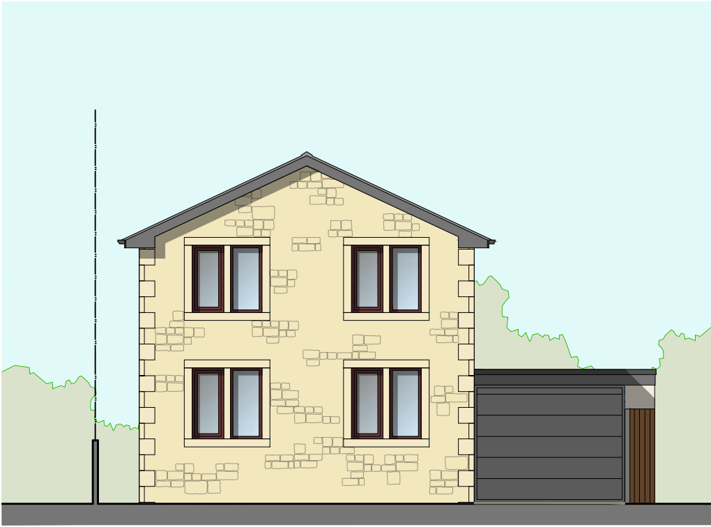
Front (North-East) Elevation

REAR EXTENSION - 15 LITTLE LANE - LONGRIDGE - PRESTON - PR3 3NS