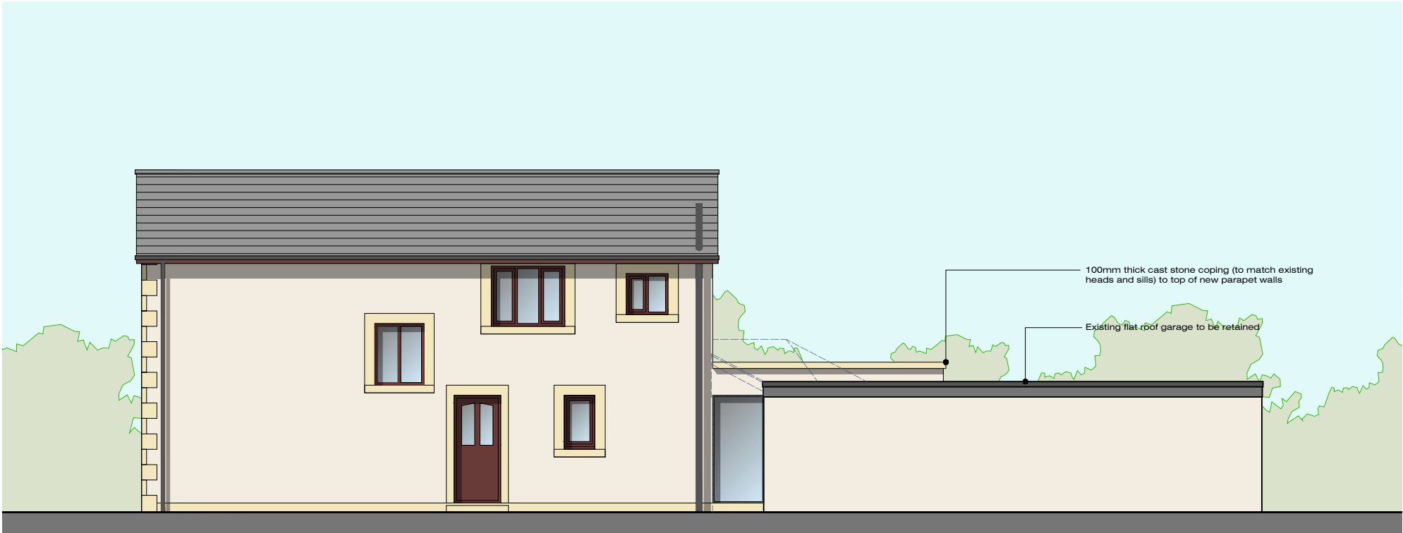
Side (North-West) Elevation