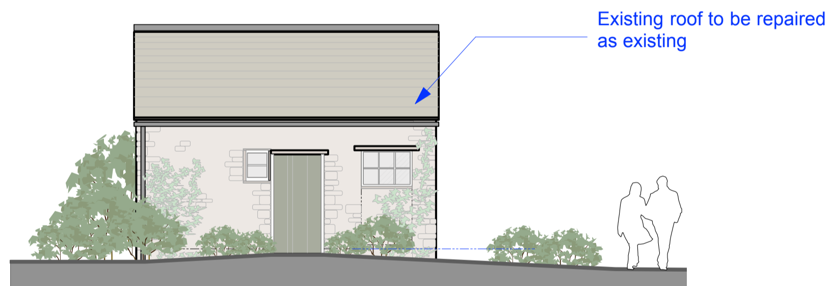
○ Outbuilding Proposed East Elevation Scale: 1:100 Ancillary Accomodation