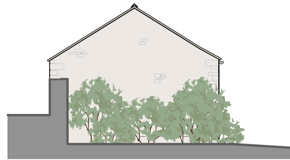
○ Outbuilding Proposed South Elevation Scale: 1:100 Ancillary Accomodation