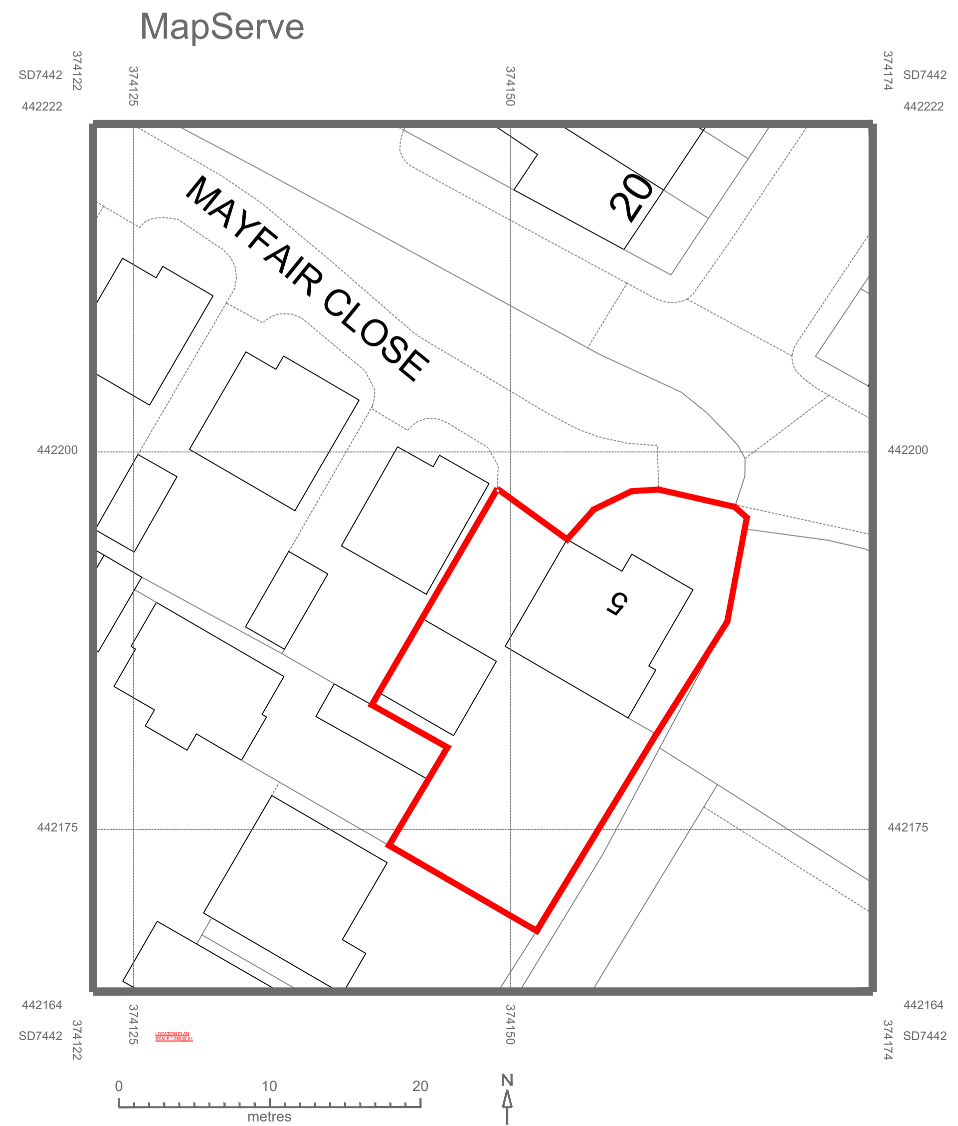
LOCATION PLAN SCALE 1:250 @ A1