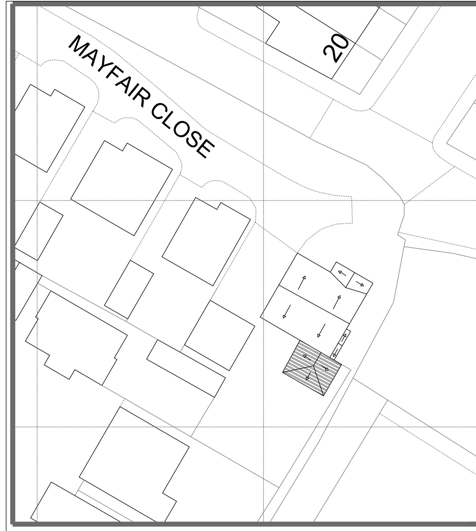
PROPOSED ROOF PLAN SCALE 1:250 @ A1