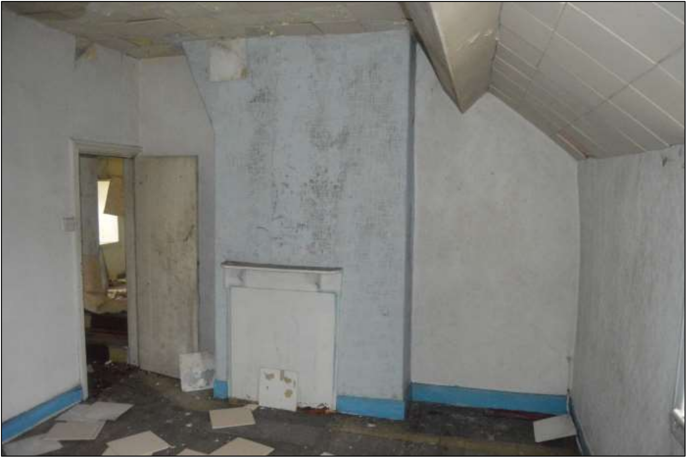
PL45: View east within the first floor south west bedroom.