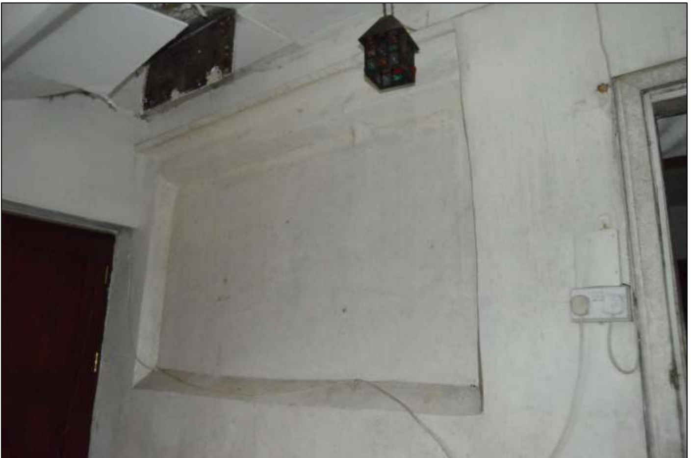
PL25: View of blocked former mullioned window from within the front south elevation lean-to.