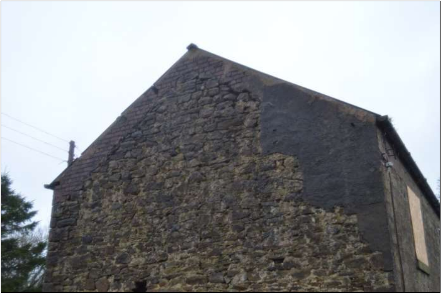
PL17: View of raised roof and old roofline to the west gable end elevation.