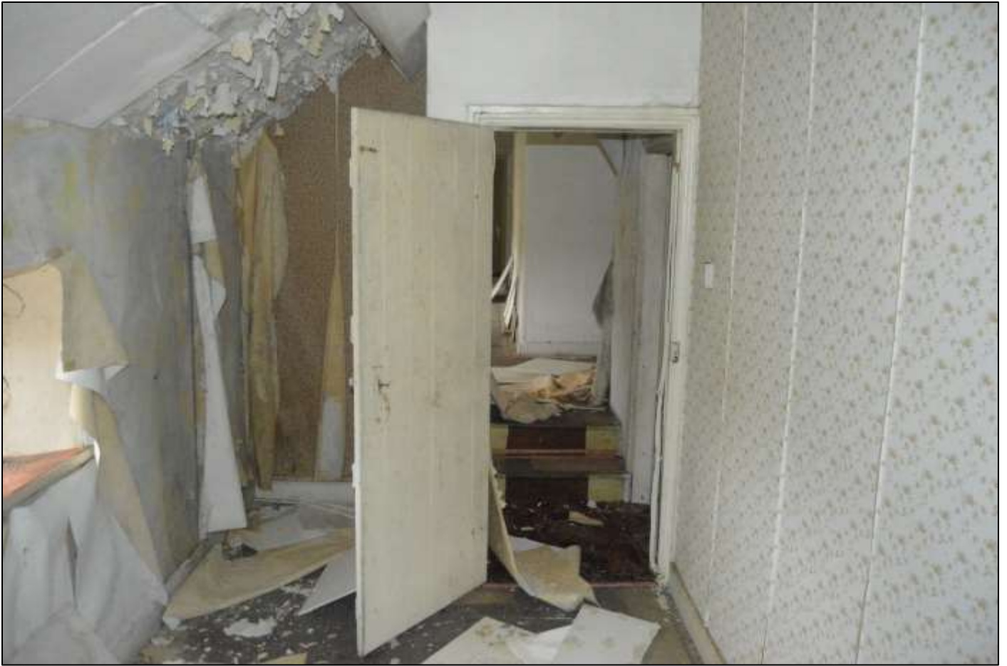
PL47: View east within the first floor north west bedroom.