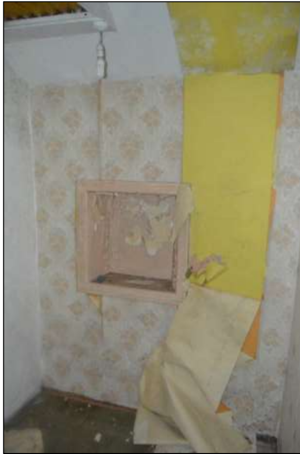
PL35: View north within the first floor landing to the rear of the cross wing.