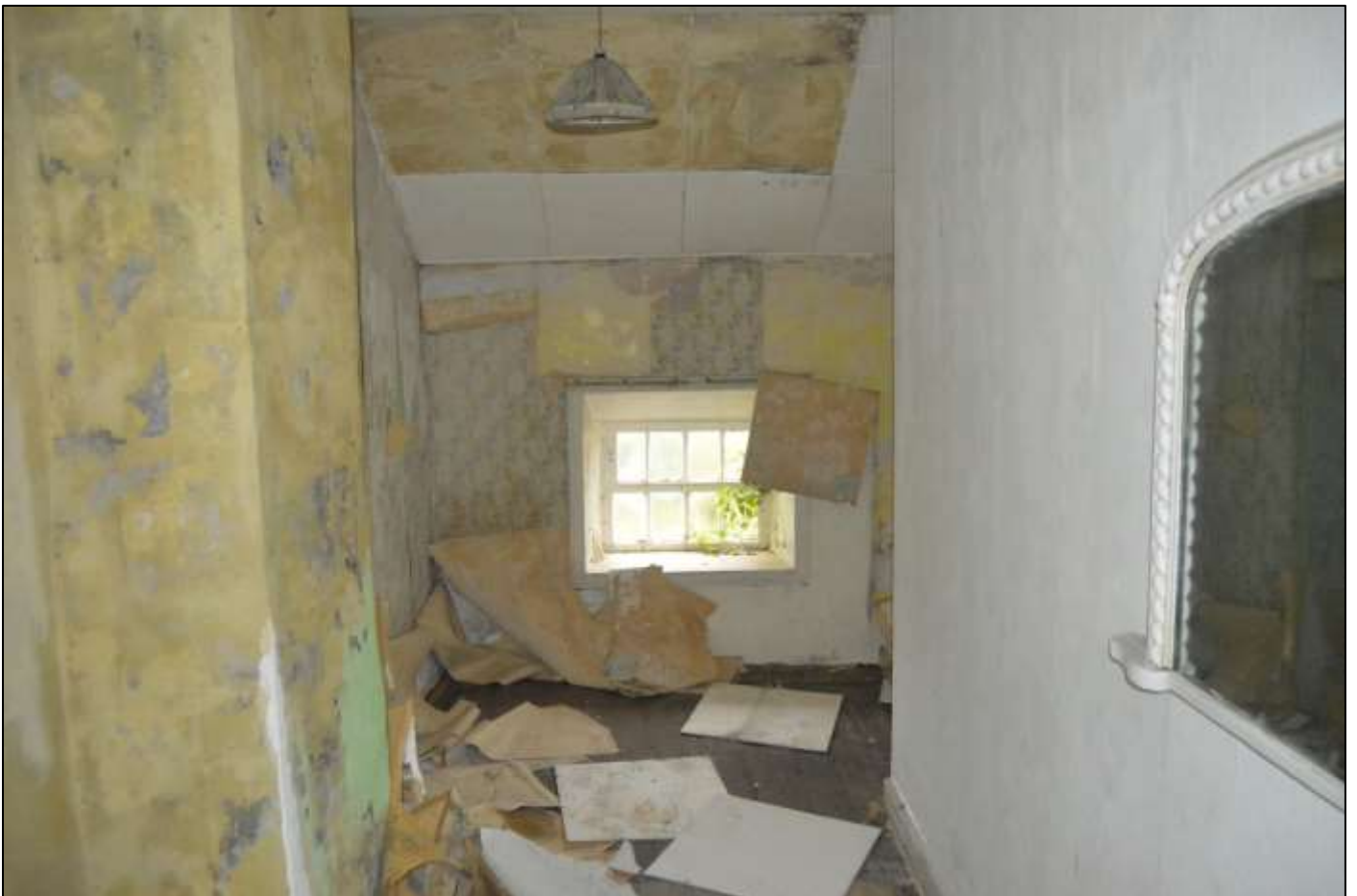
PL42: View north within the central landing space.