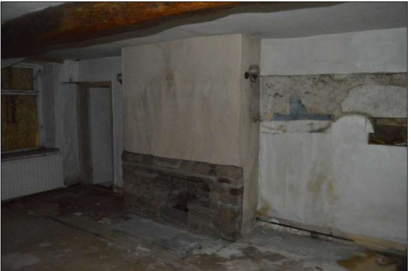
PL29: View south east within the central ground floor unit.