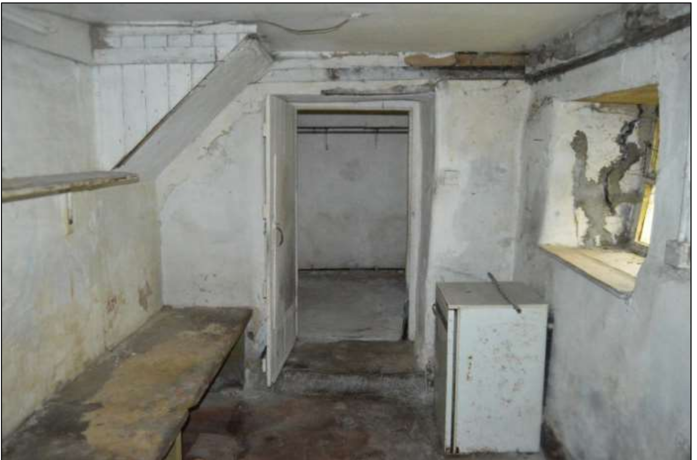
PL27: View west within the rear ground floor unit to the cross wing.