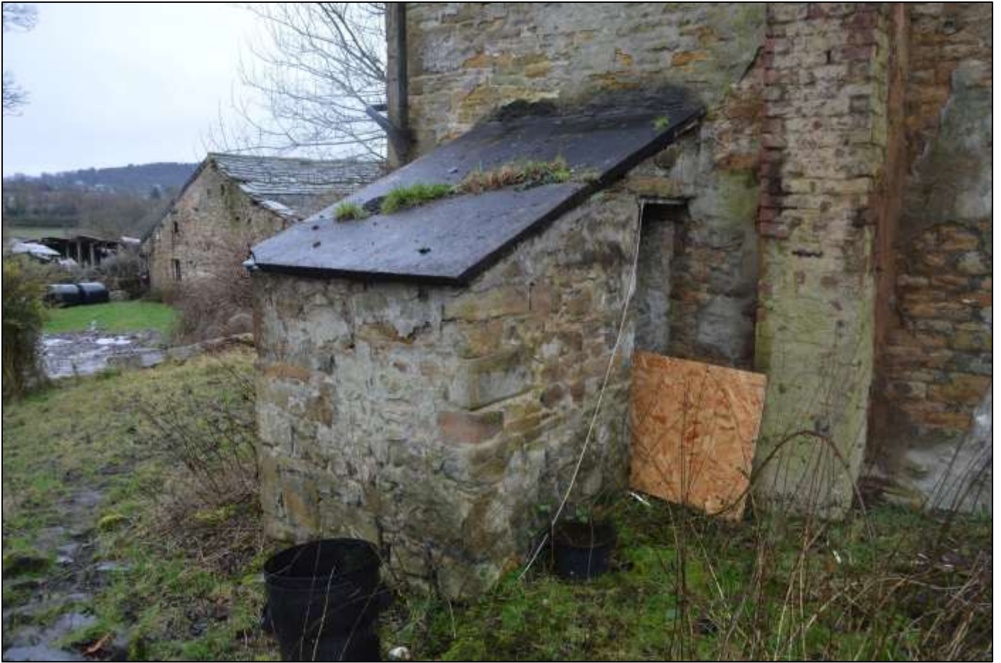
PL11: Former outbuilding to the east elevation of the farmhouse.