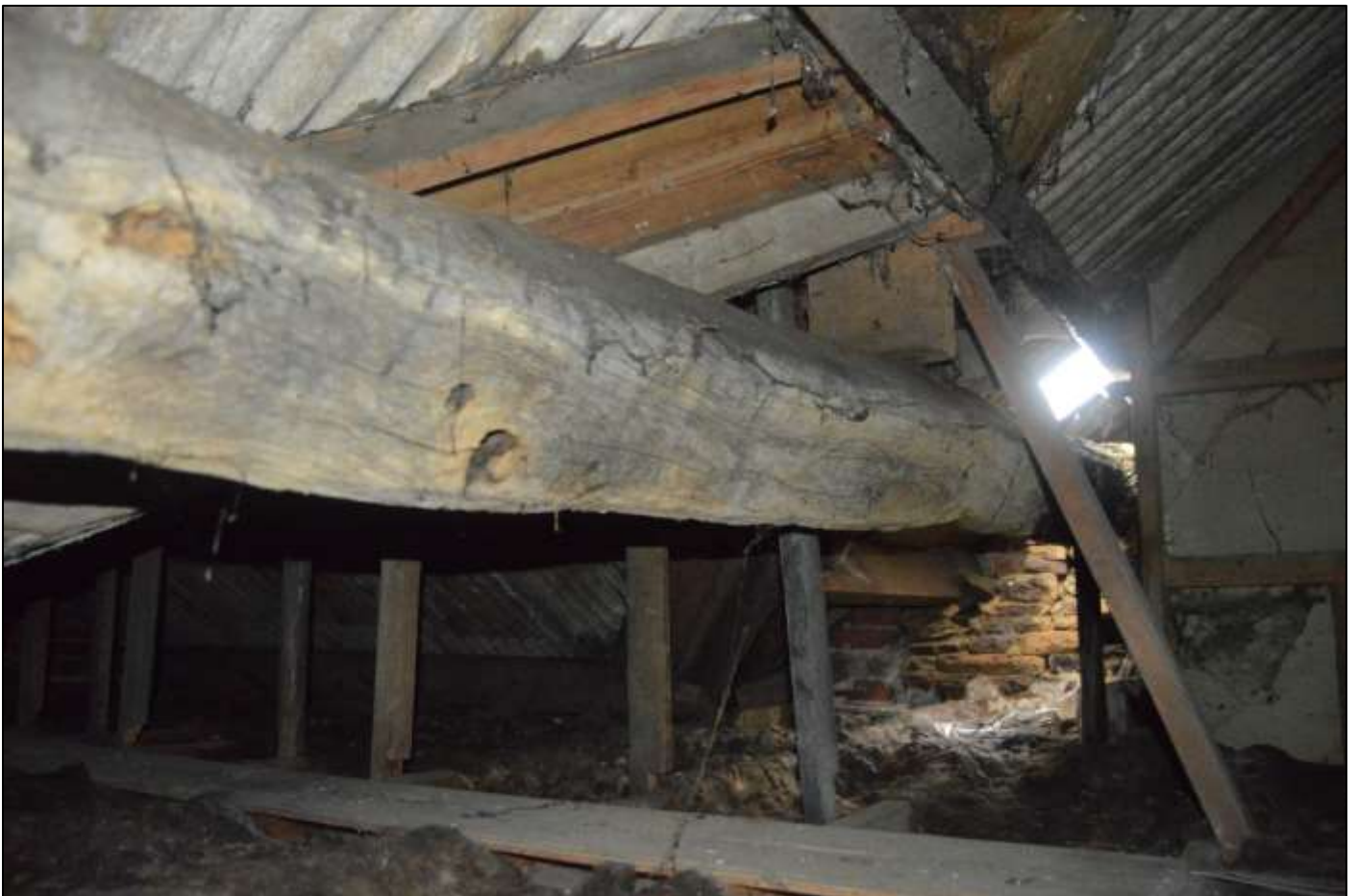
PL48: View south west within the cross-wing roof void.