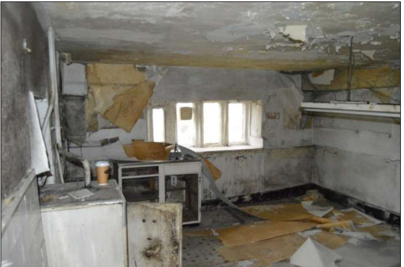
PL22: View south within the ground floor unit of the cross wing.