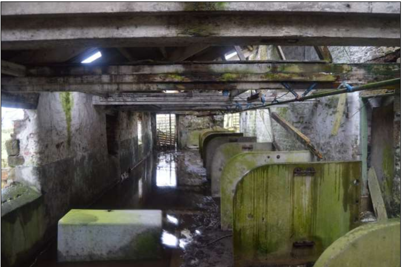
PL64: View west within the rear shippon.