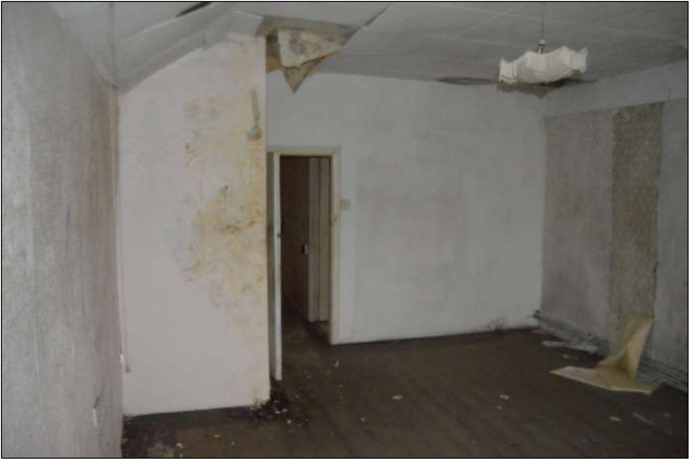
PL34: View north within the first-floor south unit of the cross wing.