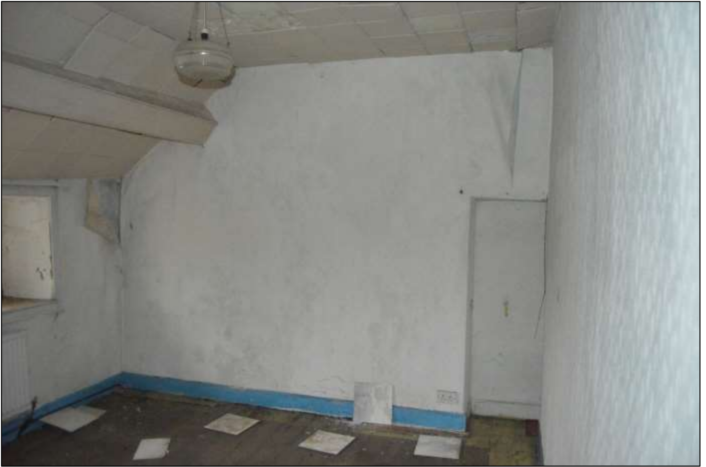
PL43: View west within the first floor south west bedroom.