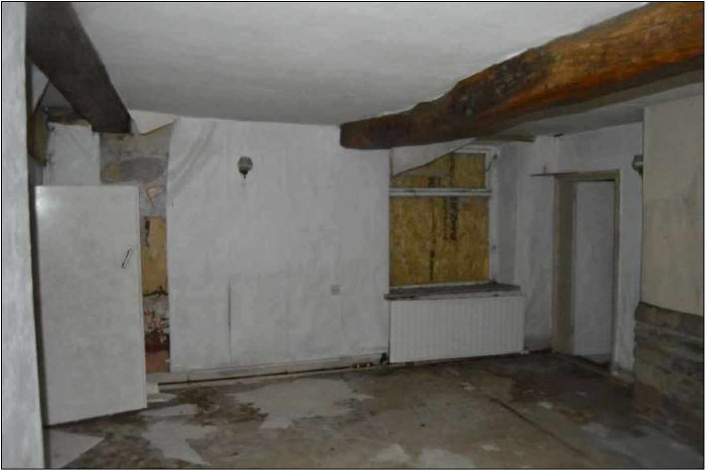
PL28: View south within the central ground floor unit.