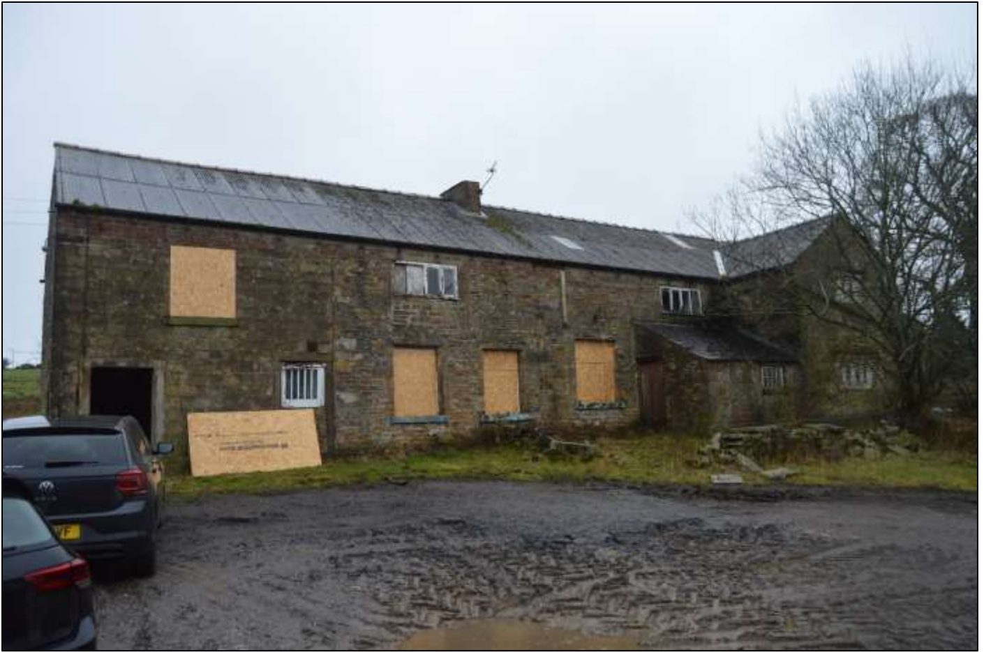
PL01: View of Lower Reaps Farmhouse from the south west.