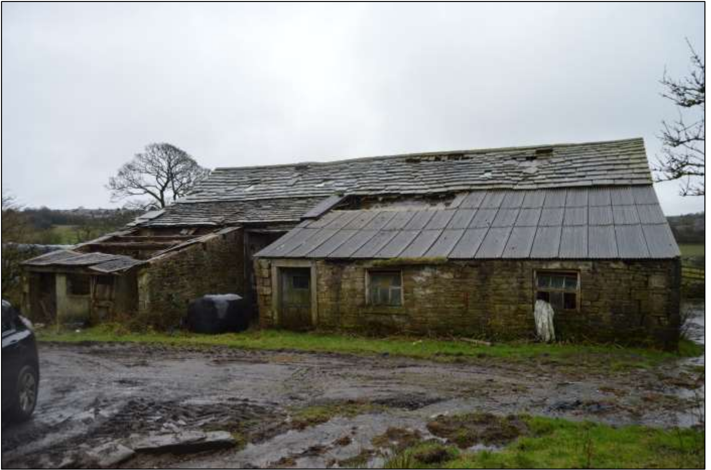
PL51: View of the front north elevation of the barn from the north east.