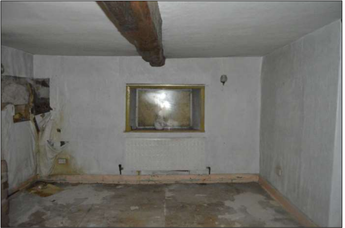
PL30: View north within the central ground floor unit.