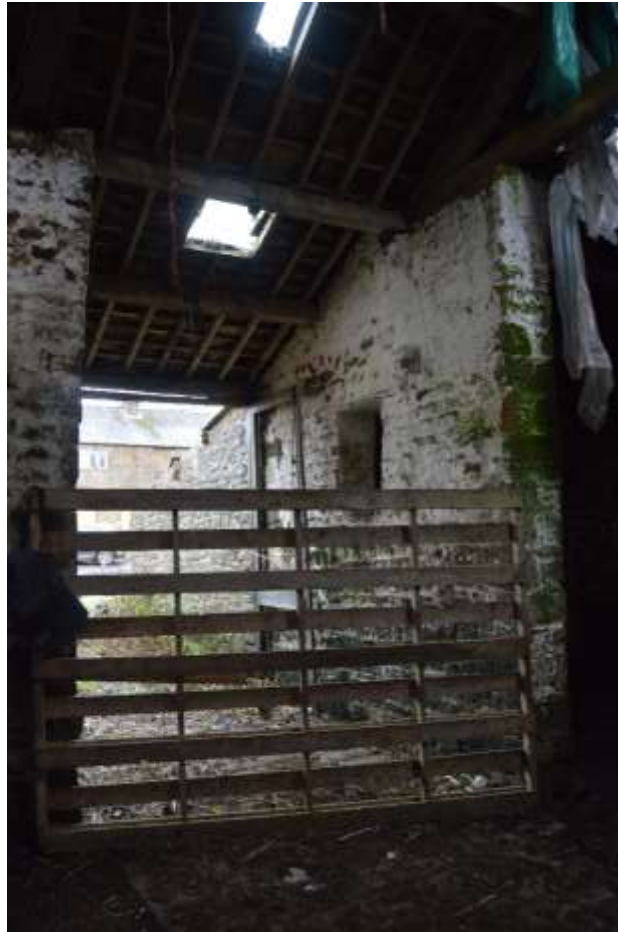
PL59: Internal view of the cart entry porch to the north elevation of the barn.