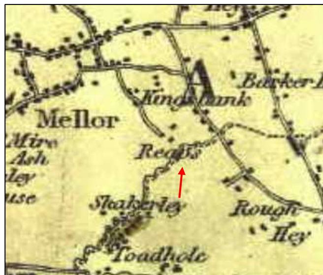
Fig 03: Extract of Greenwoods Map of Lancashire 1818.