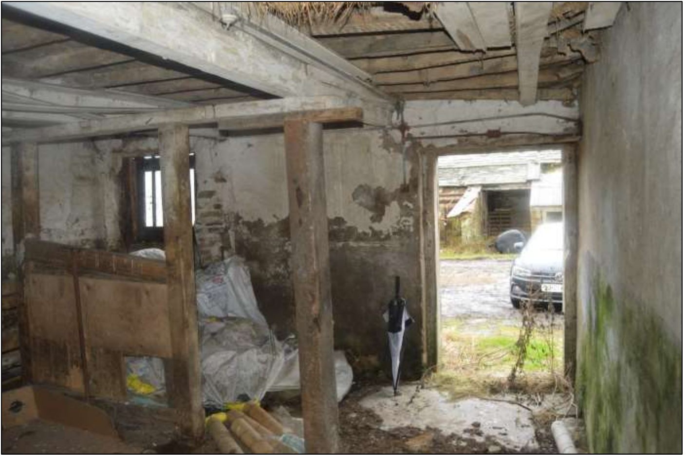
PL19: View south within the ground floor of the former stables.