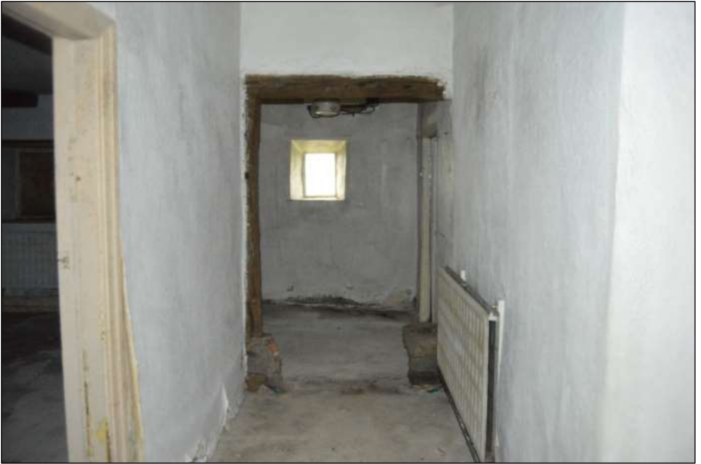
PL24: View north within the within the internal hallway to the ground floor between the cross wing and house body.