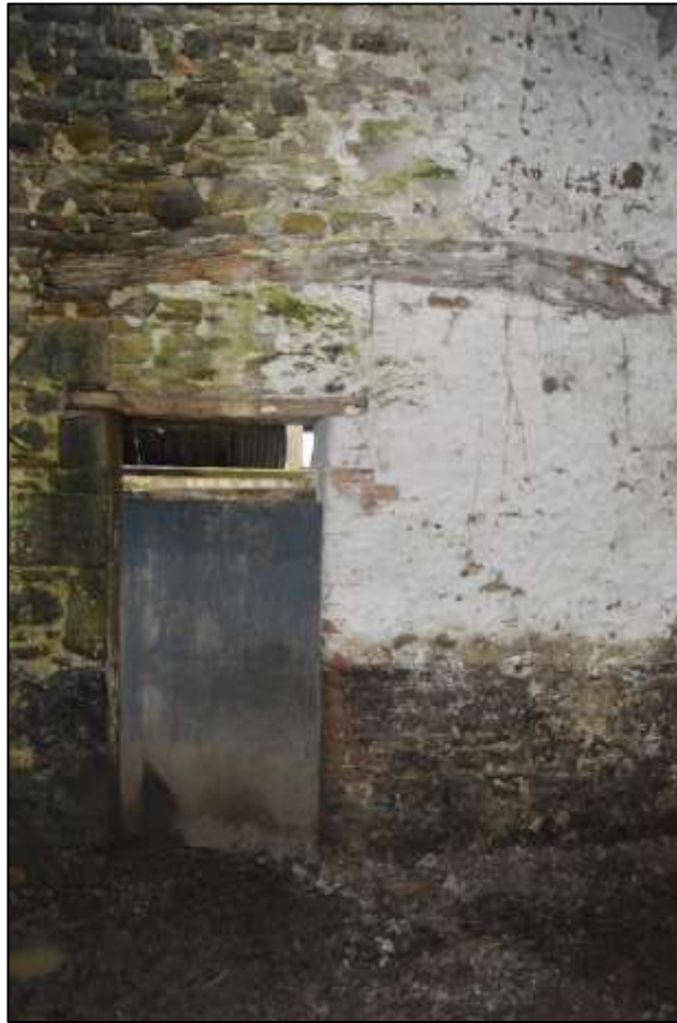
PL61: View of the opposing doorway (now blocked up) opposite the cart entry porch.