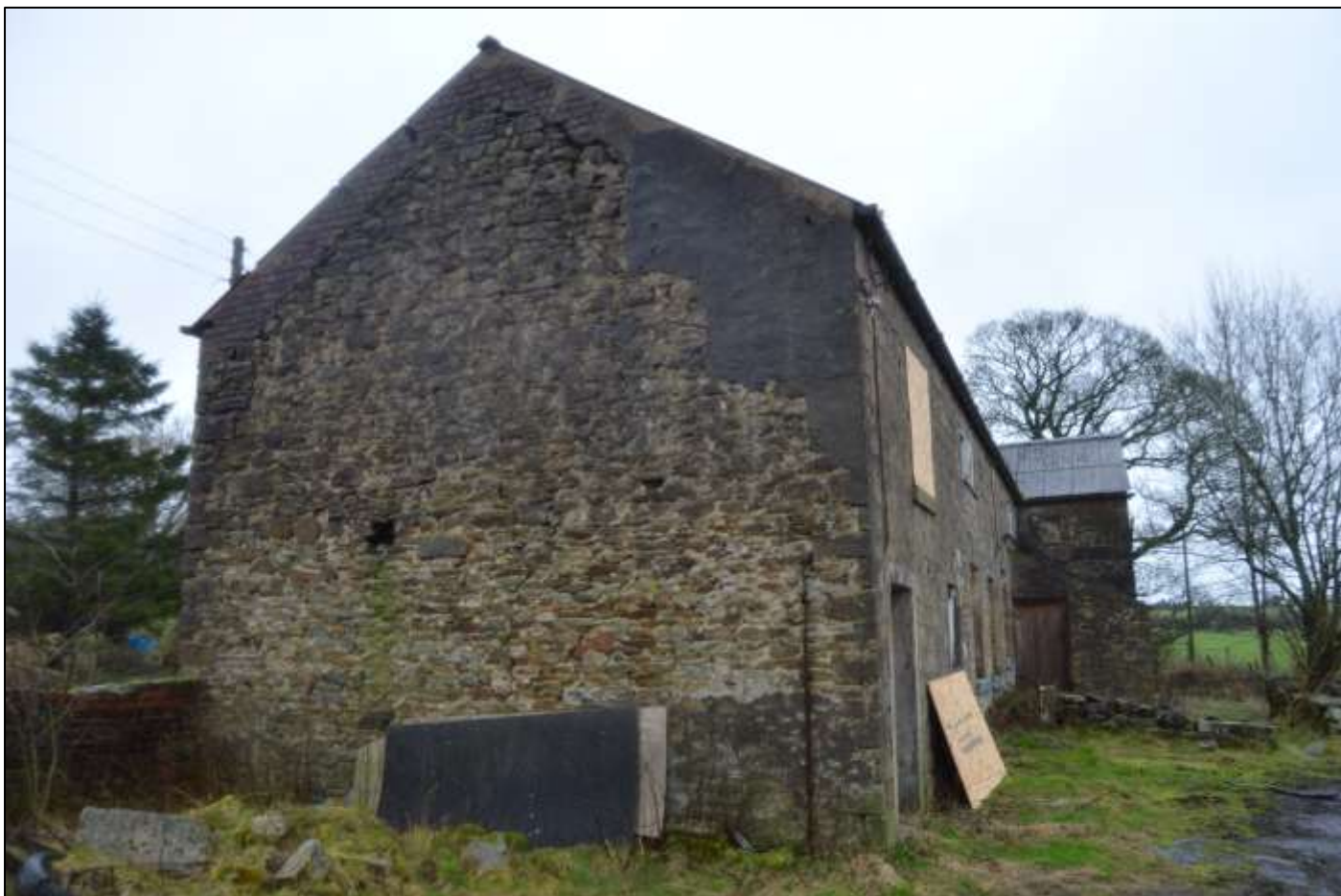
PL16: View of Lower Reaps Farmhouse from the west.