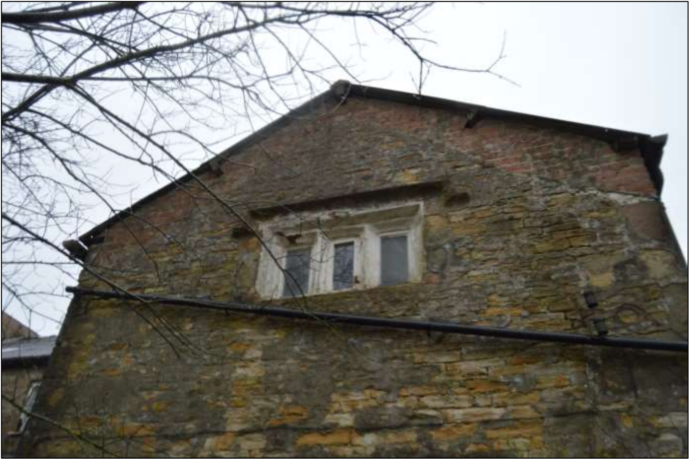
PL07: View of the three-light, stone mullioned window to the first floor of the cross wing.