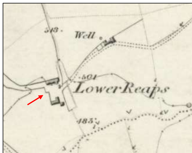
Fig 04: Extract from OS 1:10560 map, 1848