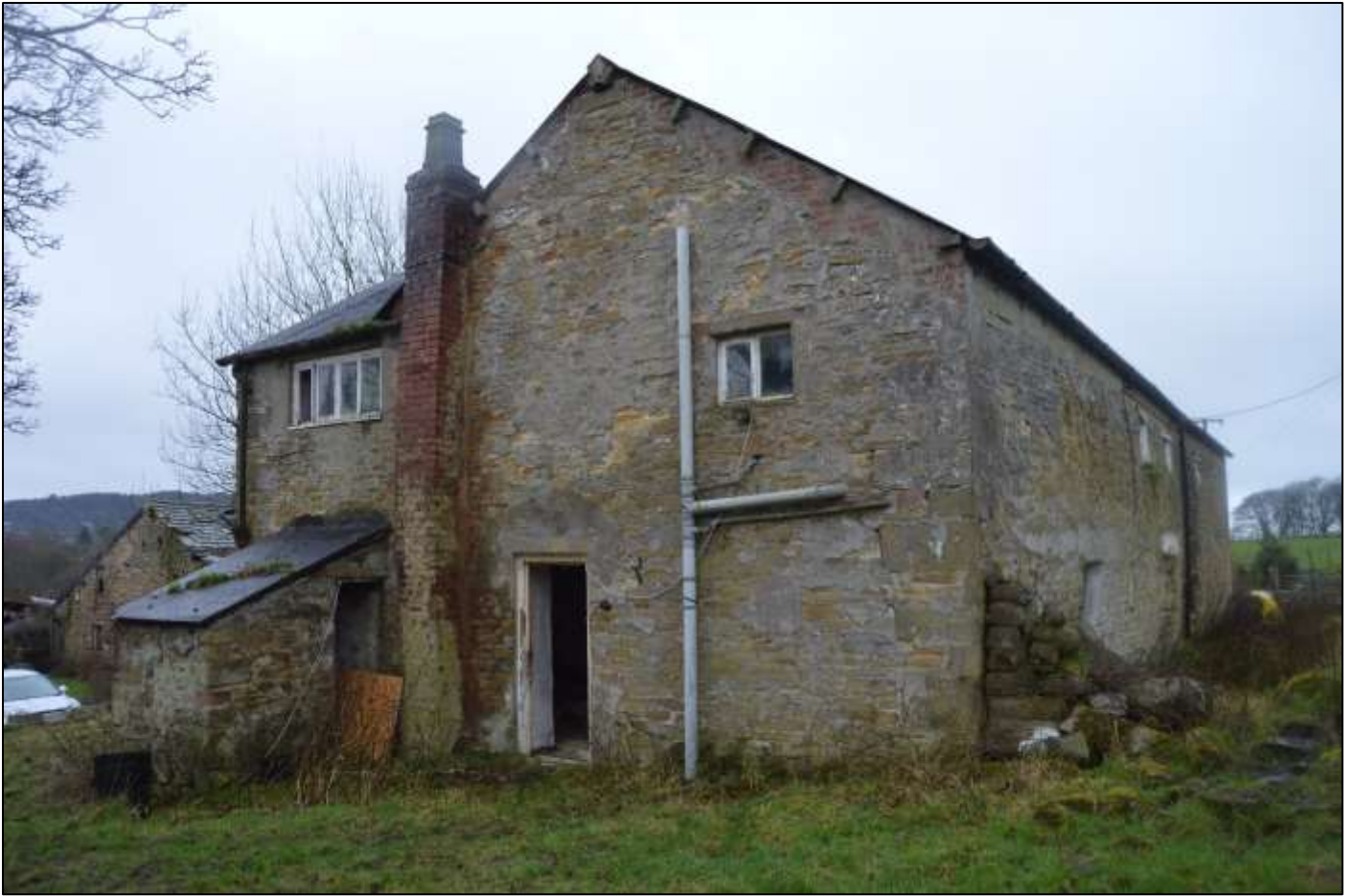
PL09: View of Lower Reaps Farmhouse from the east.