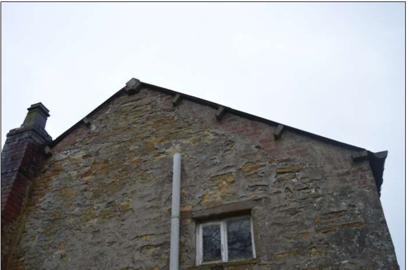
PL10: View of raised roof and old roofline to the east gable end.