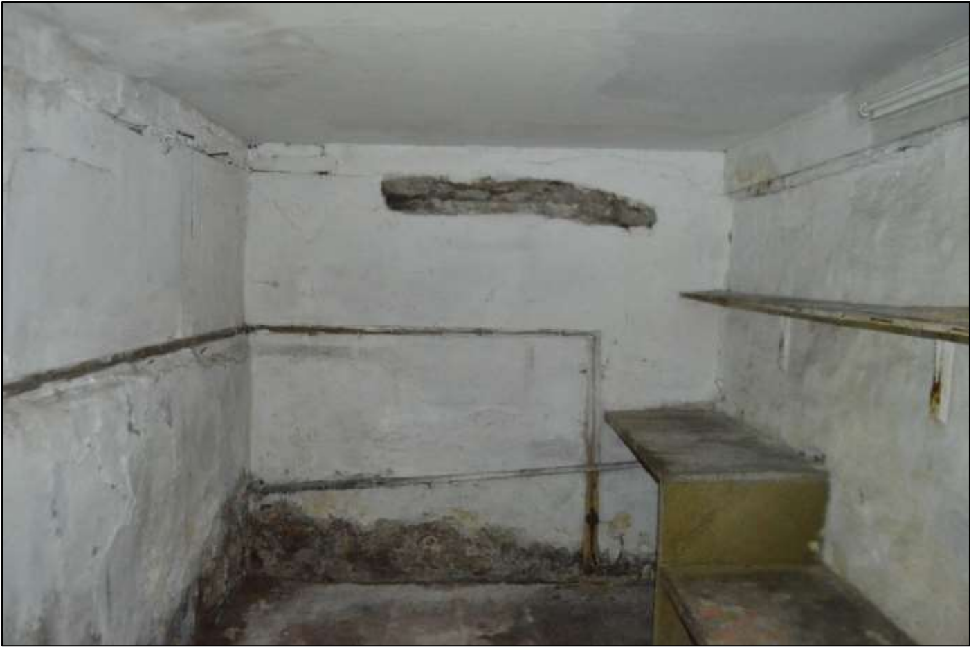
PL26: View east within the rear ground floor unit to the cross wing (note the timber lintel to the blocked window).