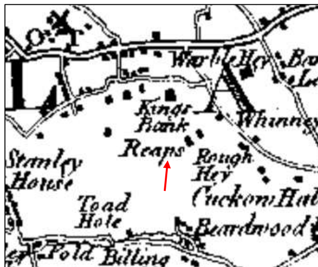
Fig 02: Extract of Yates Map of Lancashire 1786.

east of the farmhouse. And a second to the south east of the barn, neither of which are still standing and their purpose has not been deduced.