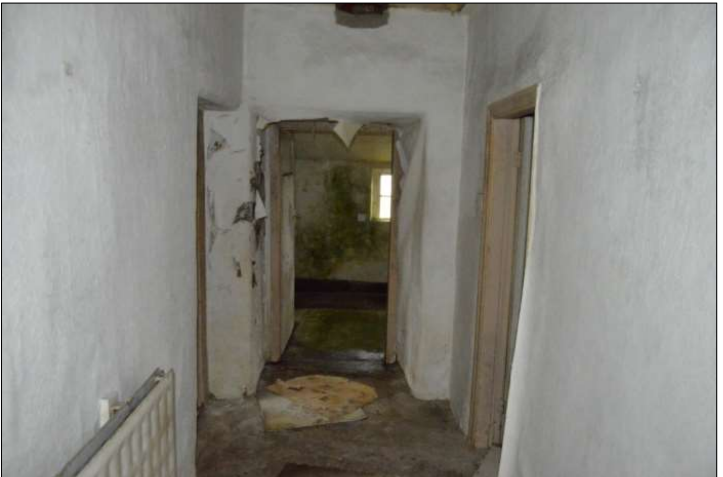
PL23: View south within the internal hallway to the ground floor between the cross wing and house body.