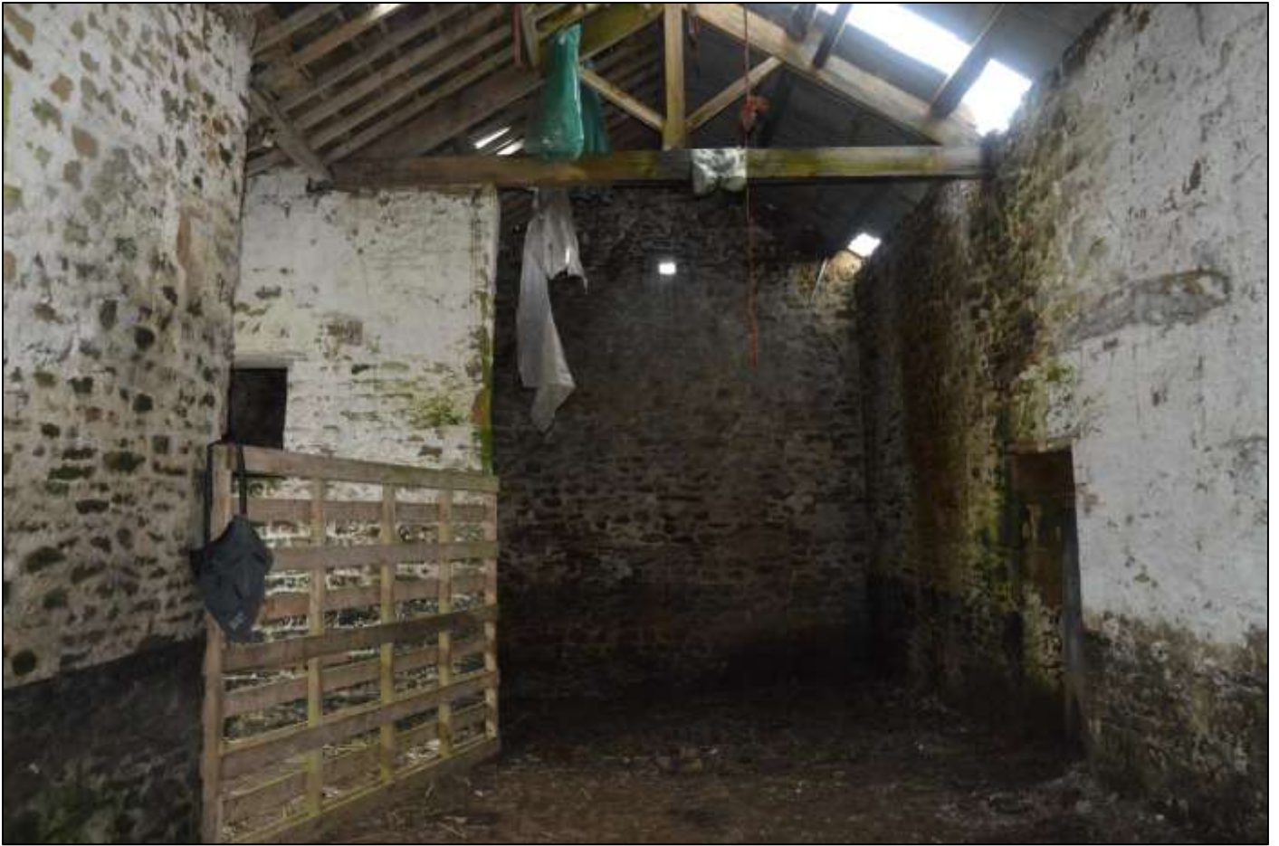
PL55: View east within the barn core.