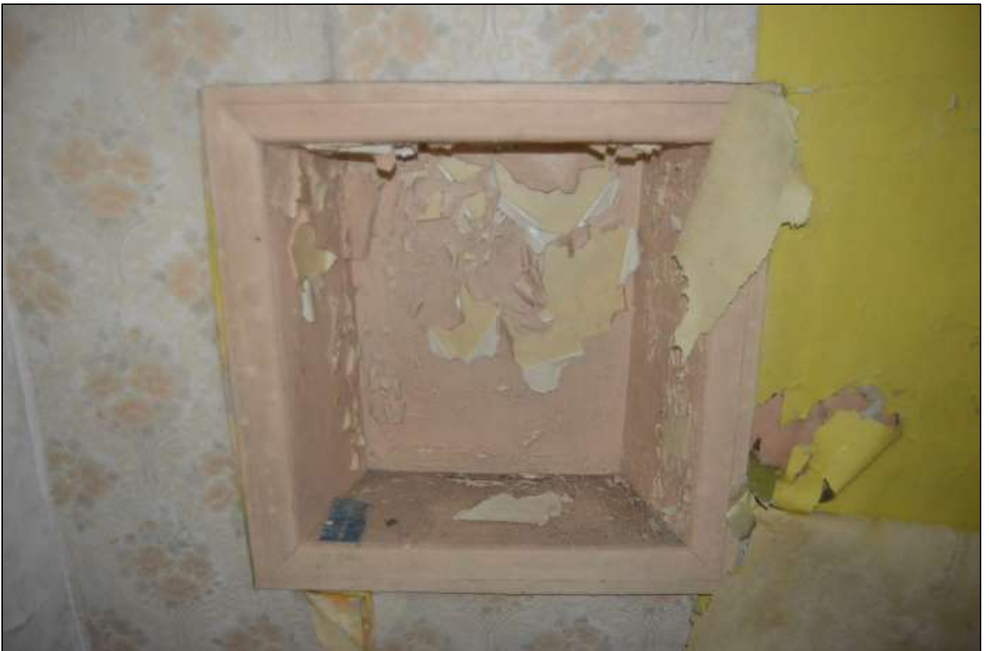
PL36: View of blocked possible former staircase window to the first-floor landing to the rear of the cross wing.