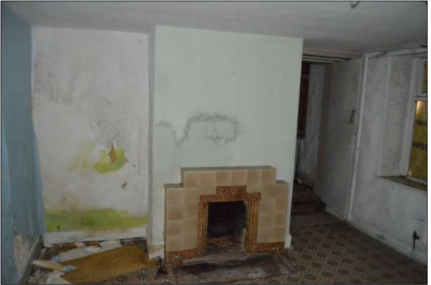
PL32: View east within the west ground floor unit.