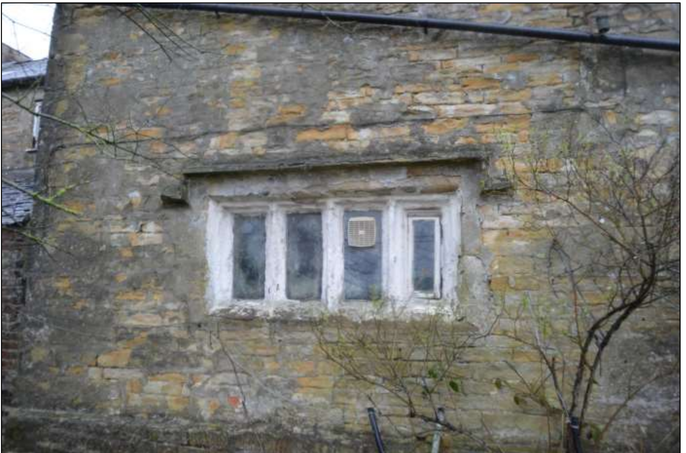
PL06: View of the four-light, stone mullioned window to the ground floor of the cross wing.