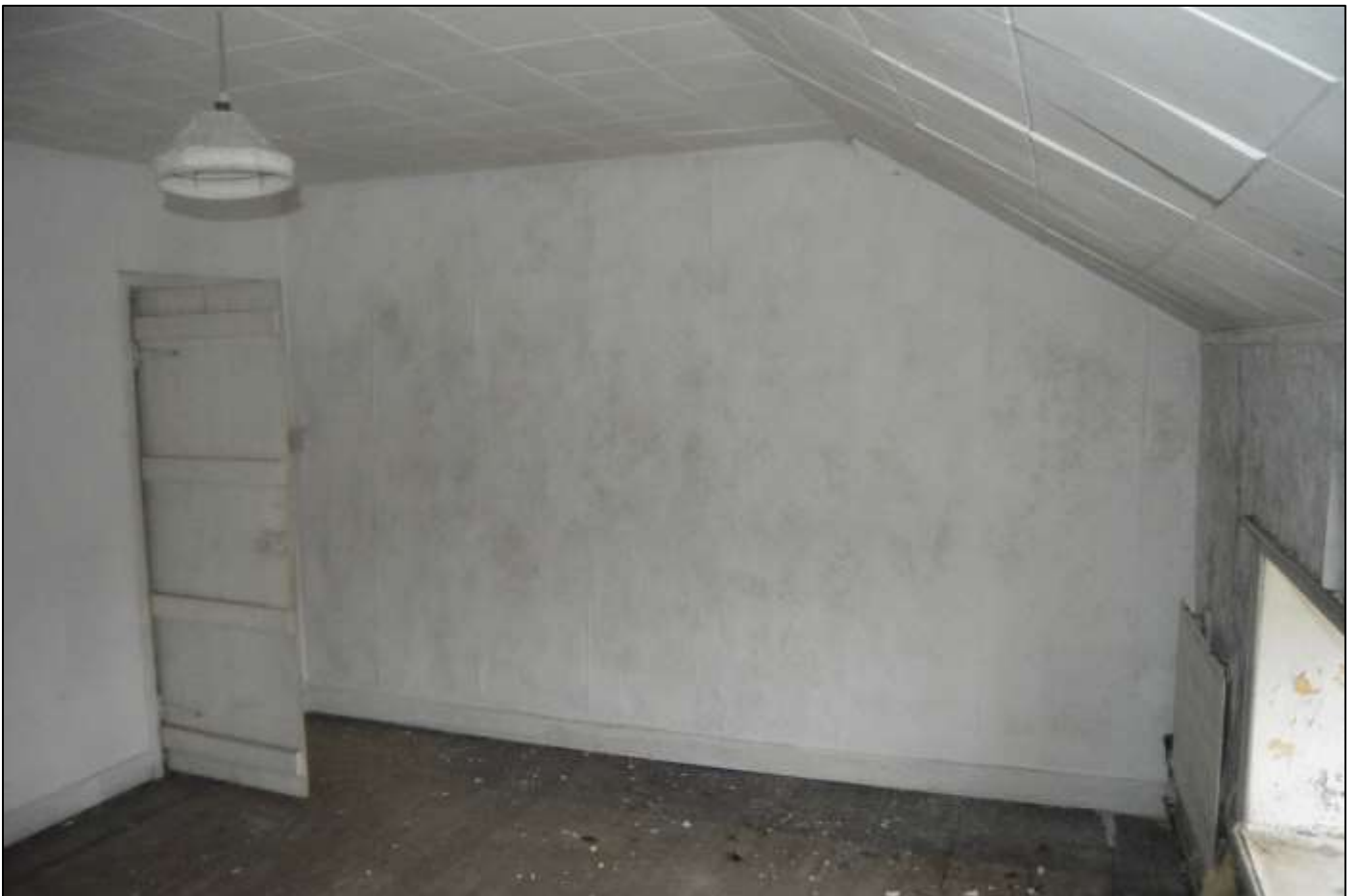
PL40: View east within the first-floor central bedroom.