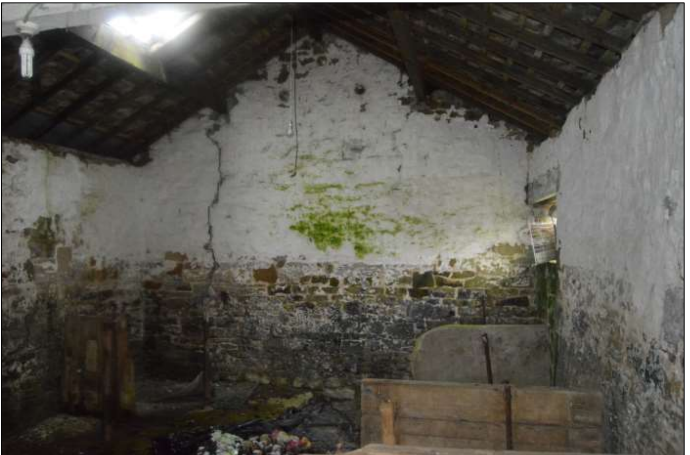
PL66: View north within the stone outbuilding.