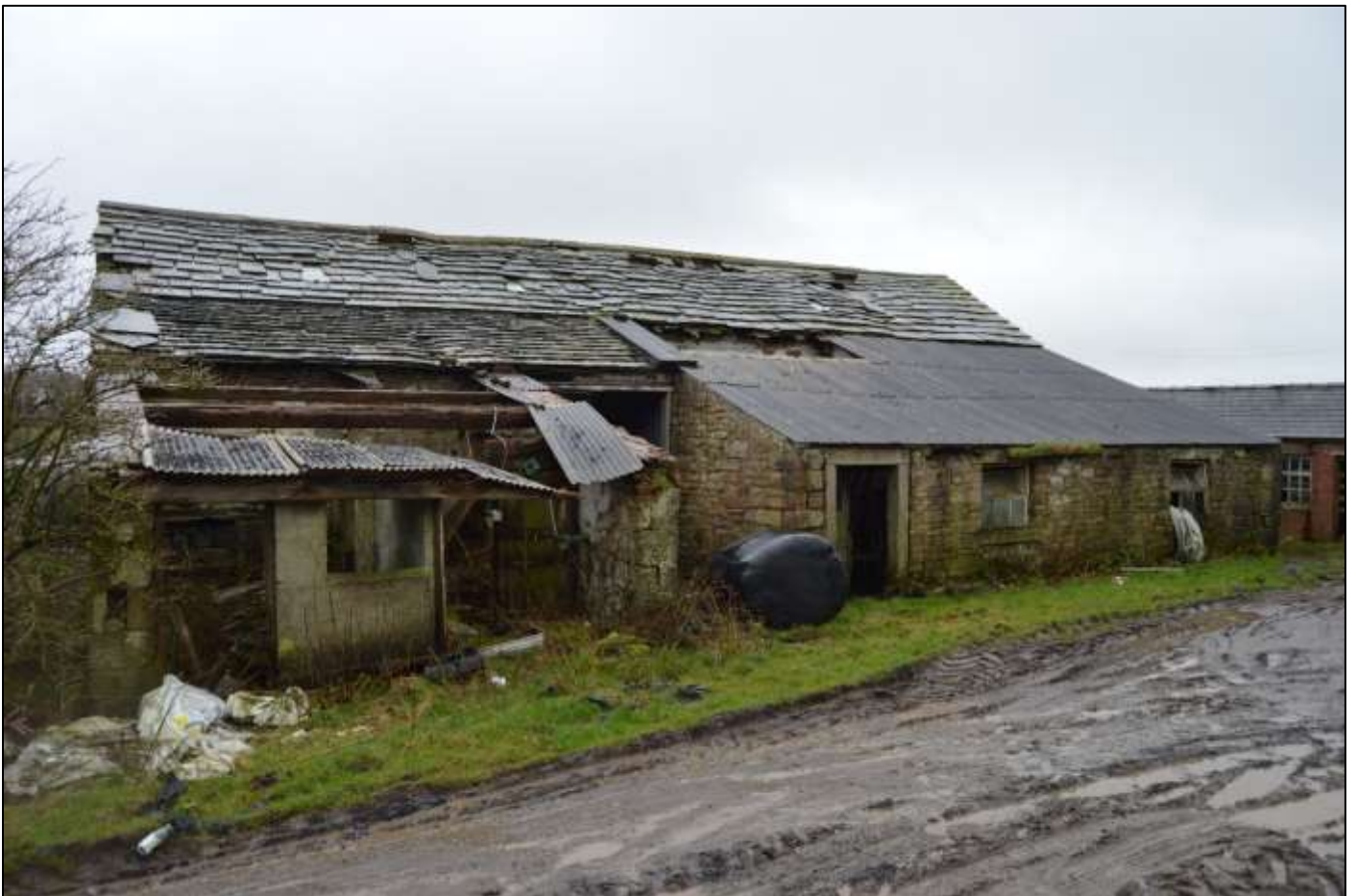
PL51: View of the front north elevation of the barn from the north east.