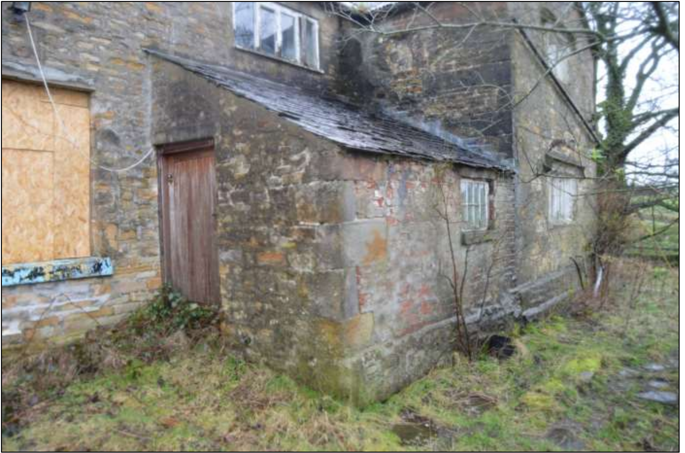
PL05: View of the lean-to to the front south elevation of the farmhouse.