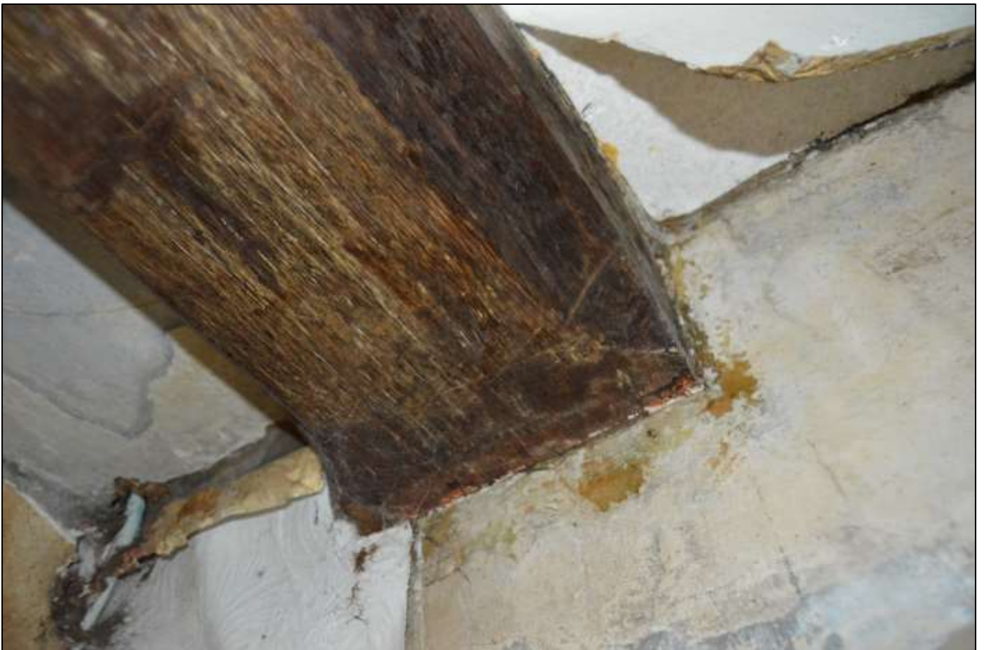
PL31: View of 17 th century floor beam within the central ground floor unit, with chamfers and stops.