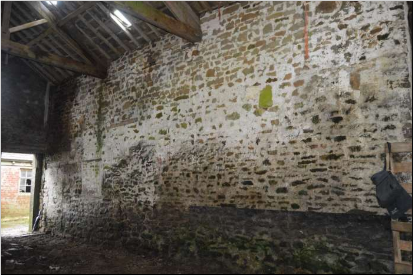
PL57: View north west within the barn core.