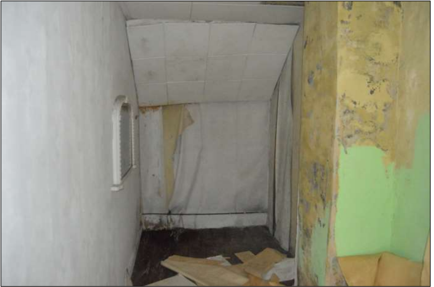
PL41: View south within the central landing space.