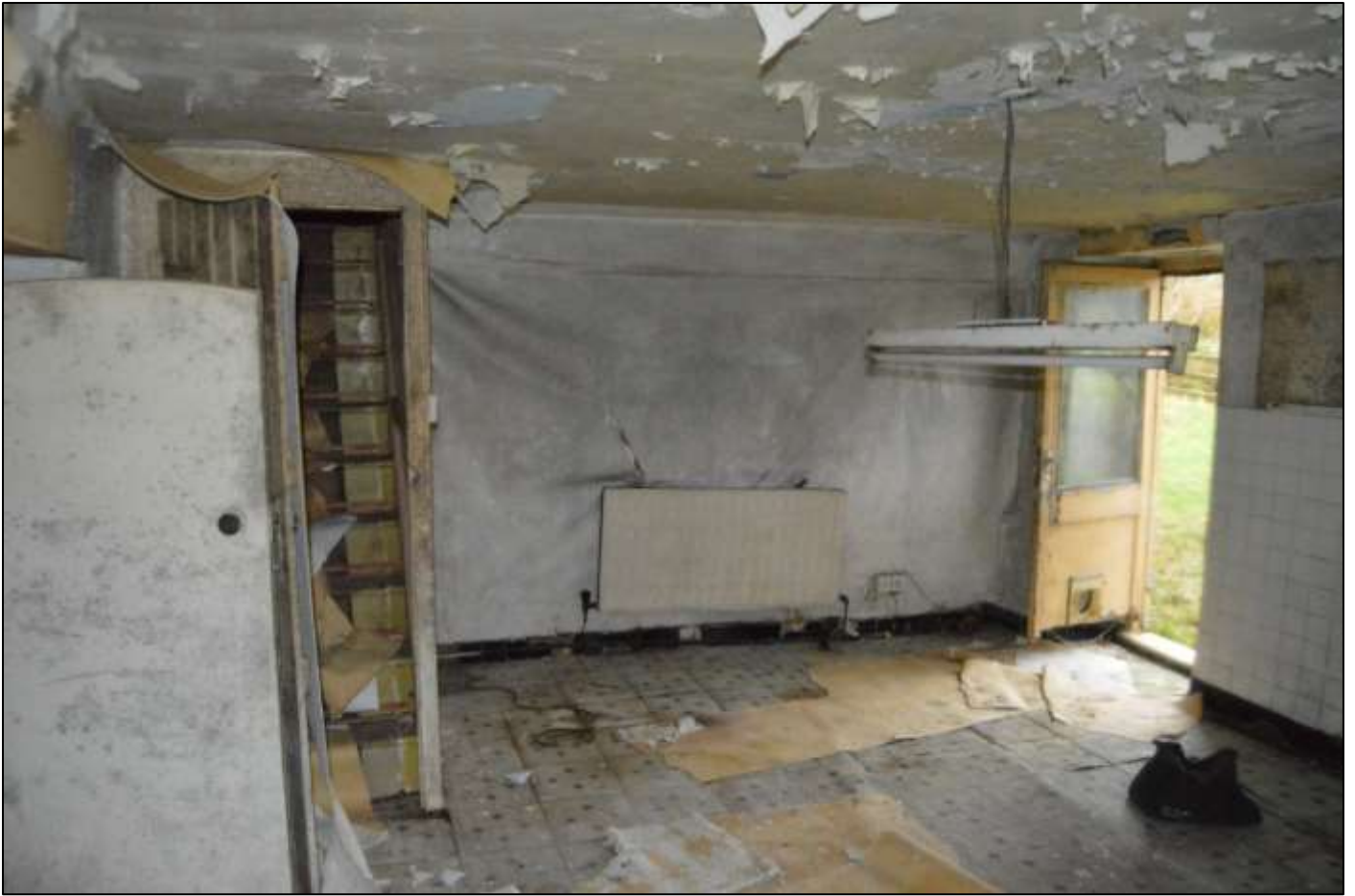
PL22: View north within the ground floor unit of the cross wing.