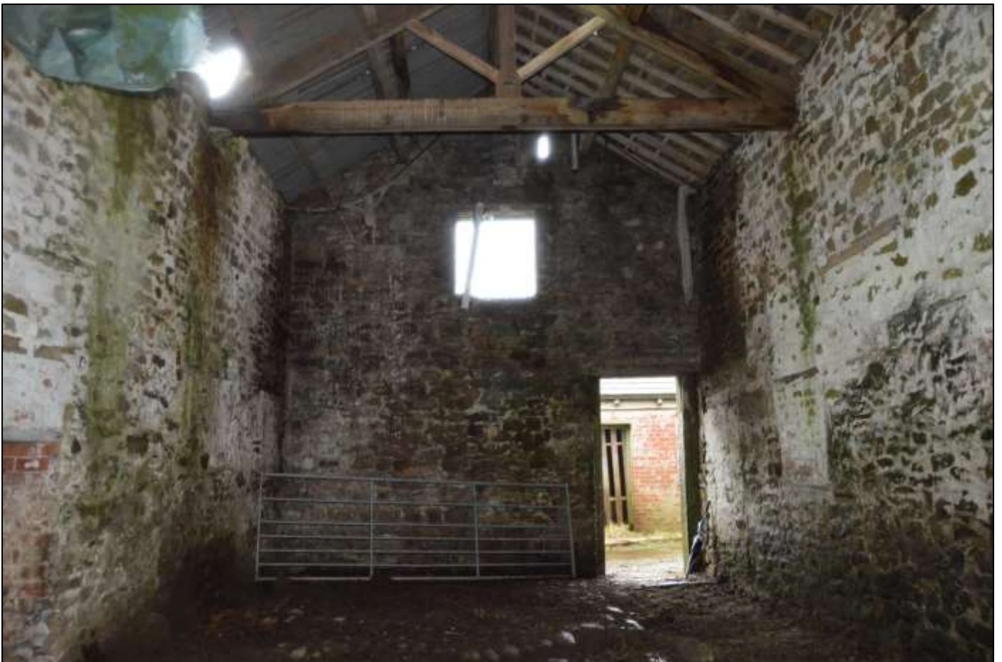
PL58: View west within the barn core.