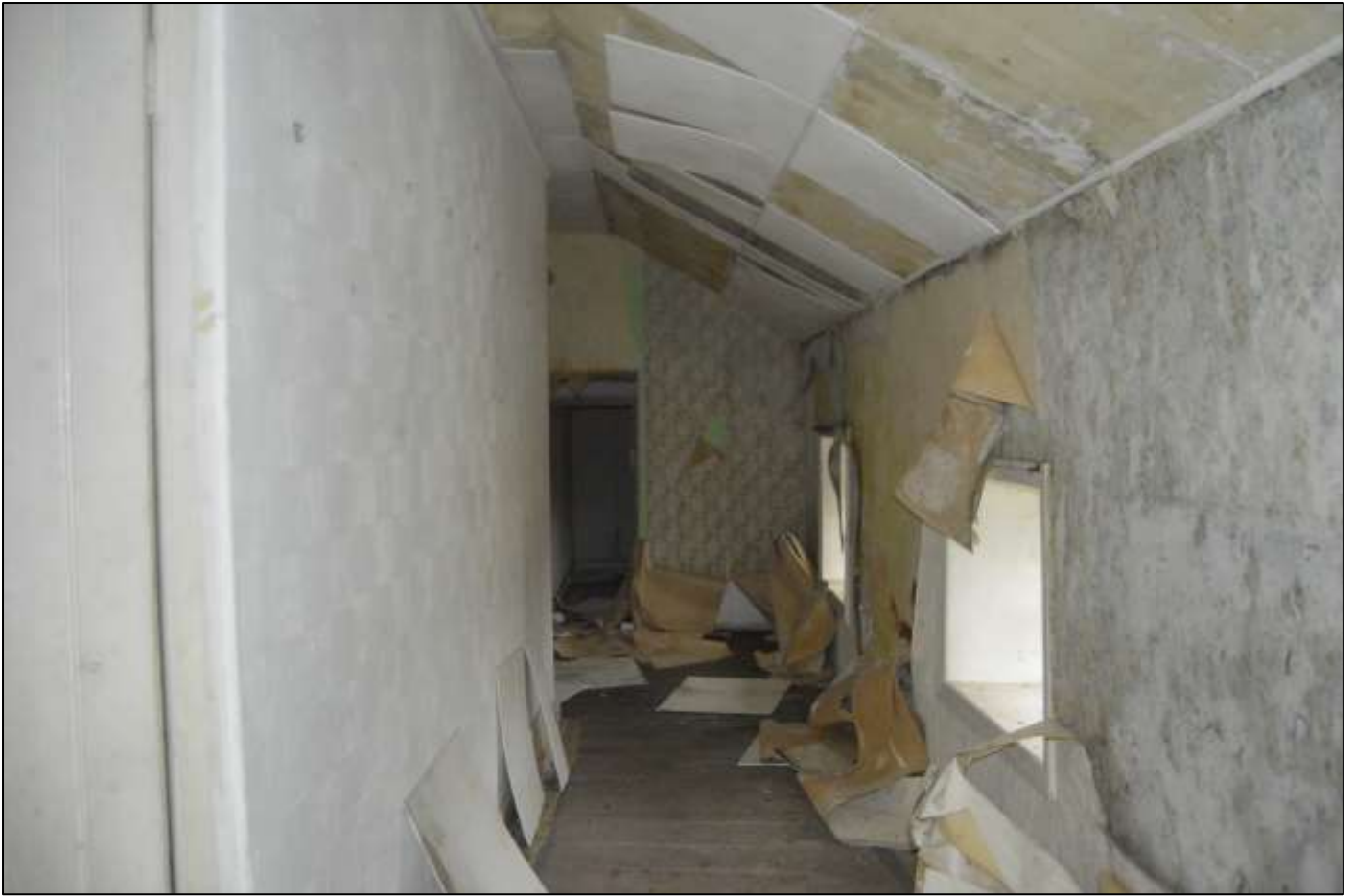
PL37: View west along the first-floor corridor / landing to the rear of the building.