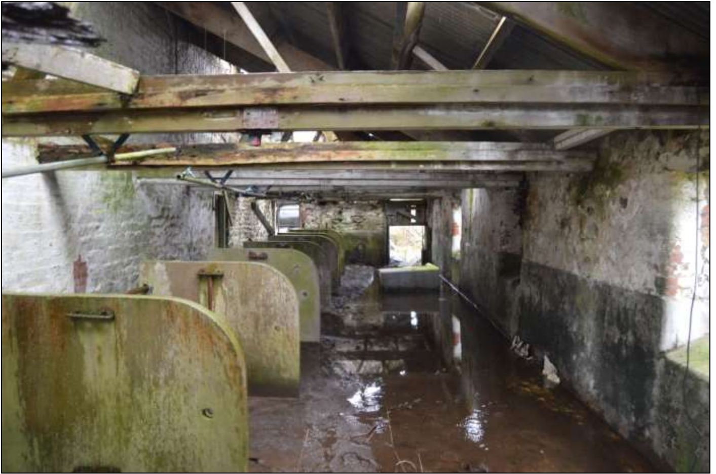
PL63: View east within the rear shippon.