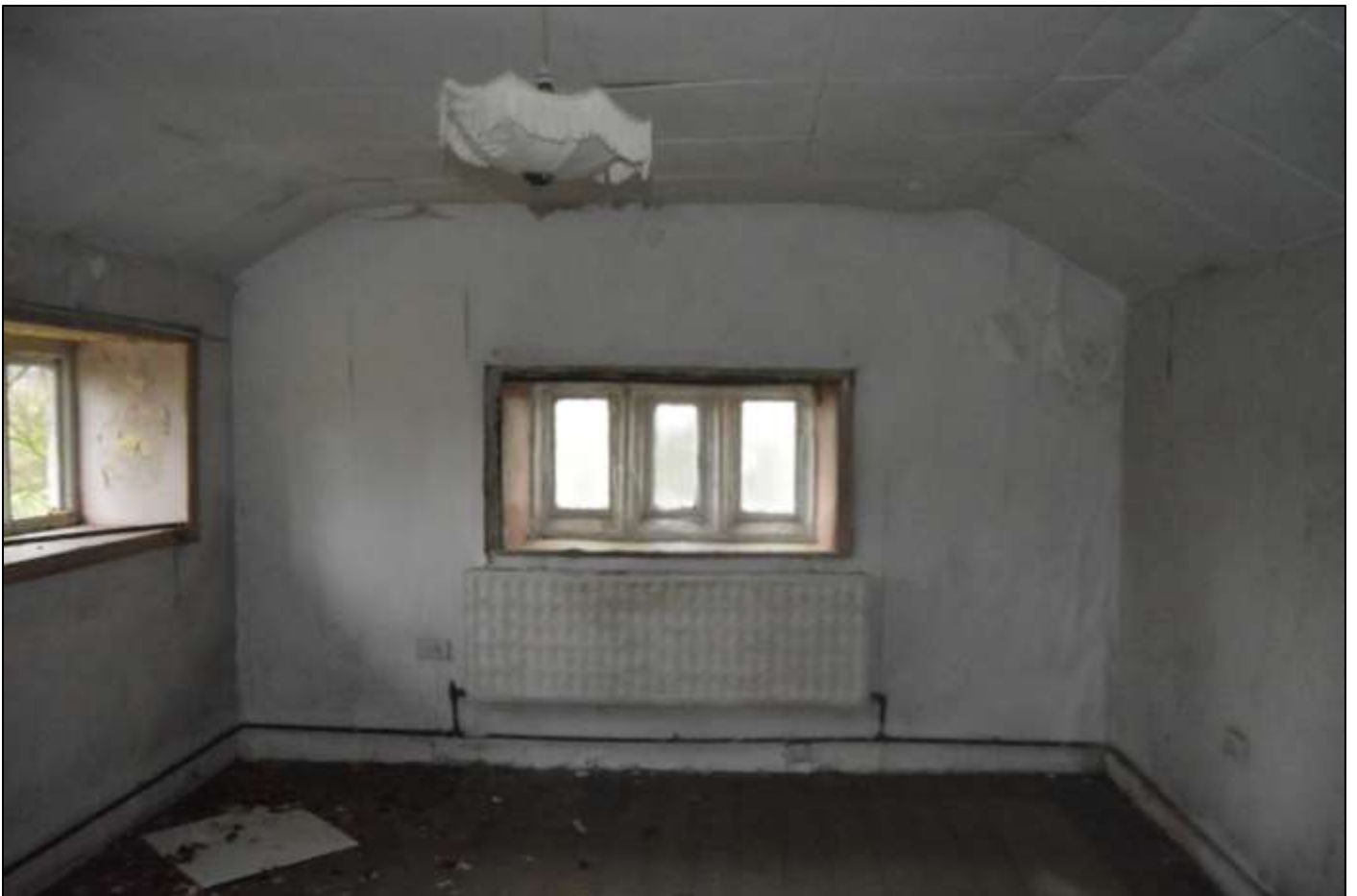
PL34: View south within the first-floor south unit of the cross wing.