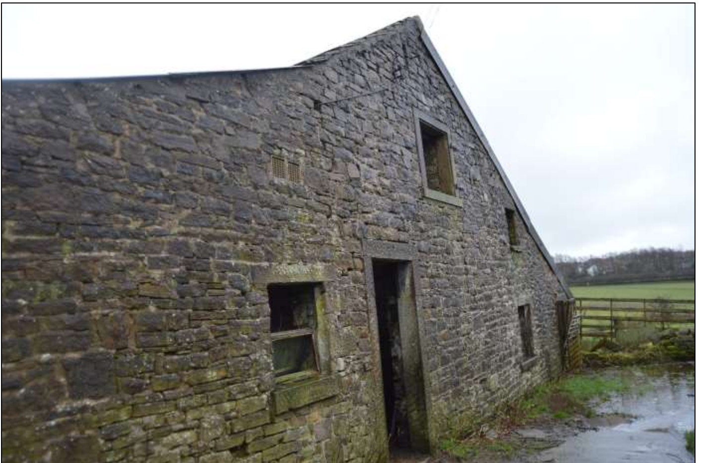
PL54: View of side west elevation of the barn from the north west.