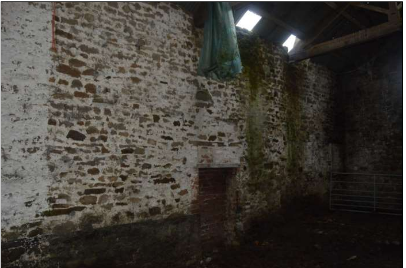
PL56: View south west within the barn core.