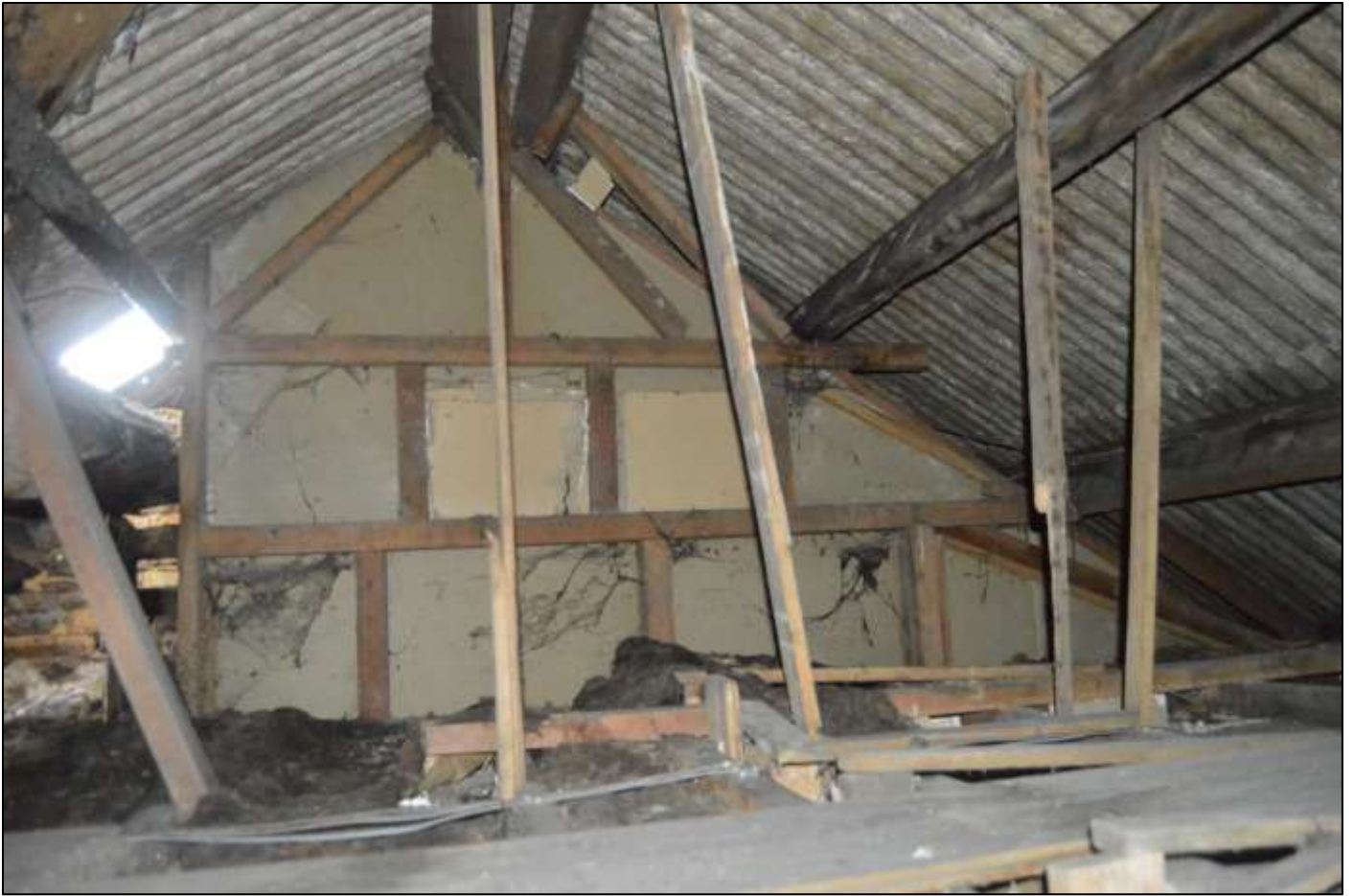
PL49: View west within the cross wing roof void.