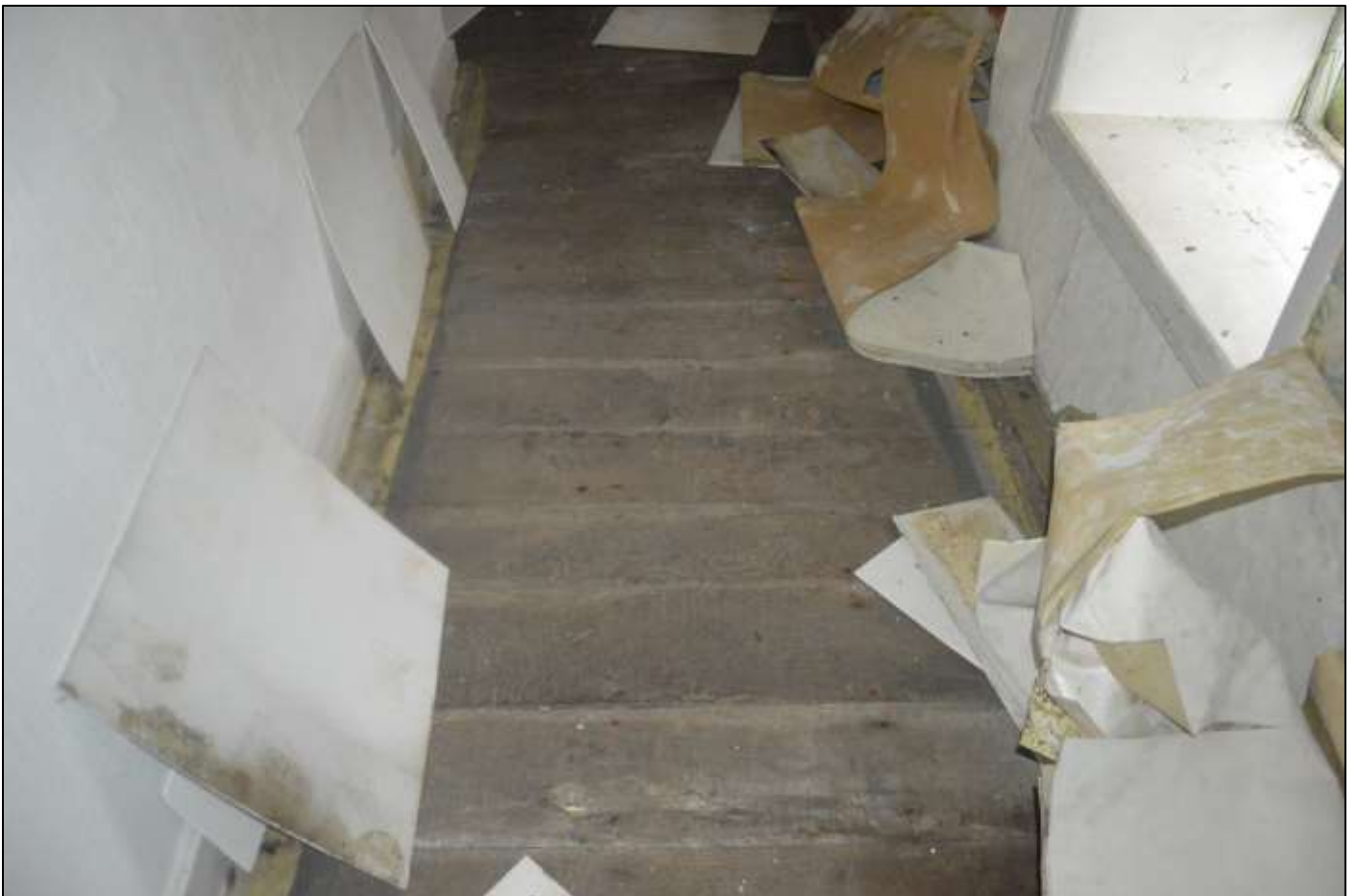
PL38: View of the timber floorboards to the corridor / landing to the rear of the building.