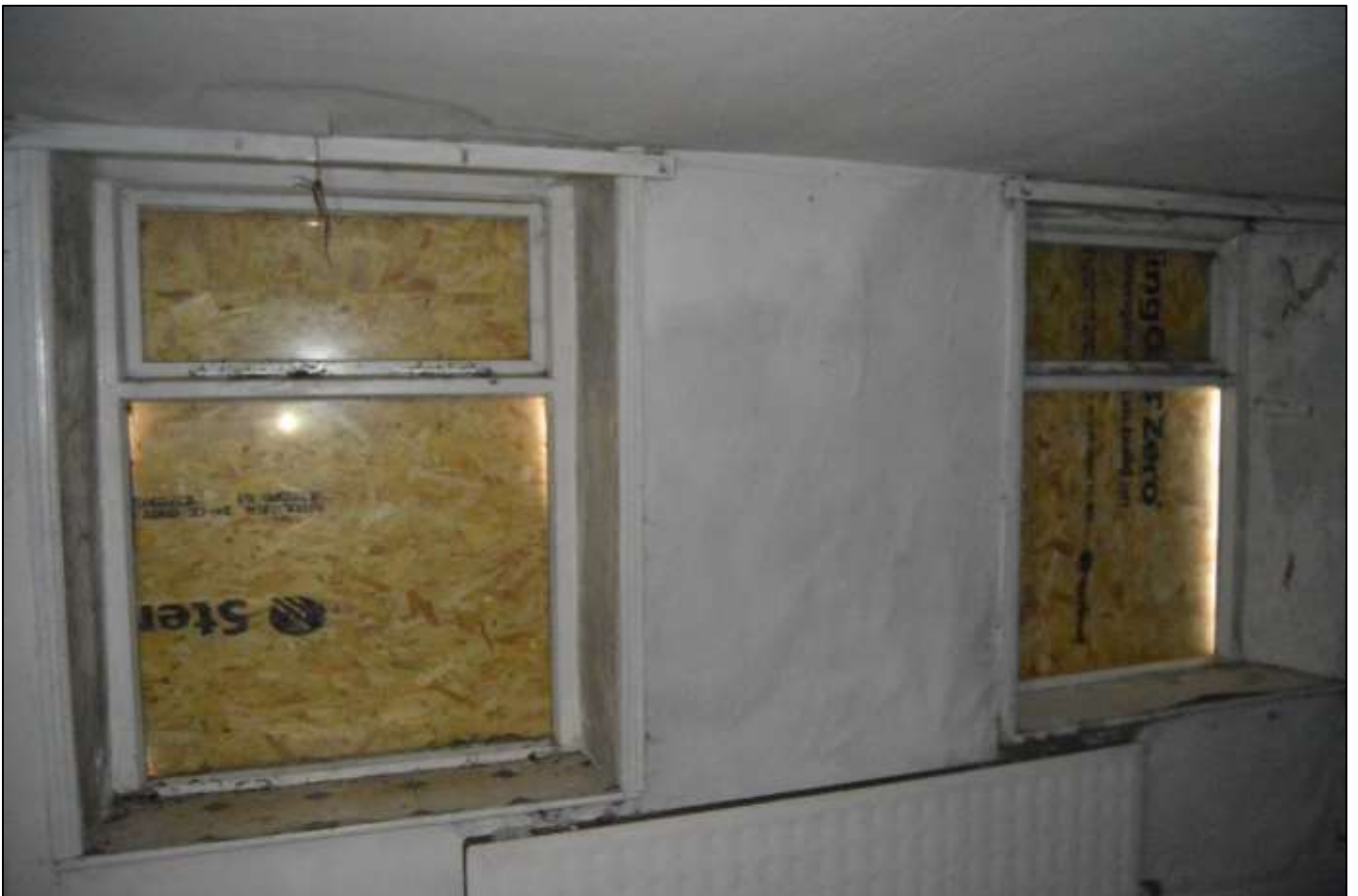
PL33: View south within the west ground floor unit.