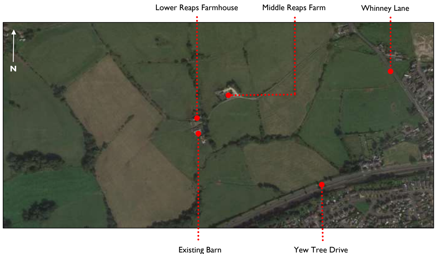
Fig 01: Plan Showing Location of Lower Reaps Farm

The farmhouse occupies an elevated position as the access road sweeps around the front of the building from the east and is flanked at the entrance to the site by a small number of trees. The former barn lies directly opposite the house to the south approximately 20m away. A further two outbuildings lie to the west edge of the site. The immediate surroundings are rural in nature consisting of open countryside, presumed to be farmland. However, the built up sub-urban fringe of Blackburn lies approximately 300m to the south and is primarily characterised by large semi-detached dwellings dating from the 1930's and 1940's.