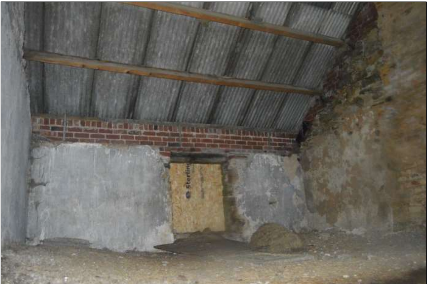
PL20: View south within the first floor of the former stables.