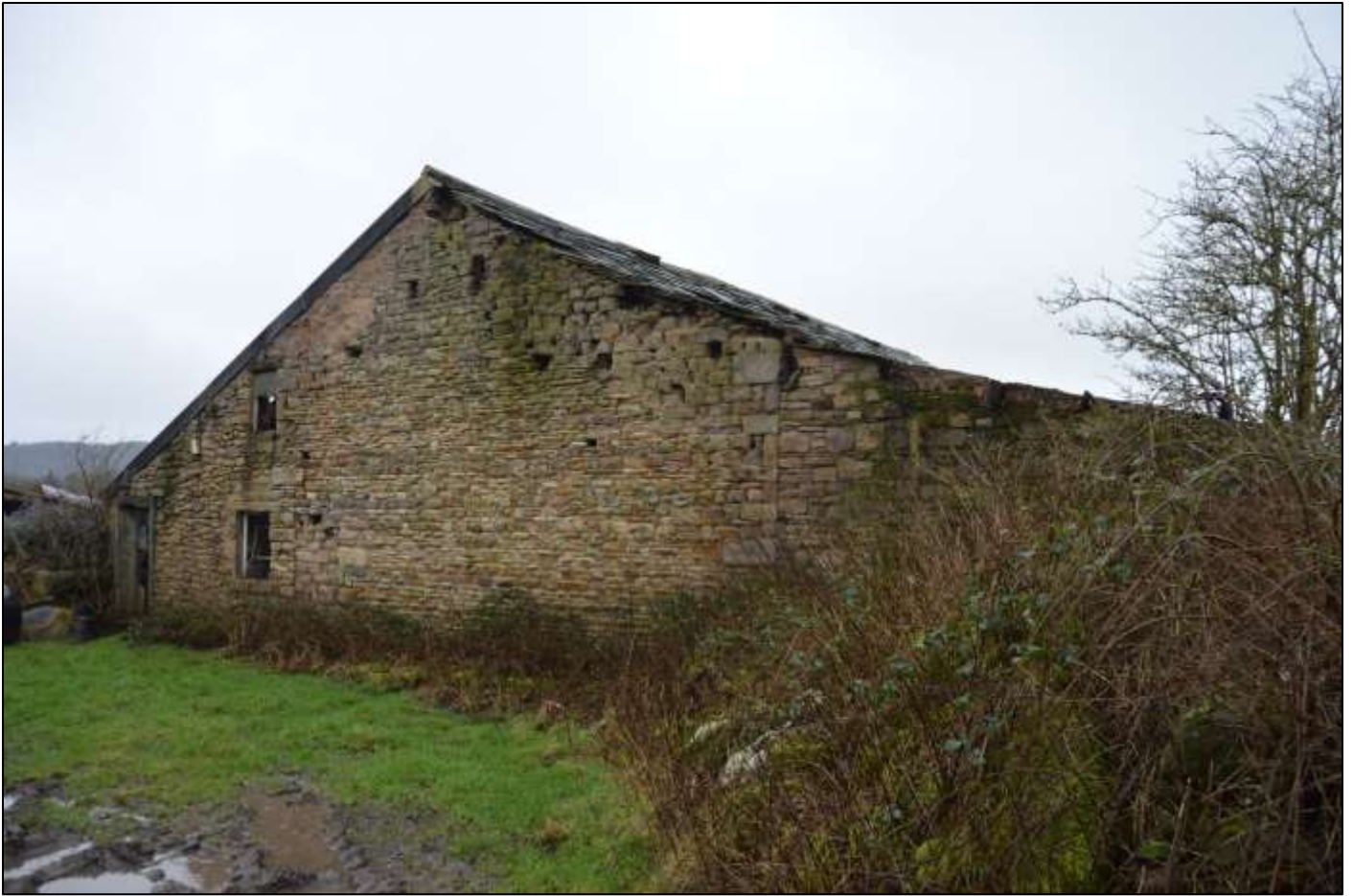
PL53: View of side east elevation of the barn from the north east.