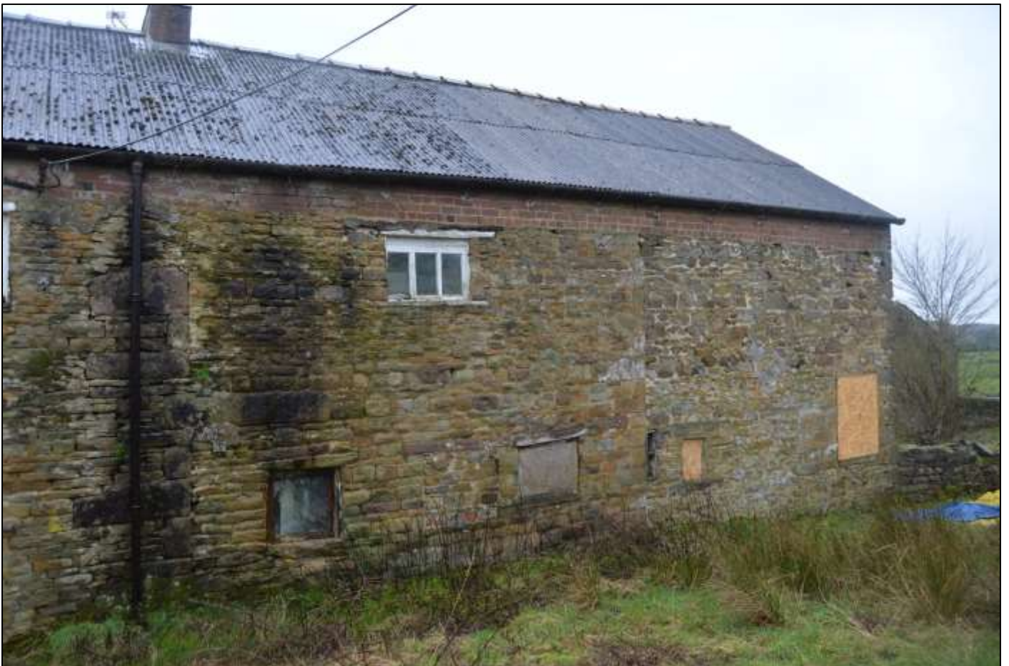
PL14: View of the western half of the rear elevation from the north.