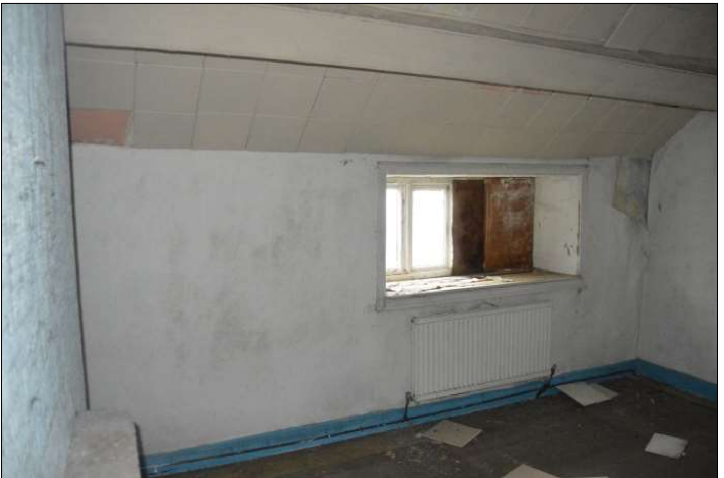
PL44: View south west within the first floor south west bedroom.