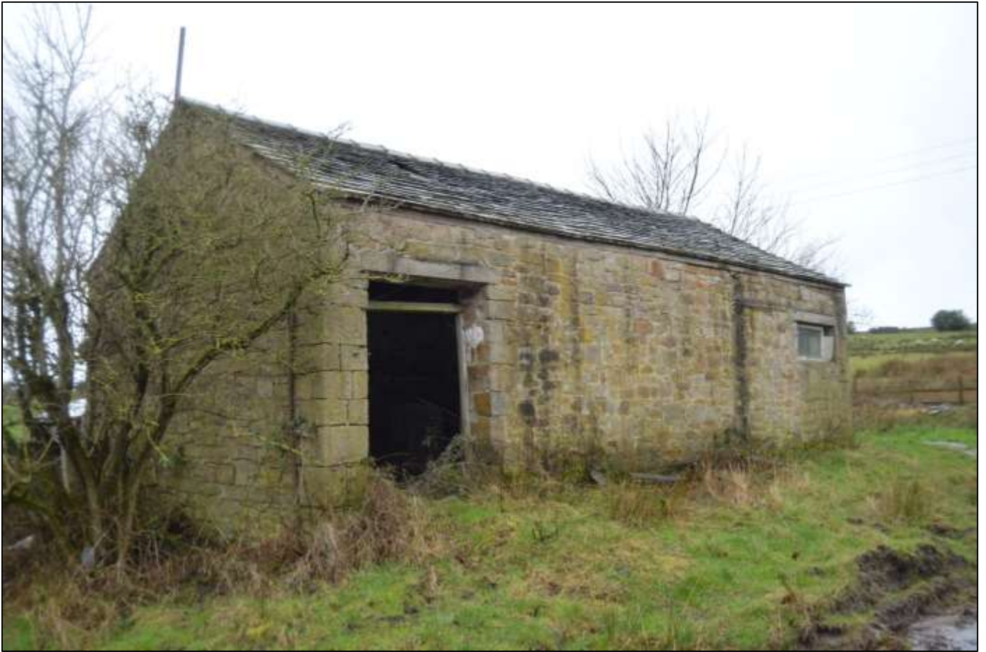
PL65: View of the stone outbuilding from the south east.