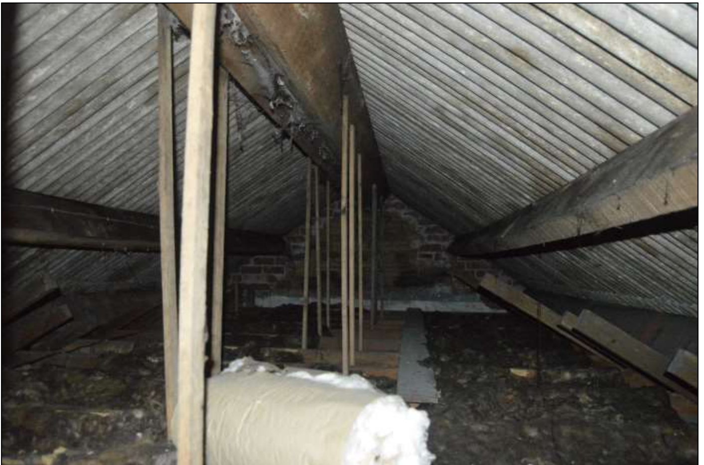
PL50: View east along the roof void over the west end of the farmhouse.