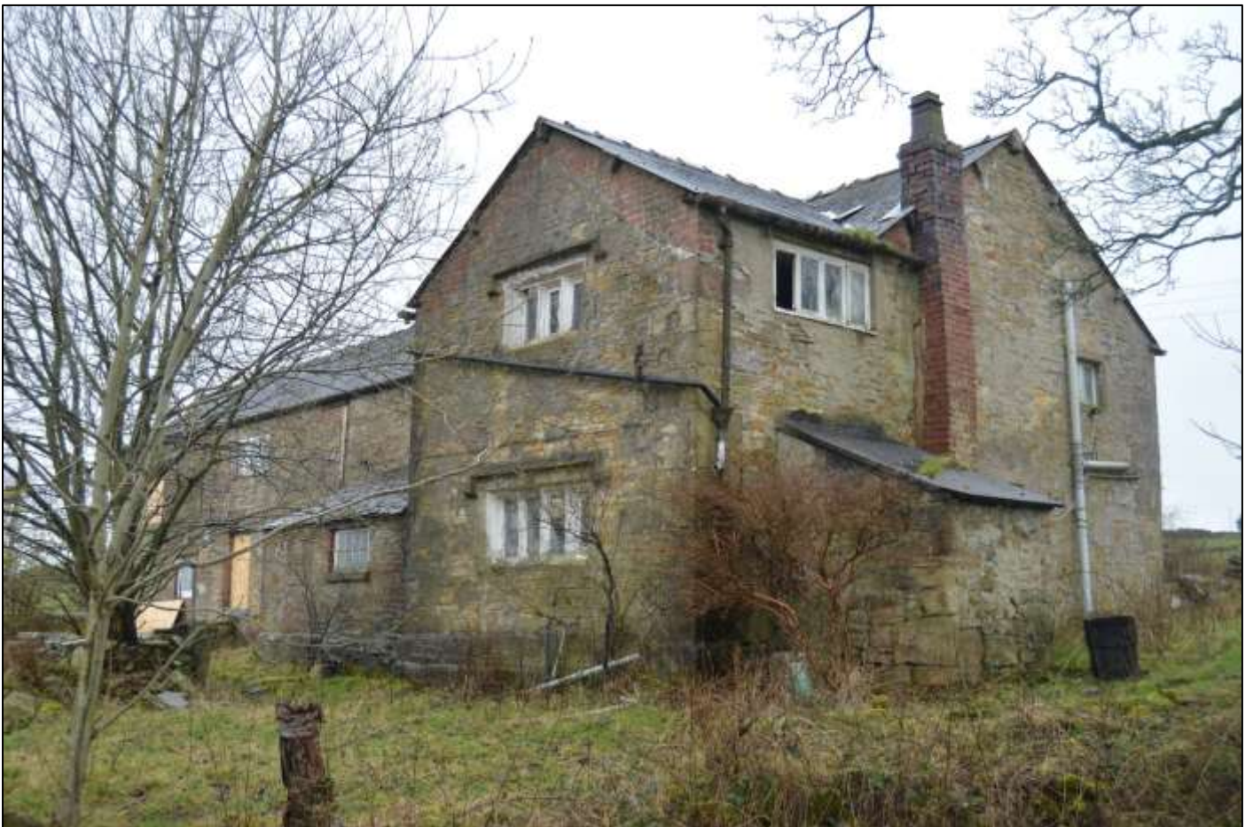
PL08: View of Lower Reaps Farmhouse from the south east.