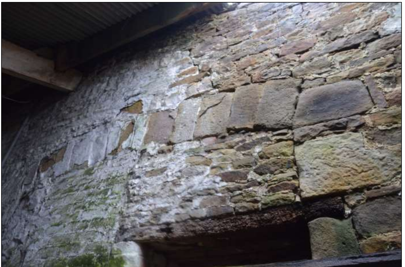
PL62: View of stone voussoirs to the blocked-up opening viewed from within the south shippon.