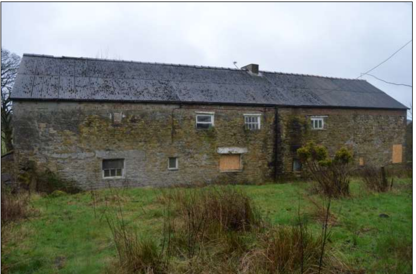
PL12: View of Lower Reaps Farmhouse from the North.