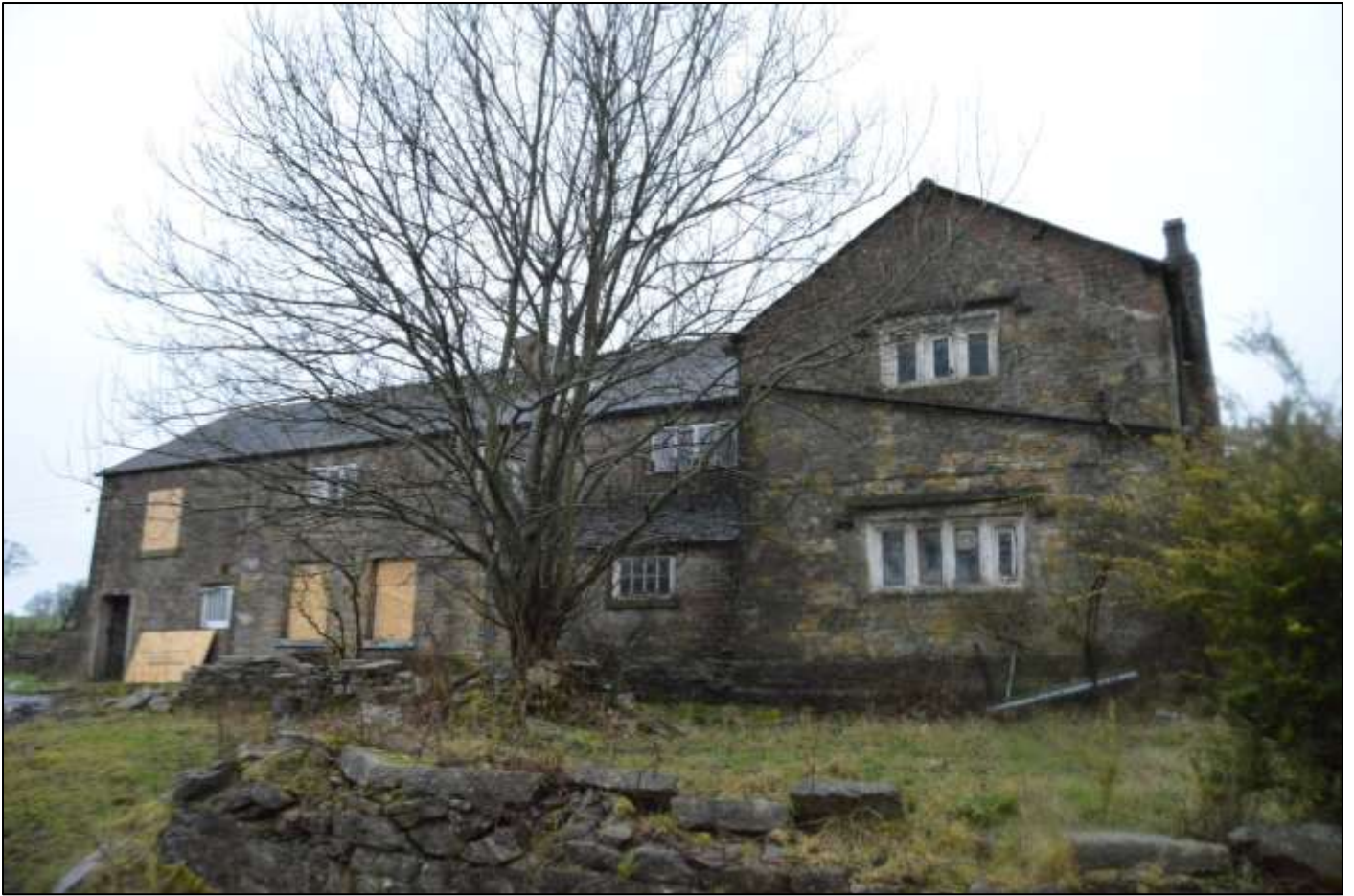
PL03: View of Lower Reaps Farmhouse from the south east.