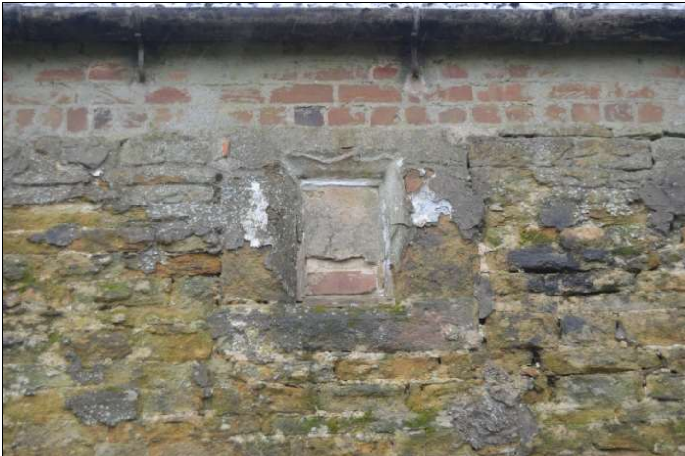
PL15: View of blocked up former staircase window to the first floor of the rear north elevation.