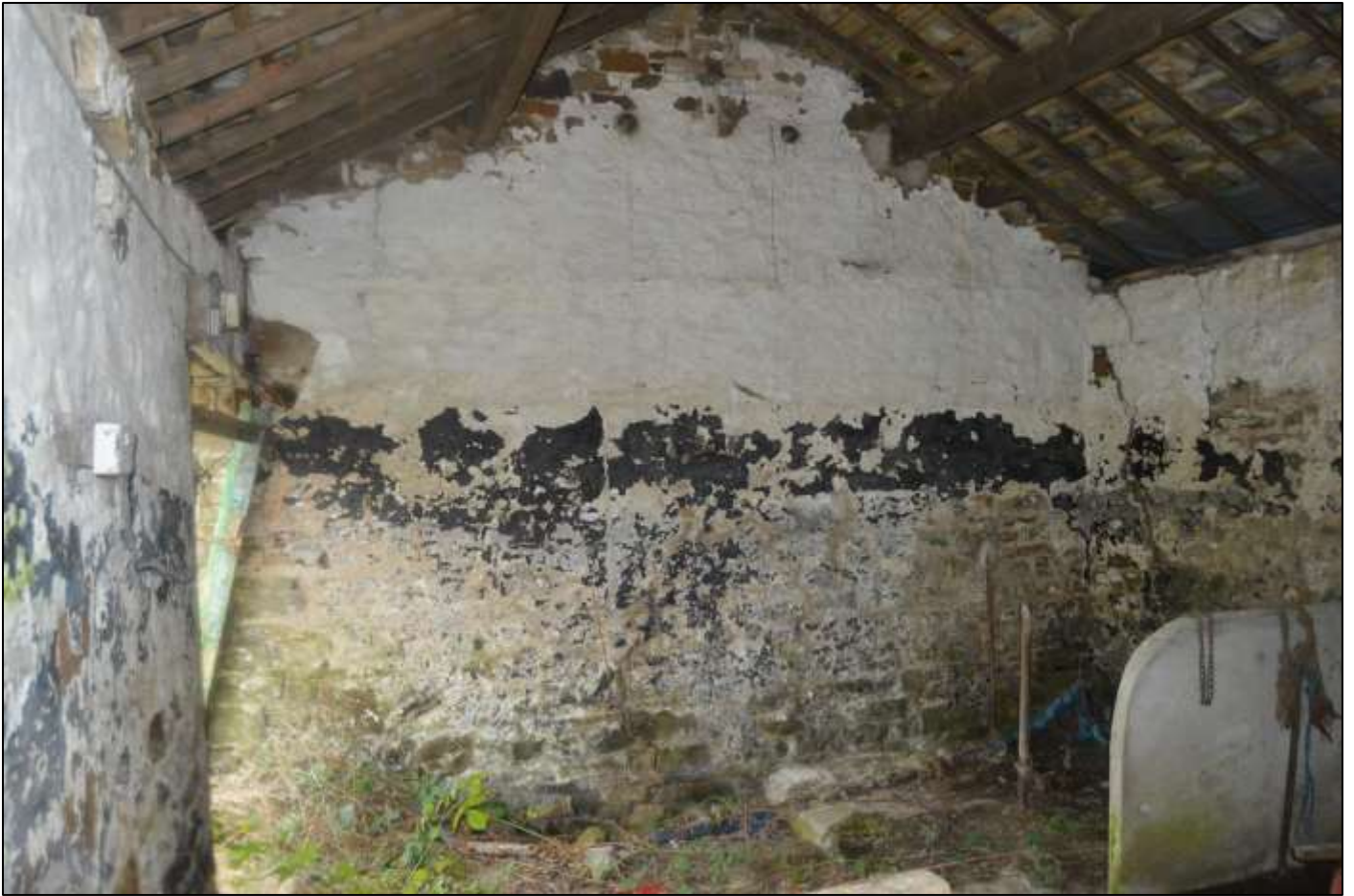
PL67: View south within the stone outbuilding.