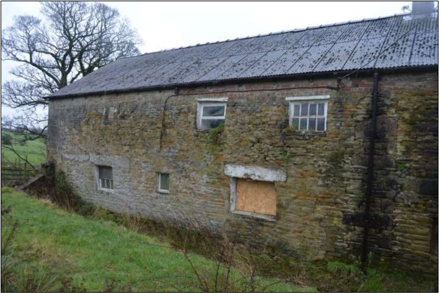
PL13: View of the eastern half of the rear elevation from the north.