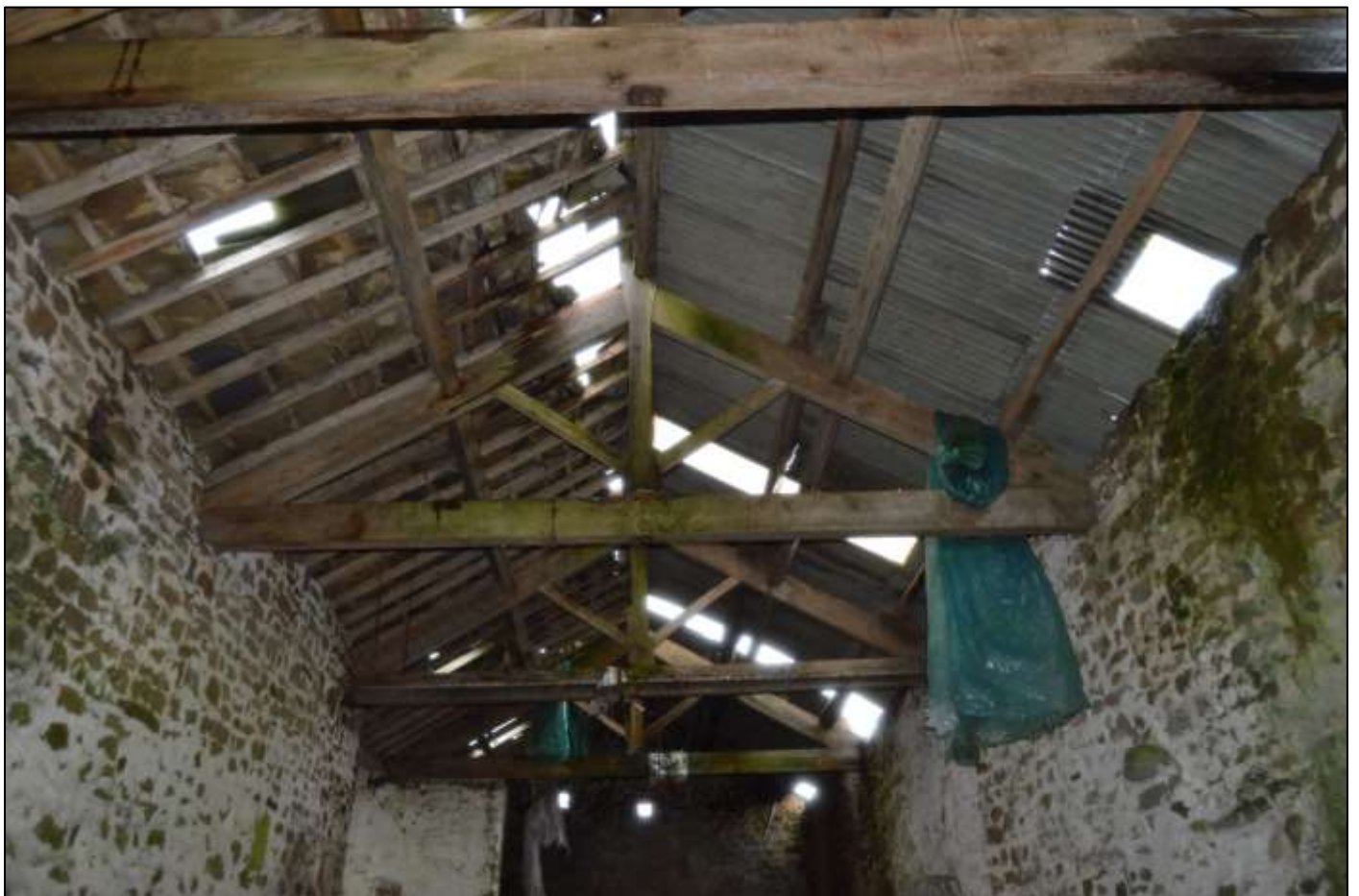
PL60: View of the roof structure over the main core of the barn.