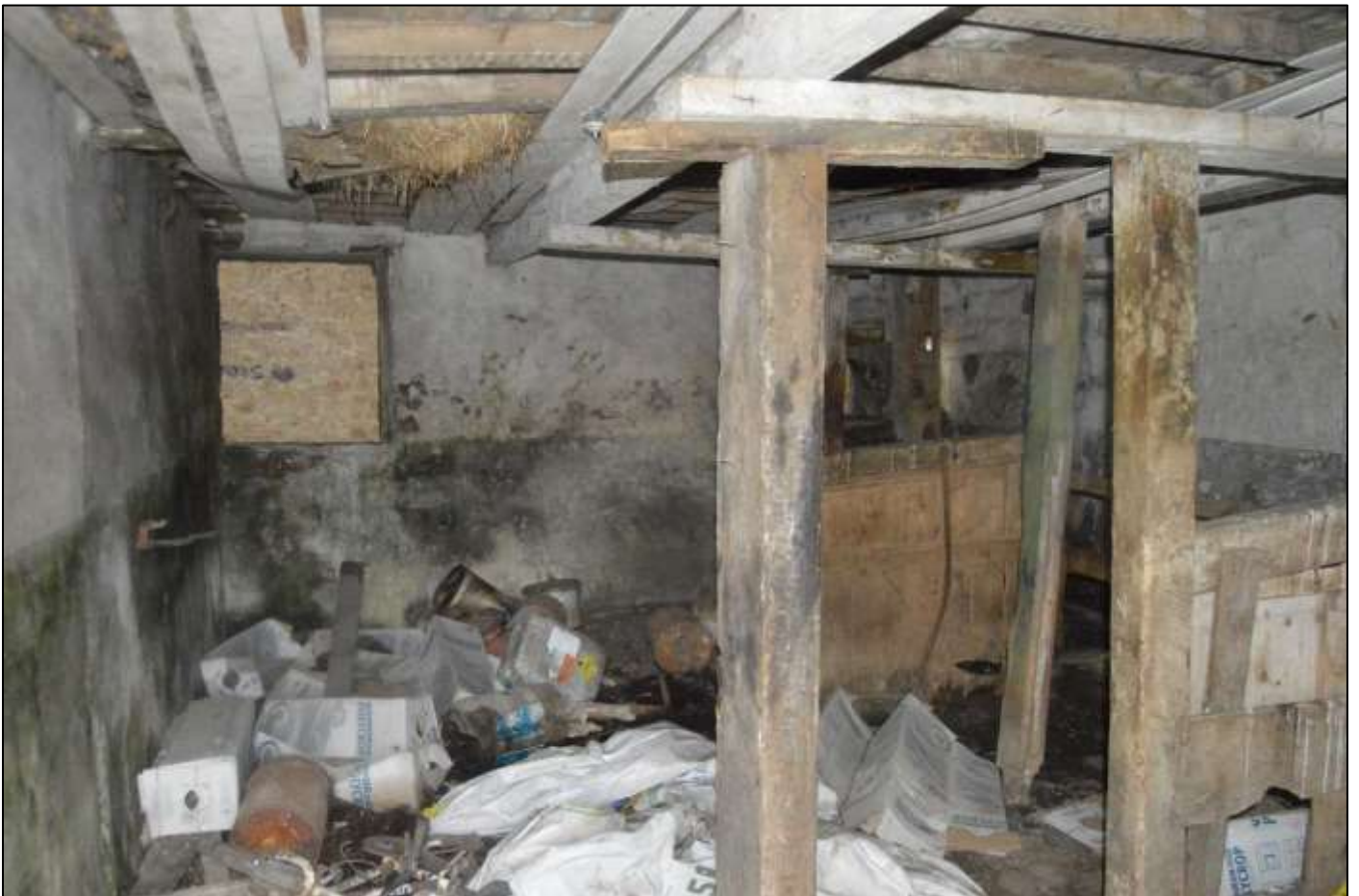
PL18: View north within the ground floor of the former stables.