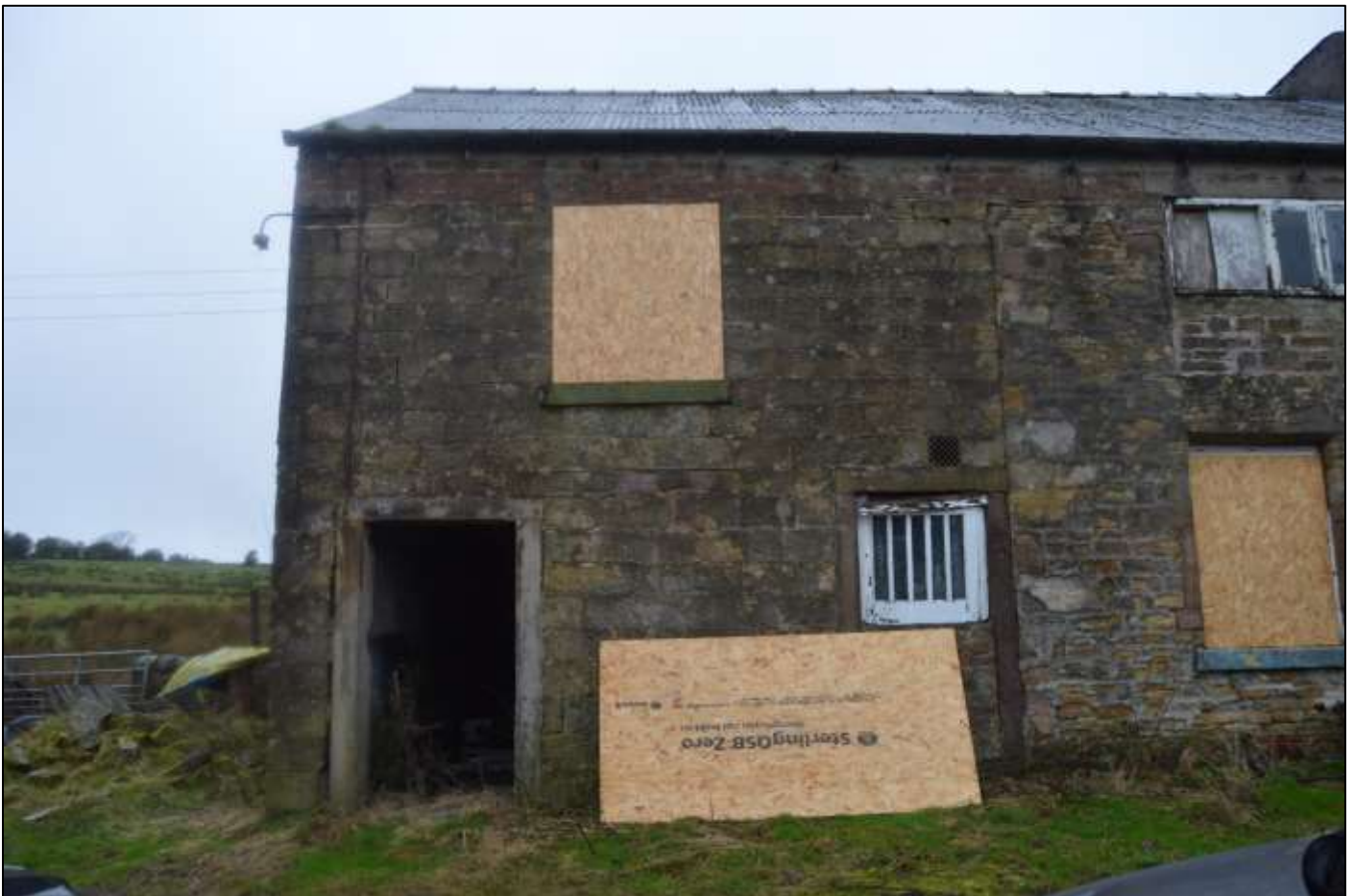
PL02: View of the former stables from the south.