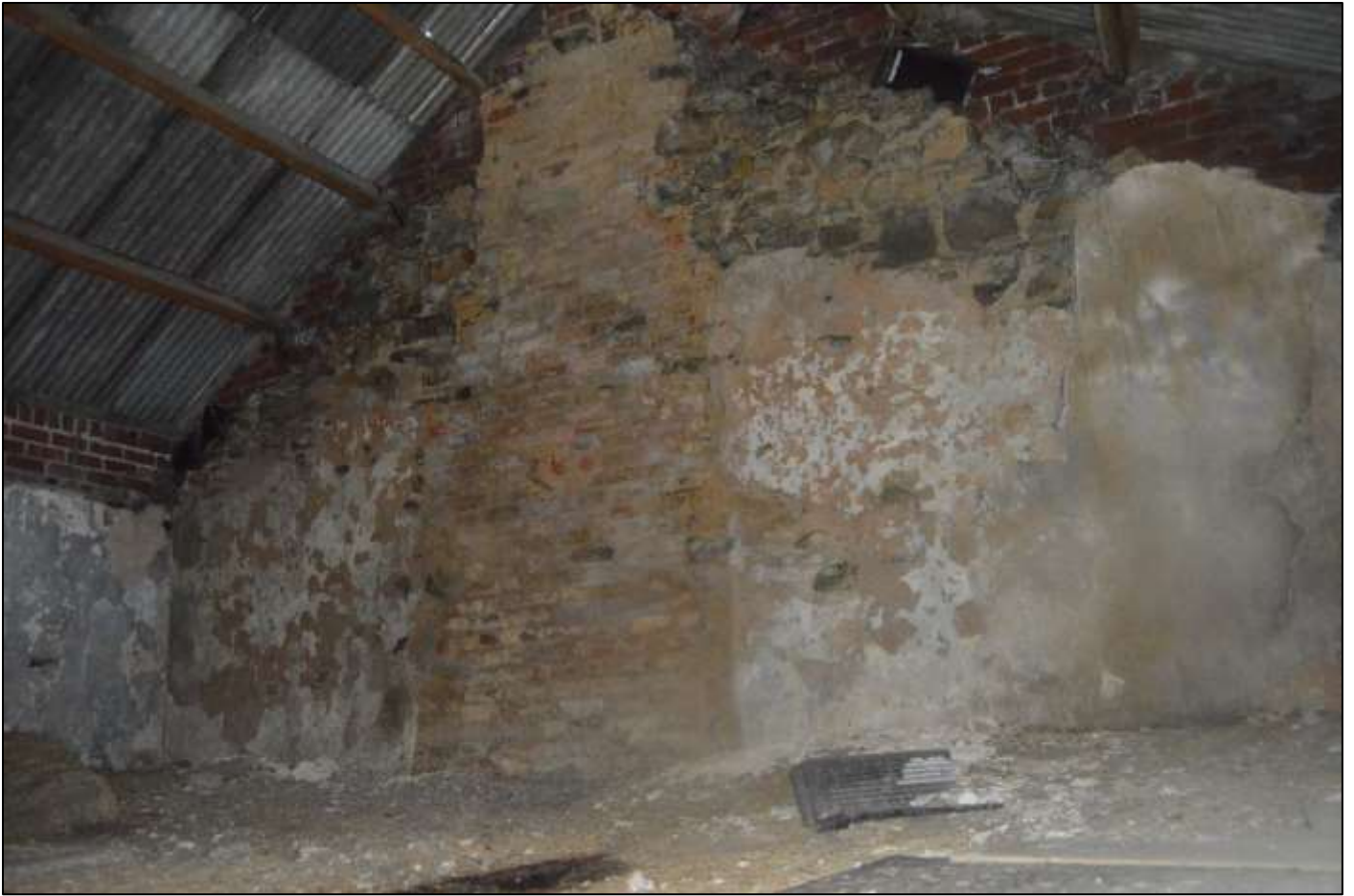
PL21: View west within the first floor of the former stables.