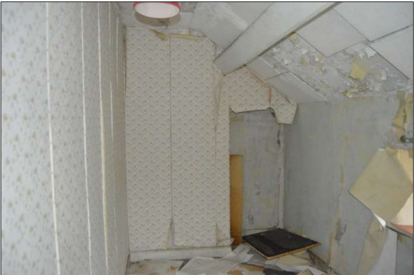
PL46: View west within the first floor north west bedroom.