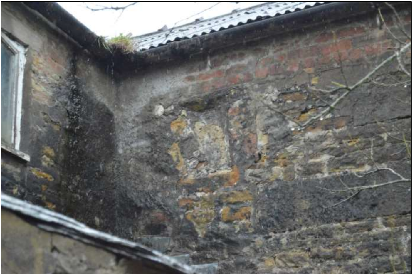
PL04: View of blocked window to the first floor of the west elevation of the cross wing.