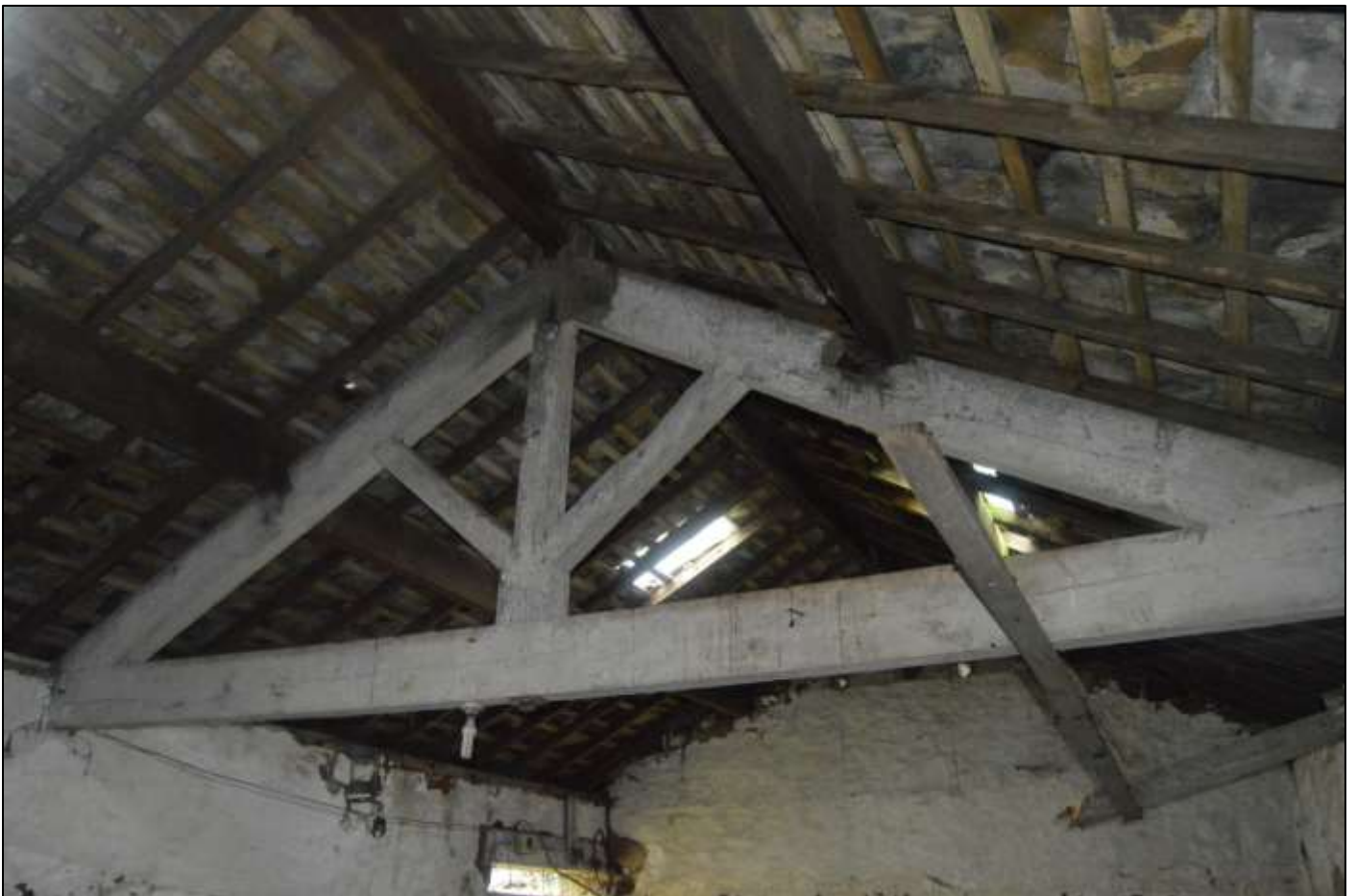
PL67: View of the roof structure to the stone outbuilding.