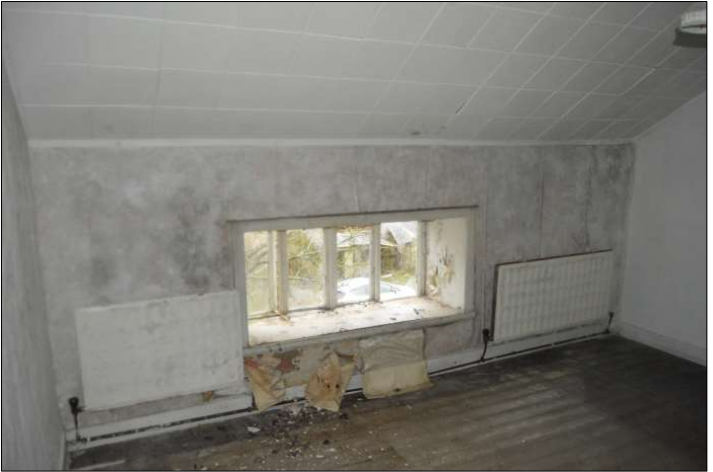
PL39: View south within the first-floor south bedroom to the main house body,