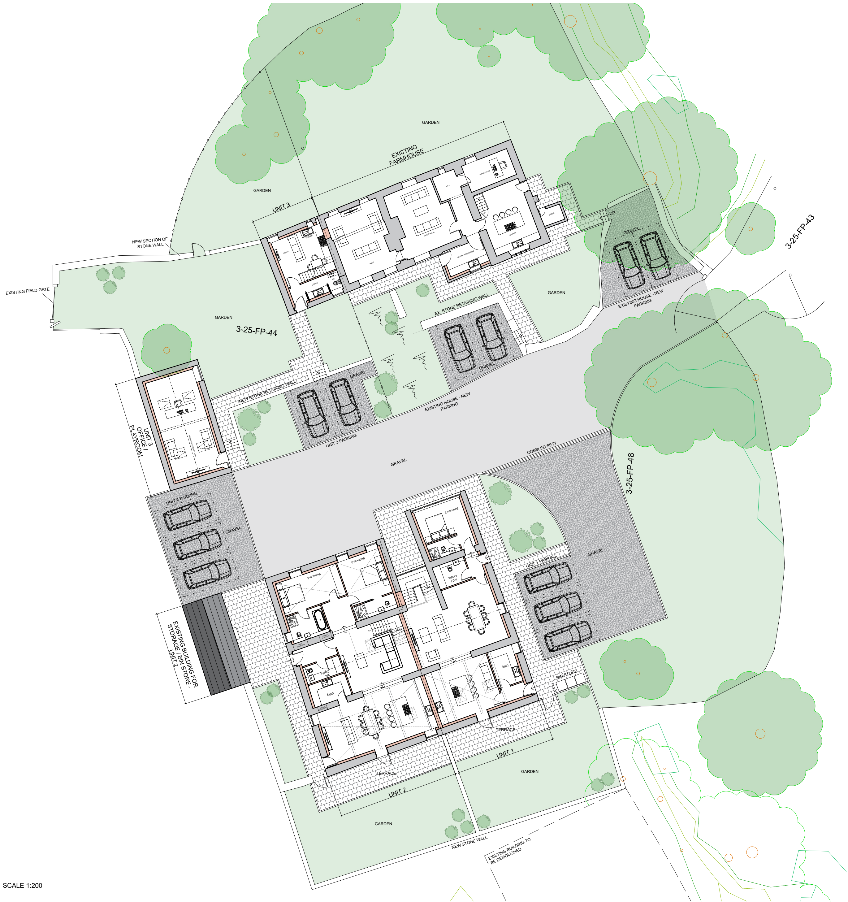
PROPOSED GROUND FLOOR SITE PLAN SCALE 1:200