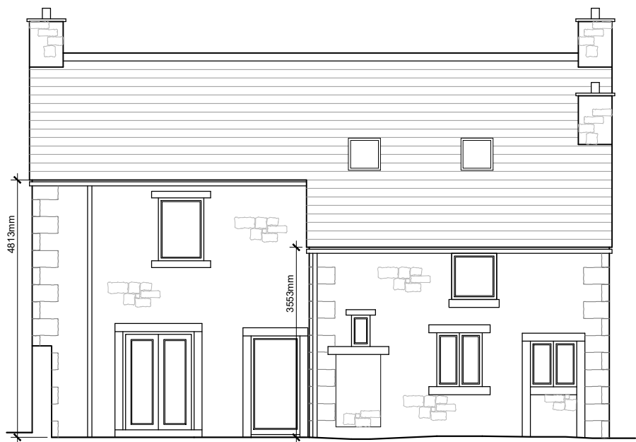
Rear South West Elevation 1:100