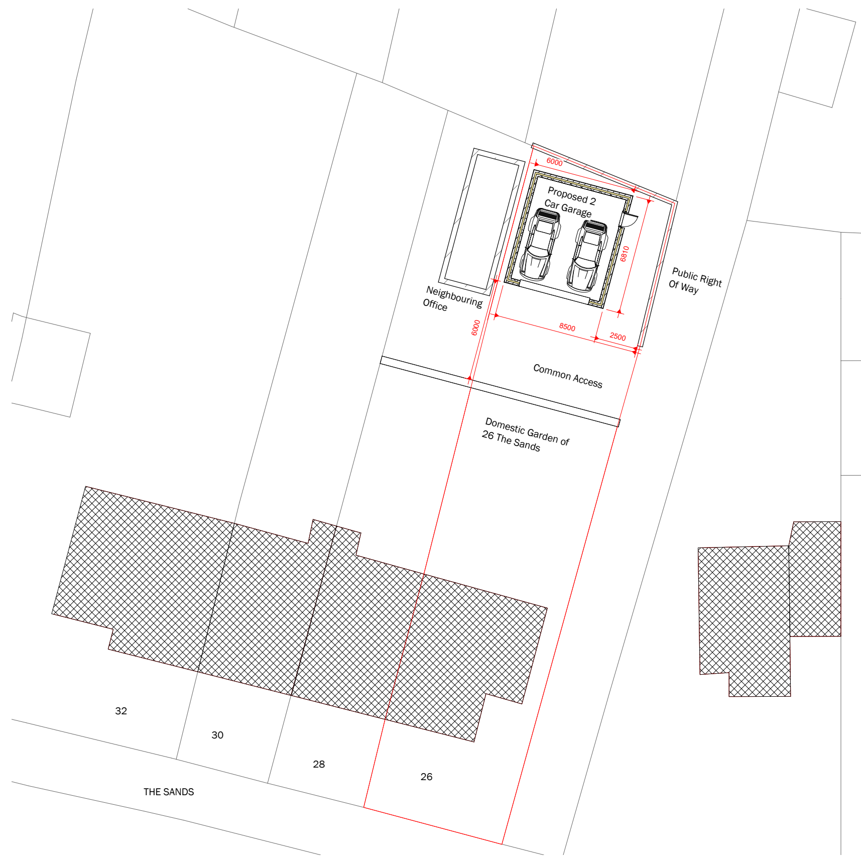
1 PROPOSED SITE PLAN 1 : 100