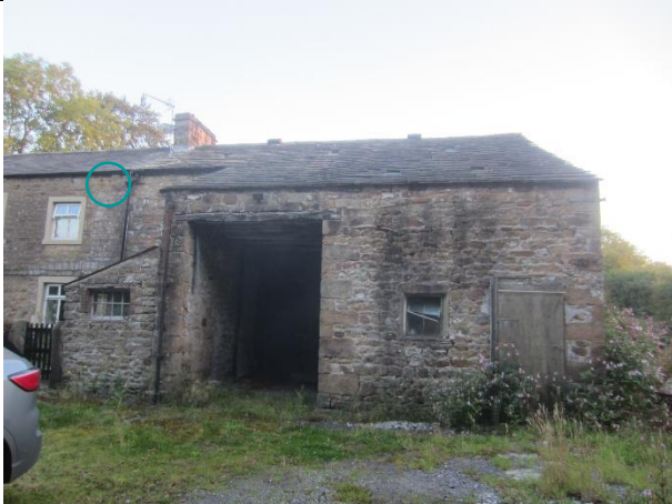
Photo 7: Southern elevation of attached barn and location of Roost 4 (off-site common pipistrelle day roost)