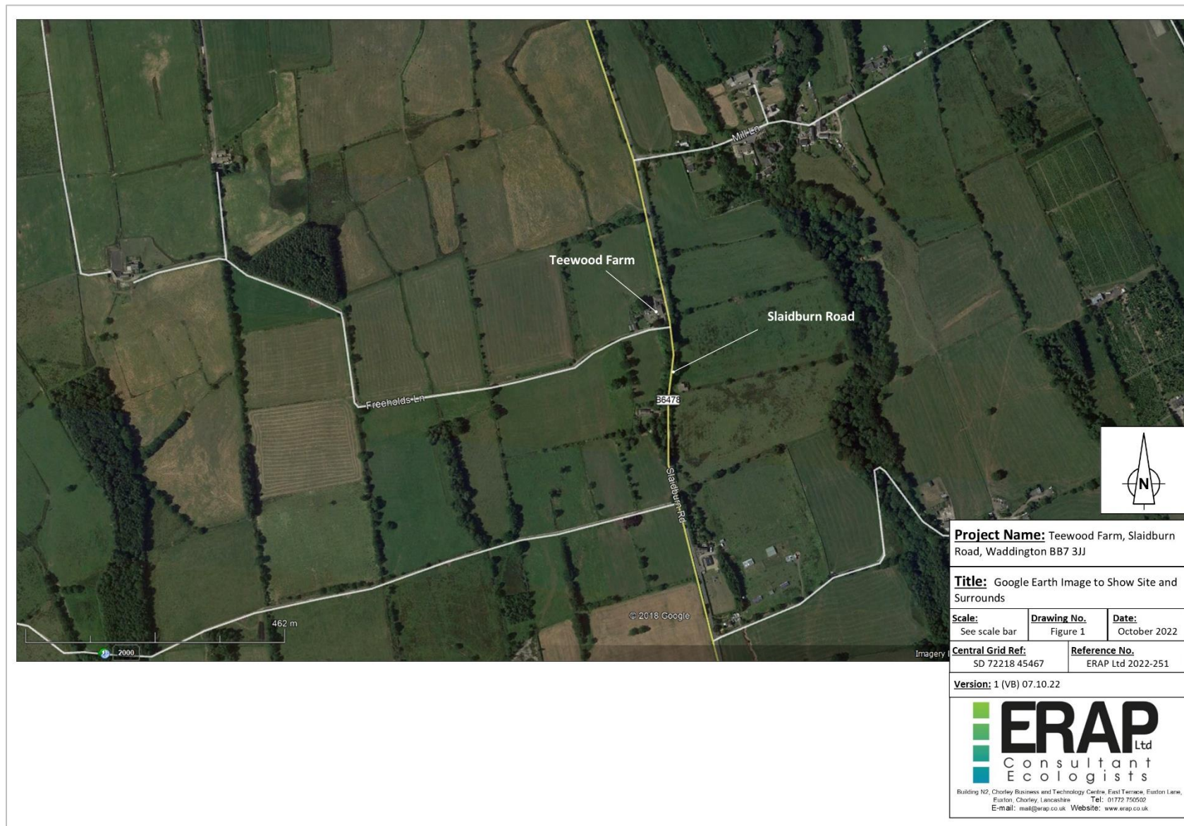
Figure 1: Aerial Image to Show Site and Surrounds