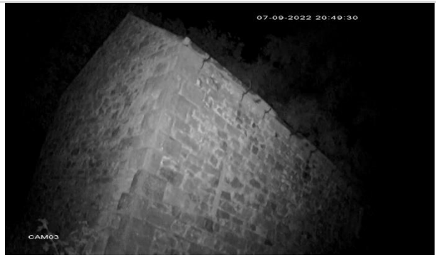
Photo 18: View of NVA 2 at over 1 hour after sunset (20:49) (north-western corner of the detached barn)