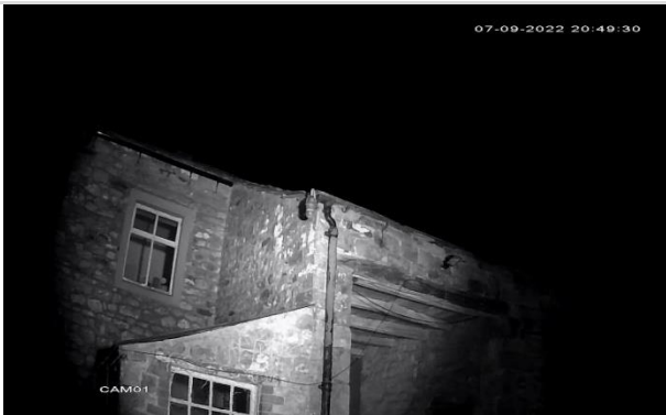
Photo 17: View of NVA 1 at over 1 hour after sunset (20:49) (showing location of Roost 1 at attached barn)