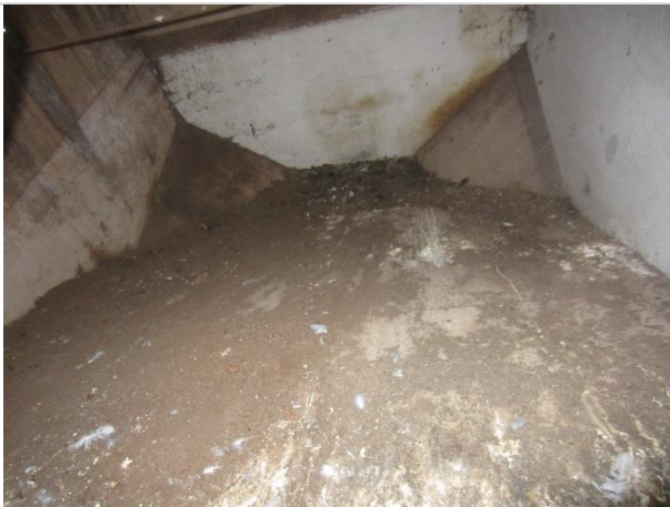
Photo 21: View of barn owl pellets and faecal splashes inside hopper and beneath the likely nest position