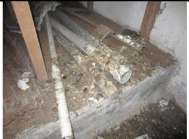
Photo 20: Barn owl pellets and faecal splashes beneath the plywood hopper inside the shippon