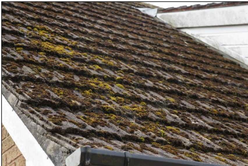
Photo 3: Moss covered roof on the north elevation. Showing mortar to the eaves in good condition.

There are no gaps in the mortar at the eaves, or ridge tiles.