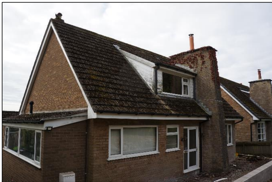
Photo 2: North elevation with uPVC framed window, and brick built external chimney.

The external chimney is of brick construction, also in a good state of repair with no missing mortar or gaps in the materials.