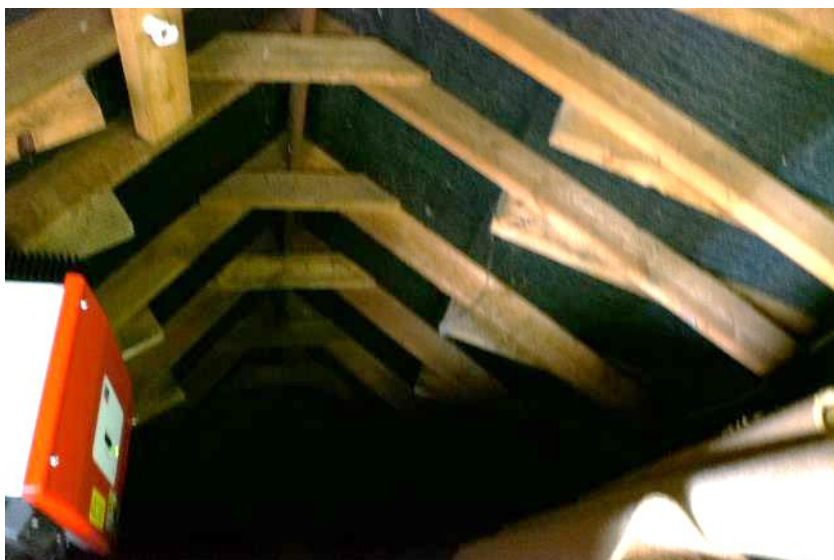
Photo 5: Example of roofing materials from the interior of the loft space.

There is a loft space running the full length of the building. The timber and roof lining are all in a good condition, with no daylight showing through, which would be evidence of gaps in the materials.