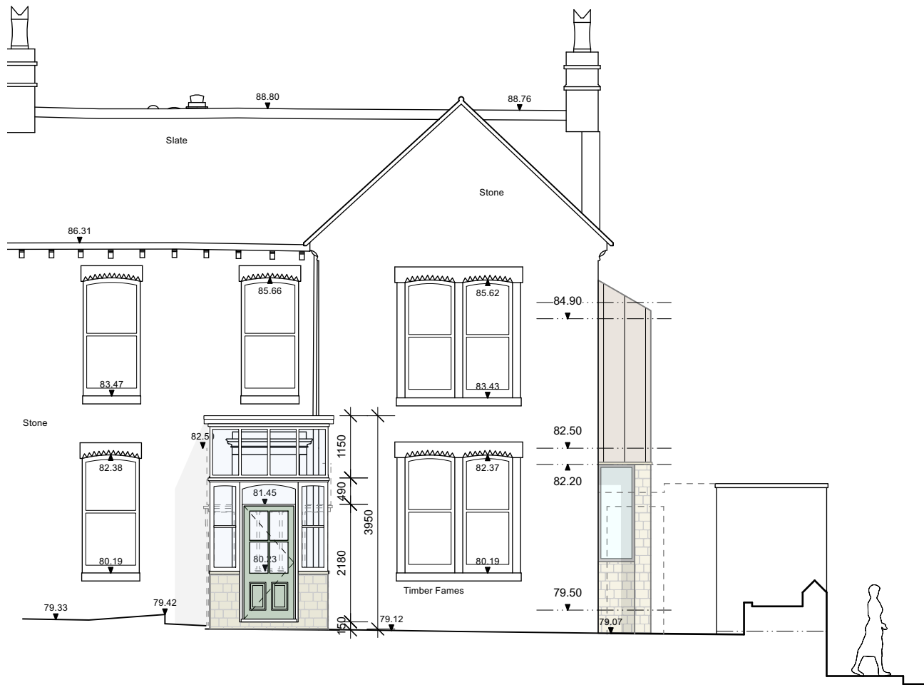
1 PROPOSED SOUTH WEST ELEVATION Scale: 1:100