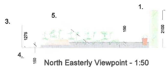
North Easterly Viewpoint - 1:50