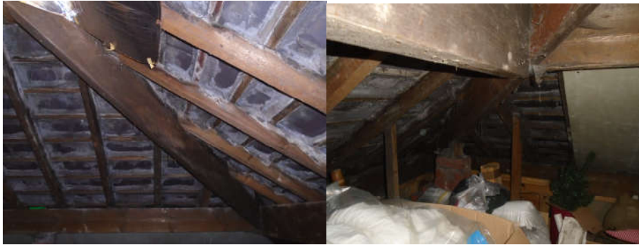
Main roof void