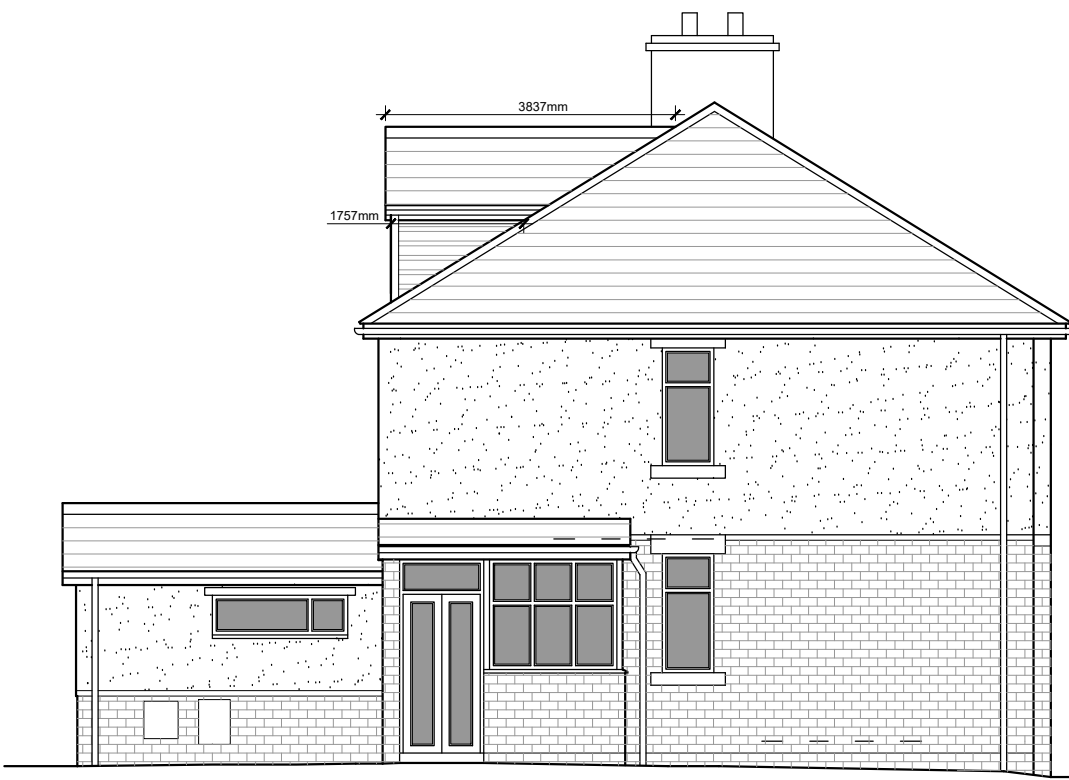
Side South West Elevation 1:100