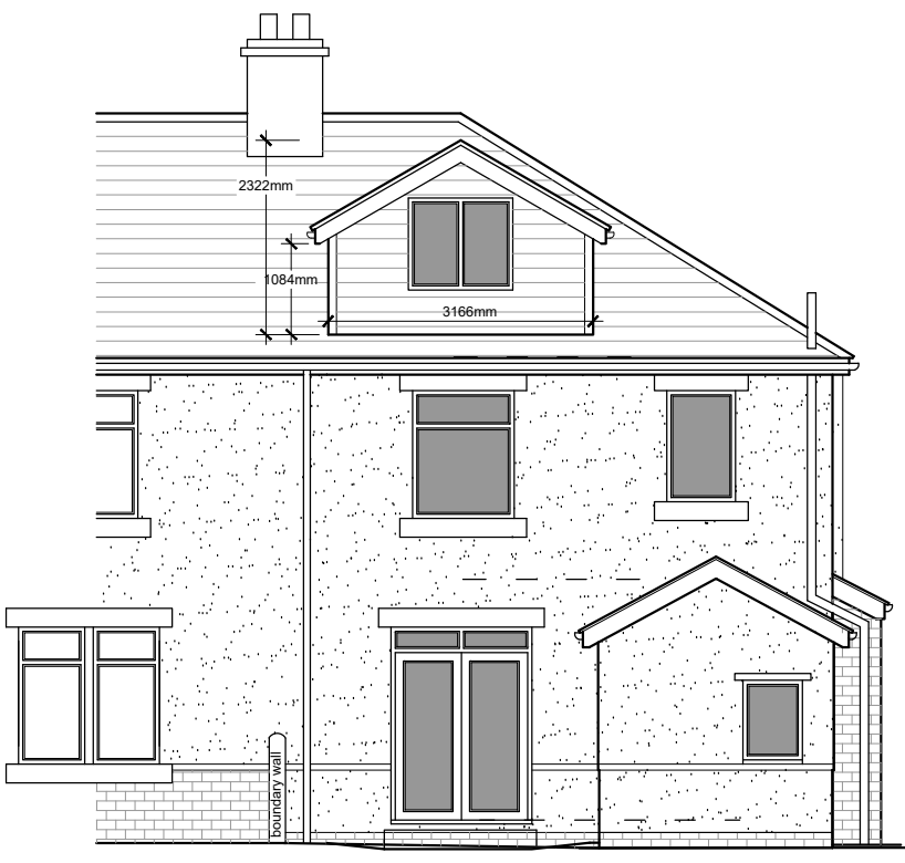
Rear North West Elevation 1:100