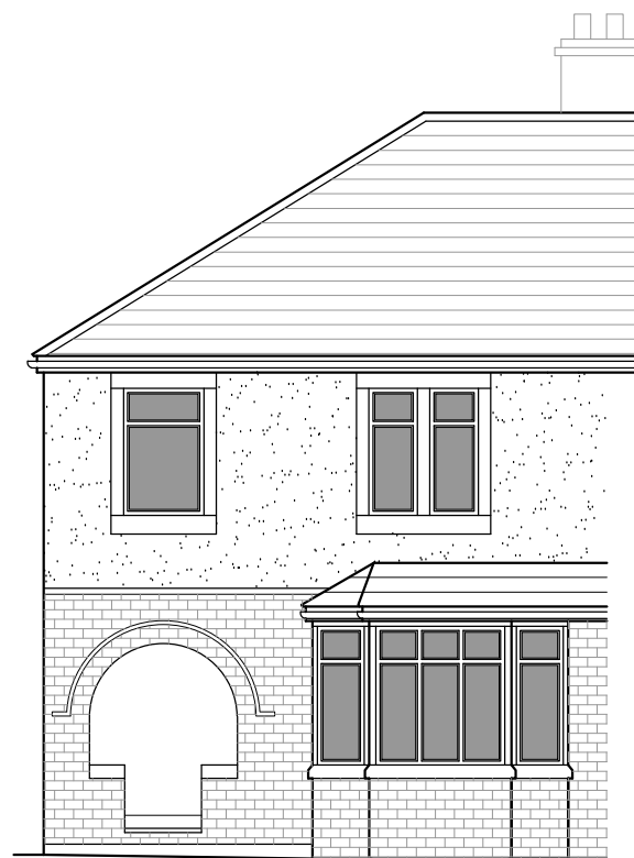
Front South East Elevation 1:100