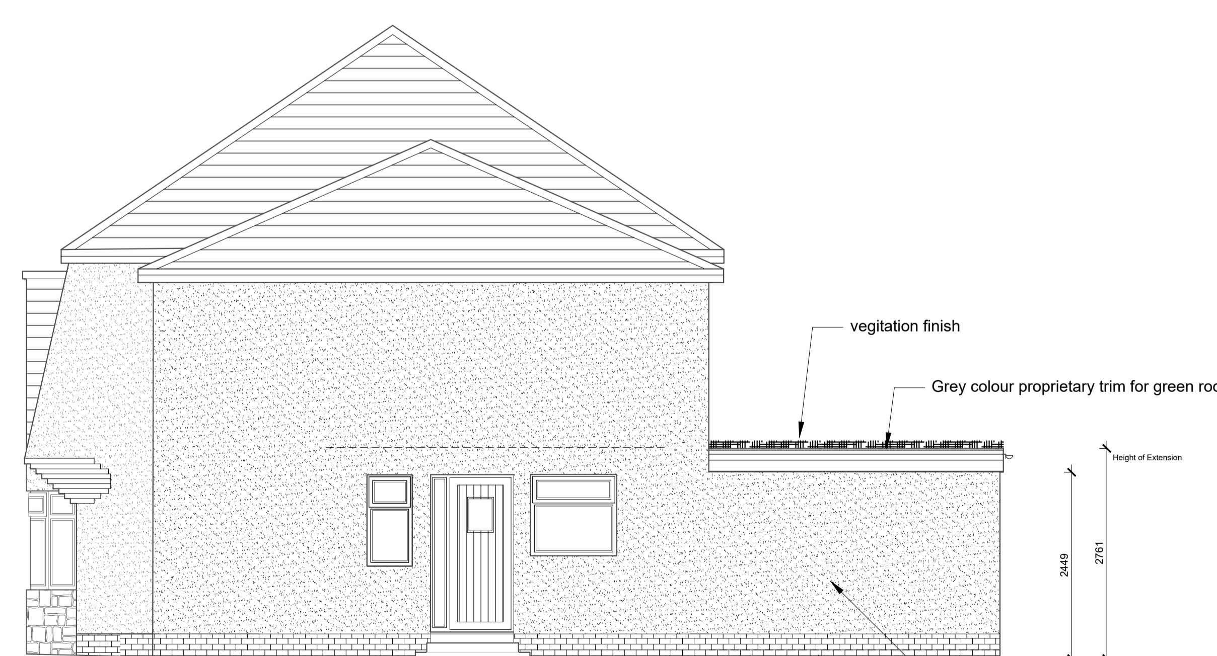
Proposed Side Elevation 1:50