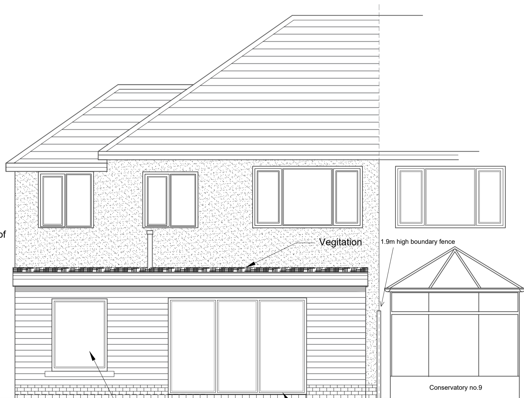
Proposed Rear Elevation 1:50