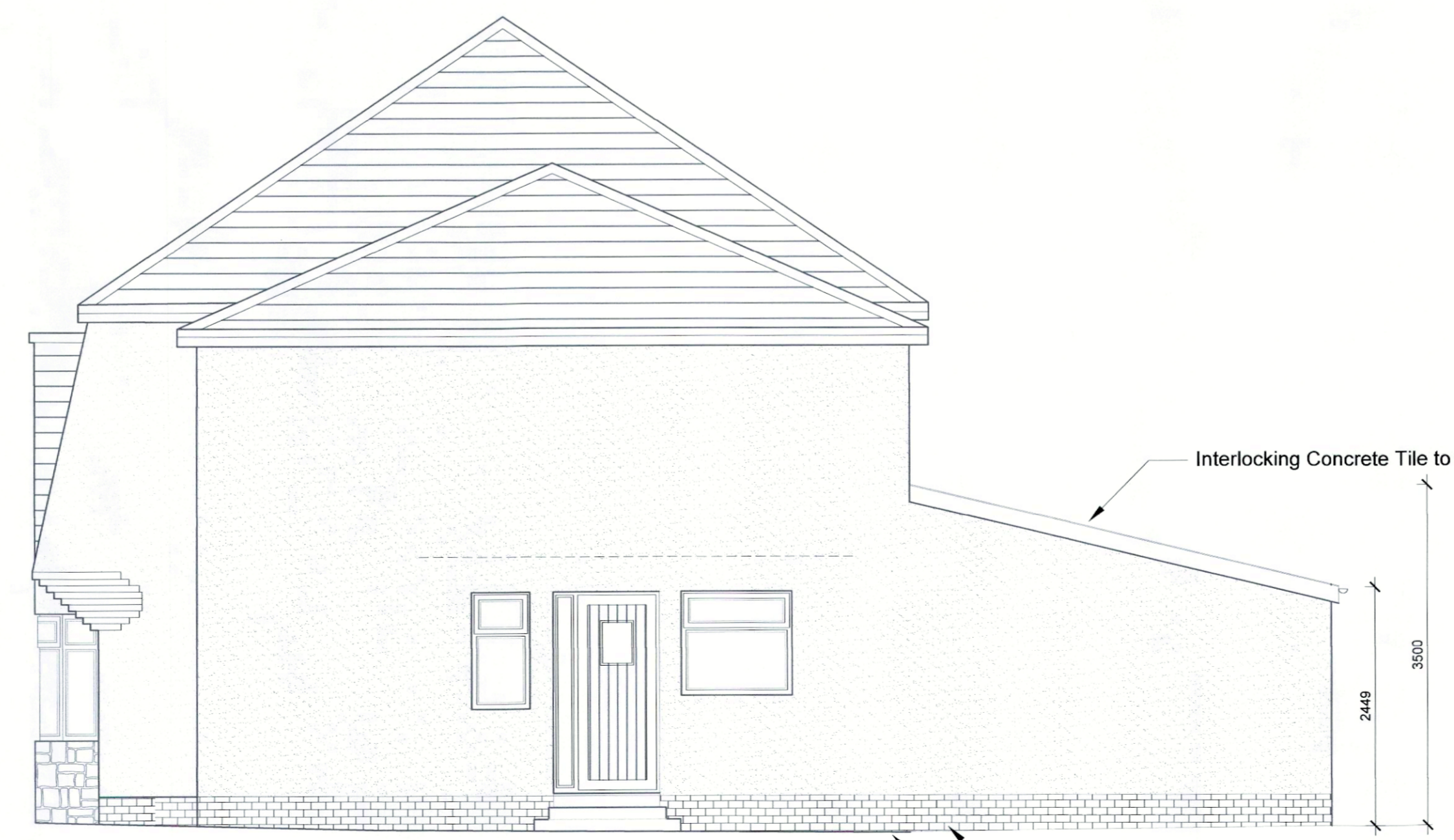
Proposed Side Elevation 1:50