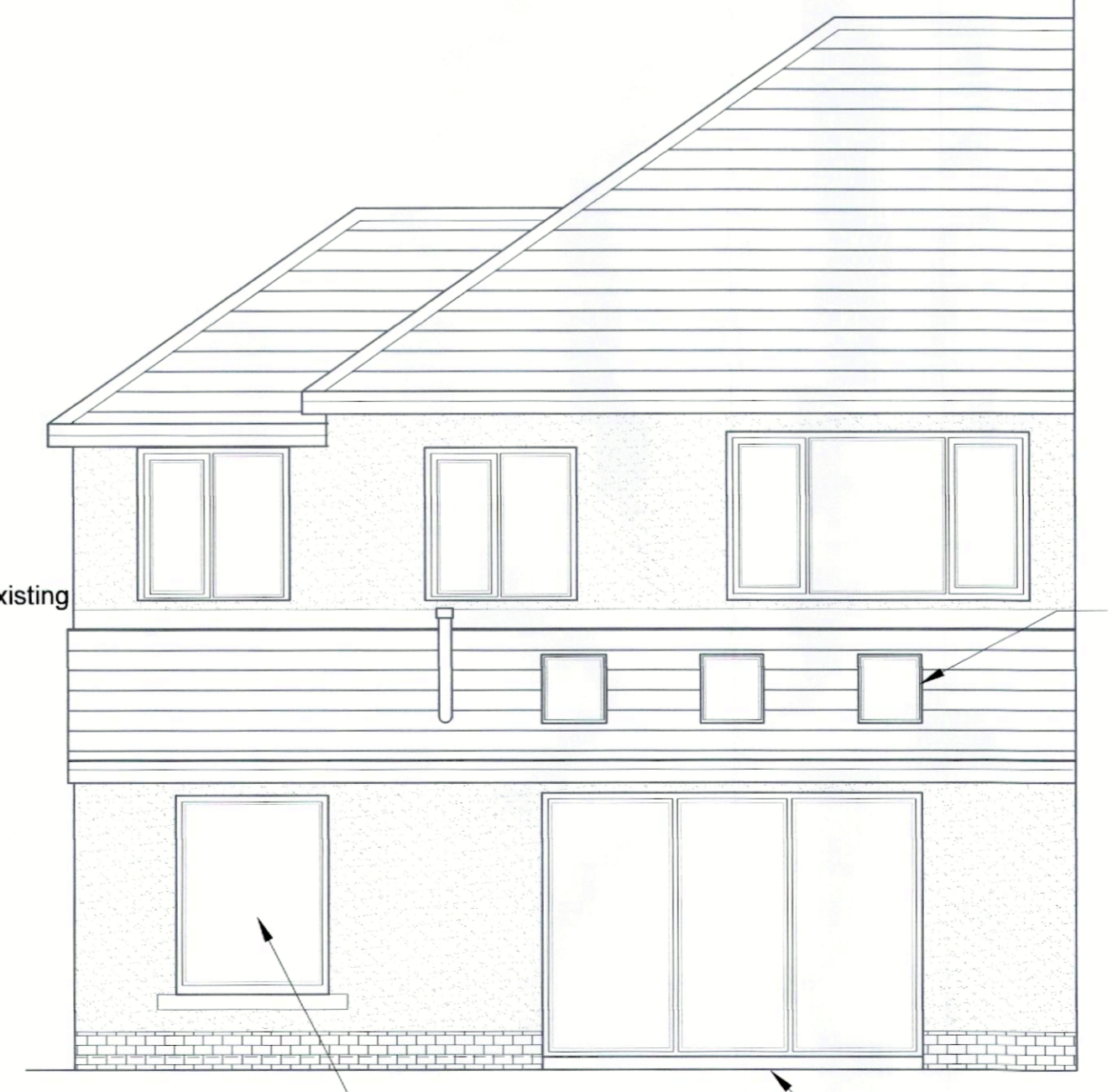
Proposed Rear Elevation 1:50

Interlocking Concrete Tile to Match Existing Brickwork Plinth to Match Existing Render Wall Finish to Match Existing