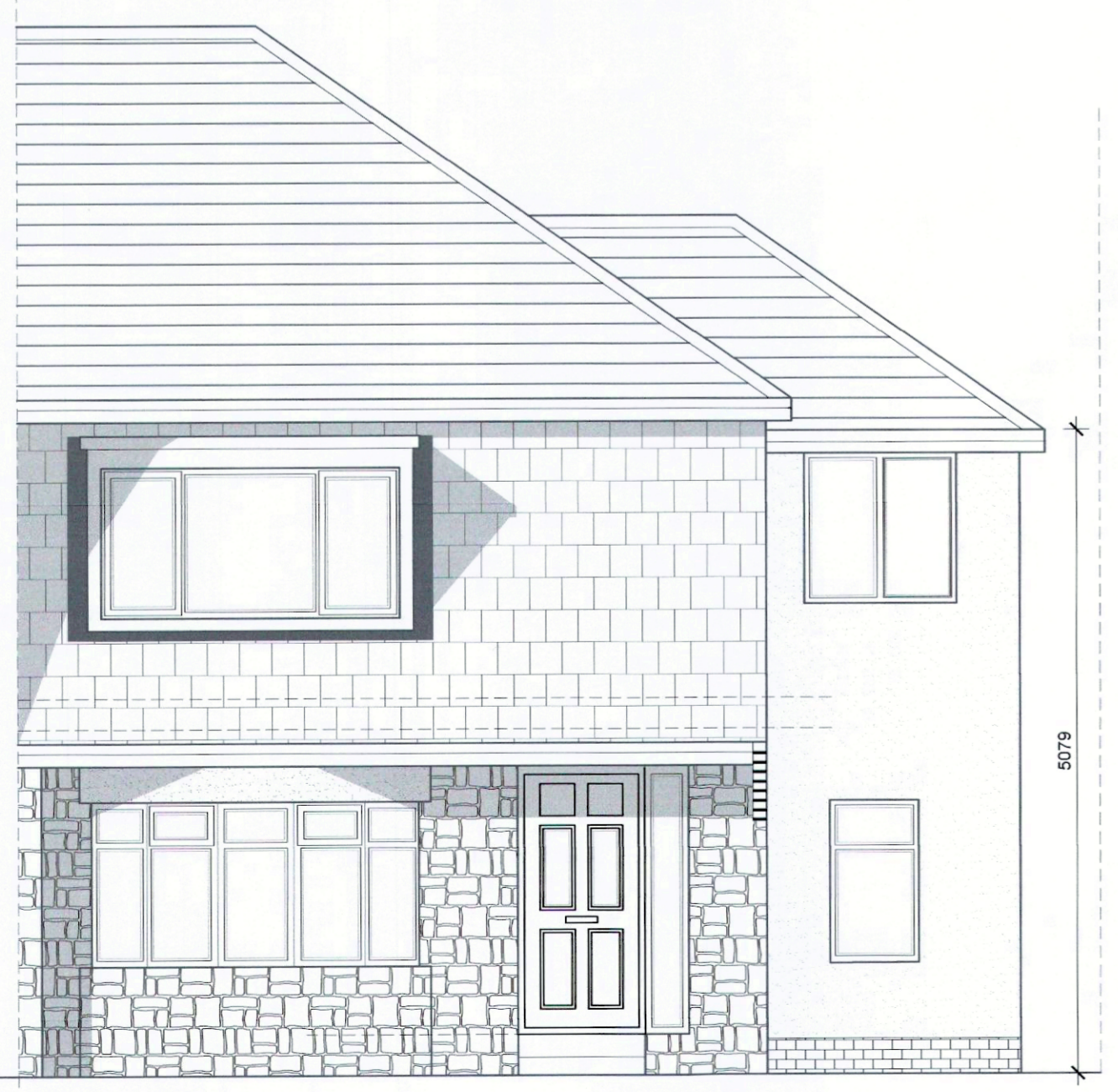
Proposed Front Elevation 1:50