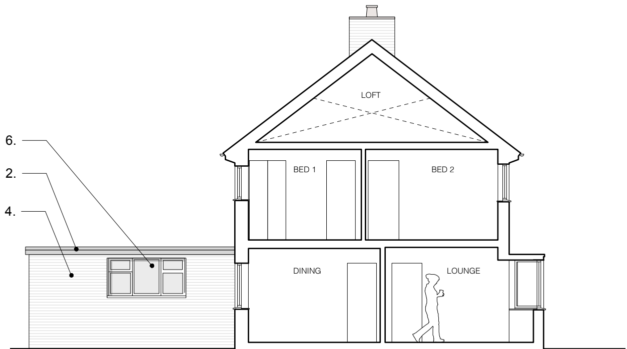
EXISTING SECTION BB