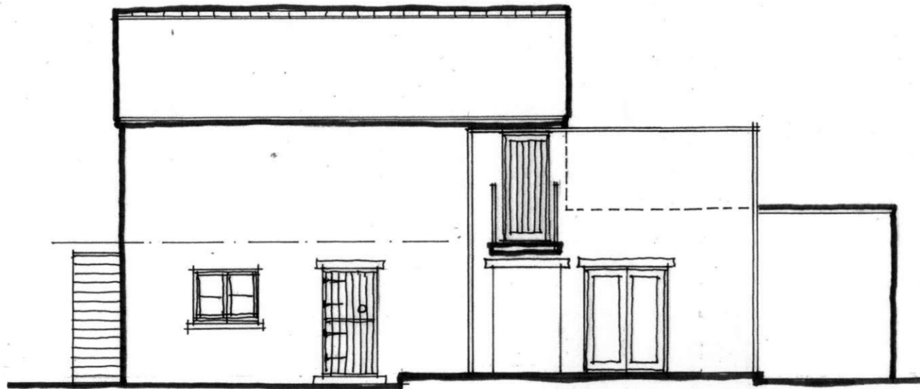
SECTION THRO' LINK A-A