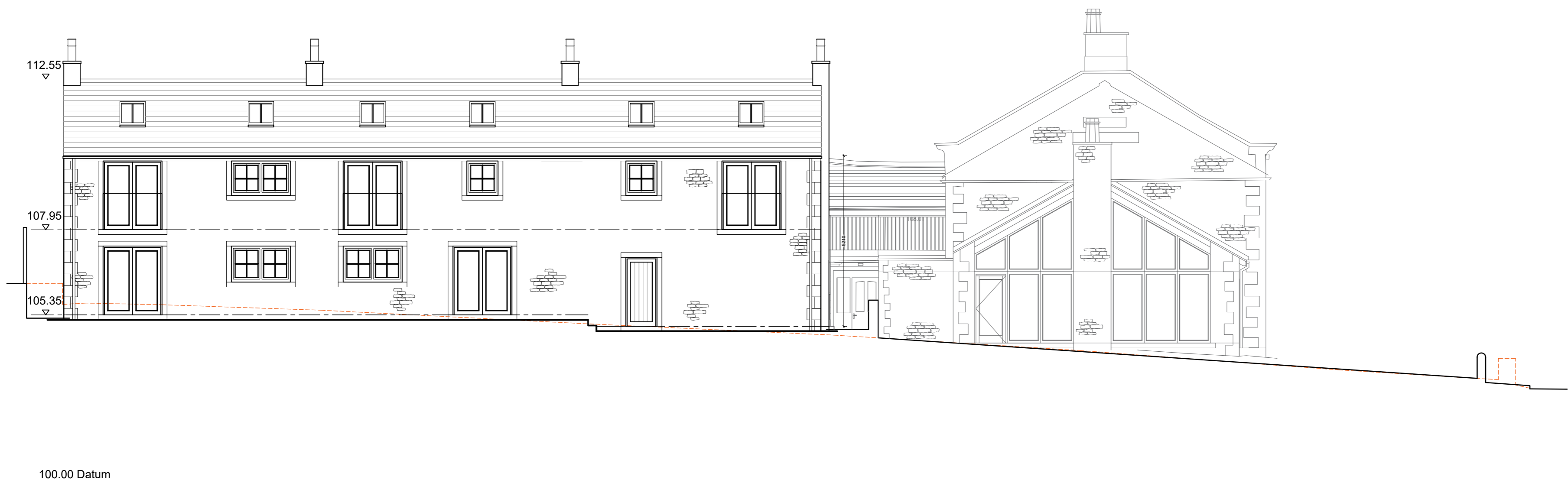
Proposed Site Section B-B Scale 1:100