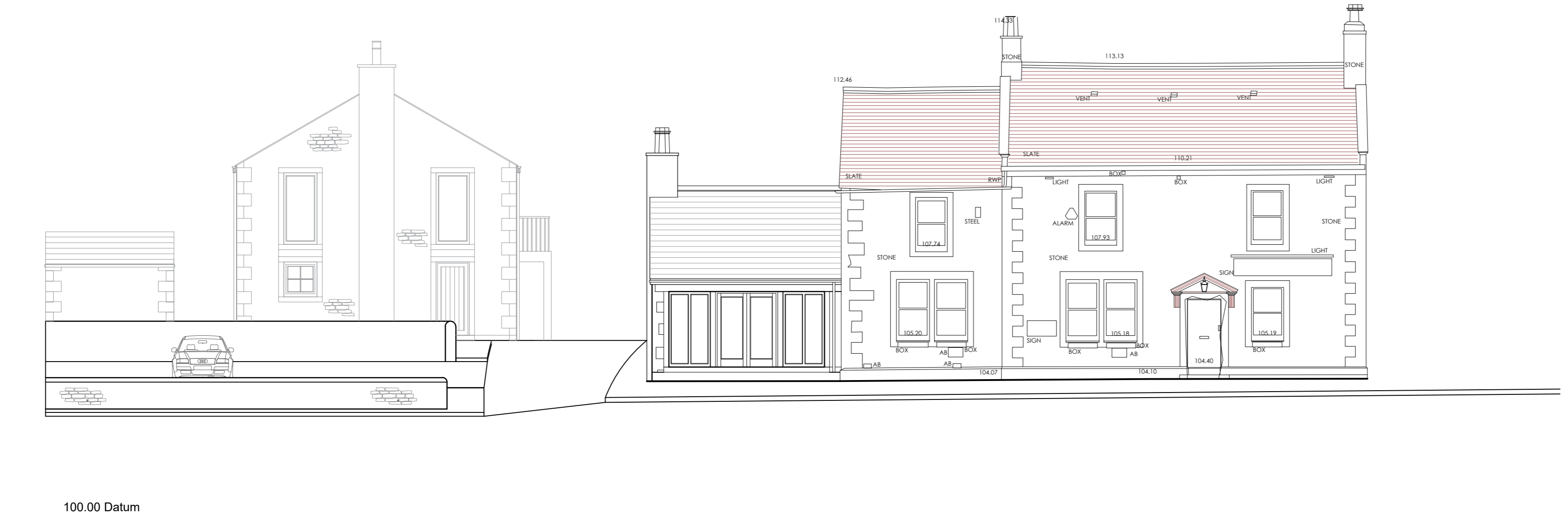
Proposed Street Scene (Viewed from Grindleton Brow) Scale 1:100