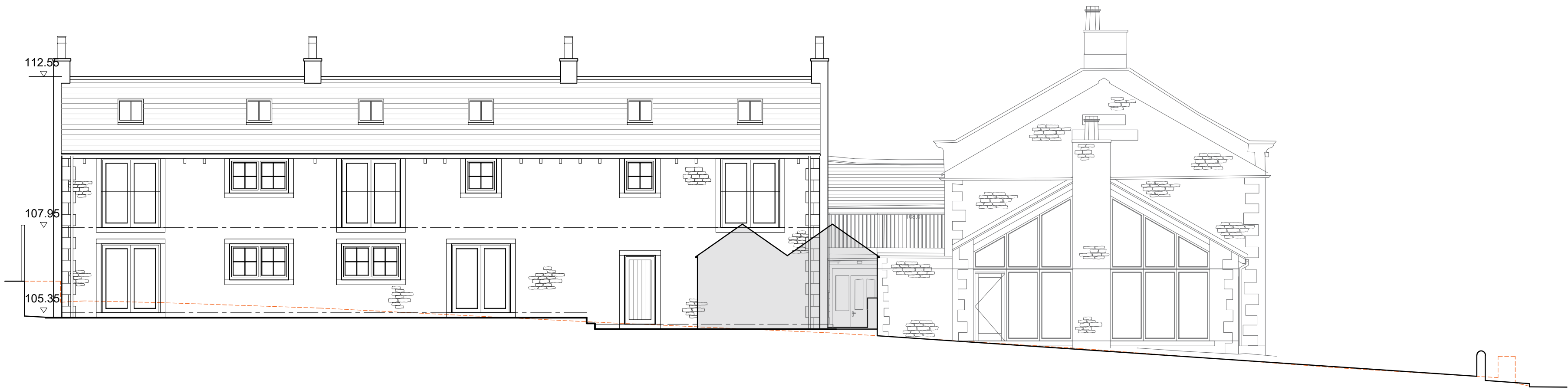
Existing Site Section B-B Scale 1:100