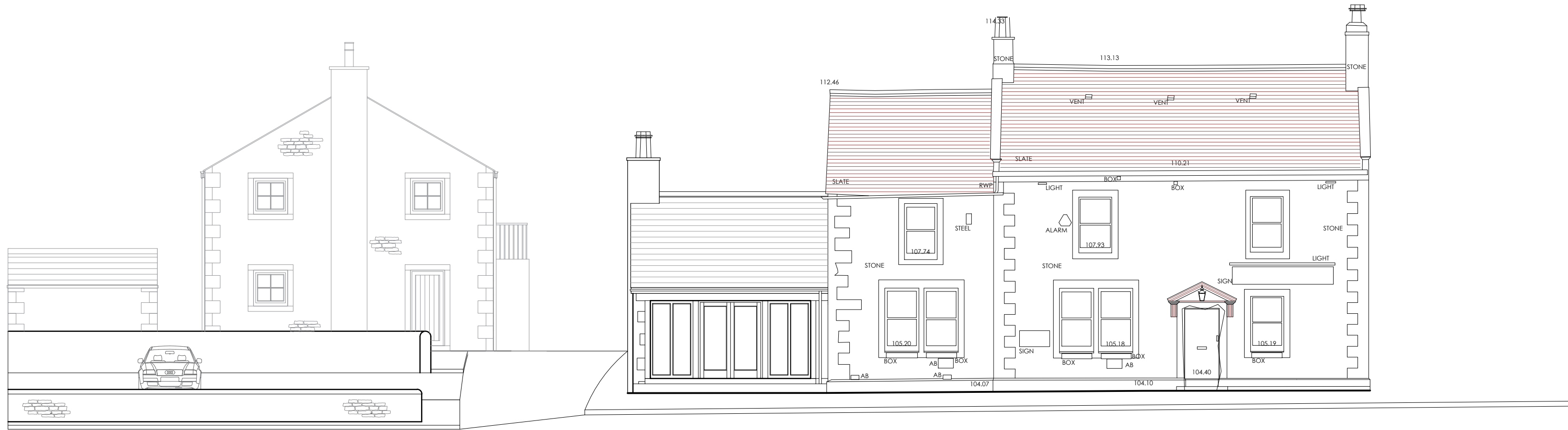
Proposed Site Section B-B Scale 1:100