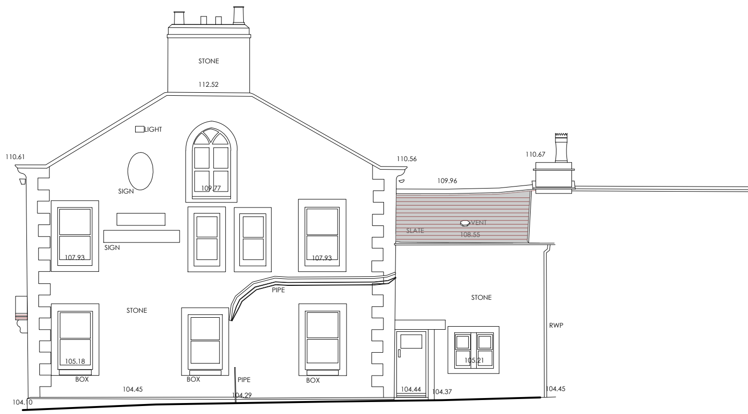
▽ 102.00M ABOVE OS DATUM NORTH EAST ELEVATION