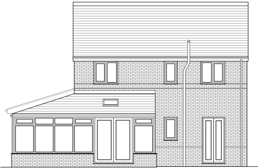
Existing South East Facing Elevation Scale 1:100