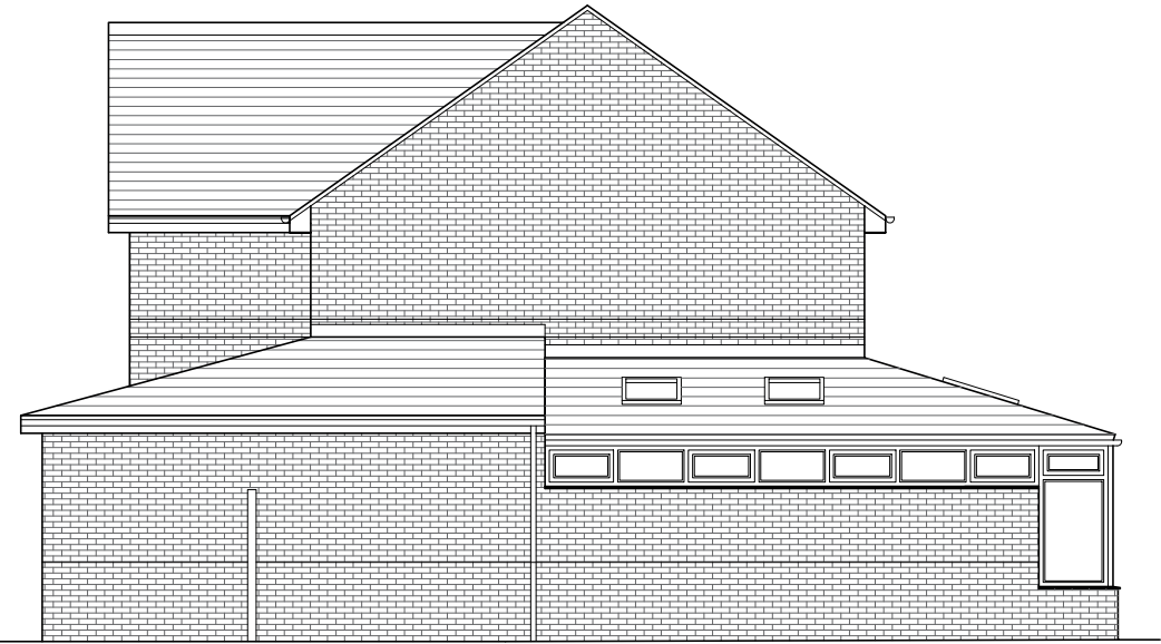
Existing South West Facing Elevation Scale 1:100