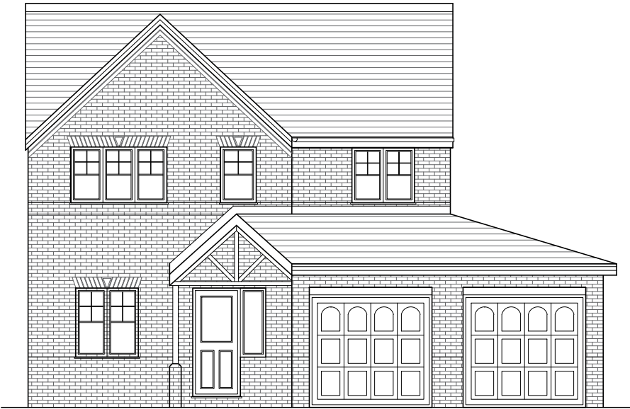
Existing North West Facing Elevation Scale 1:100