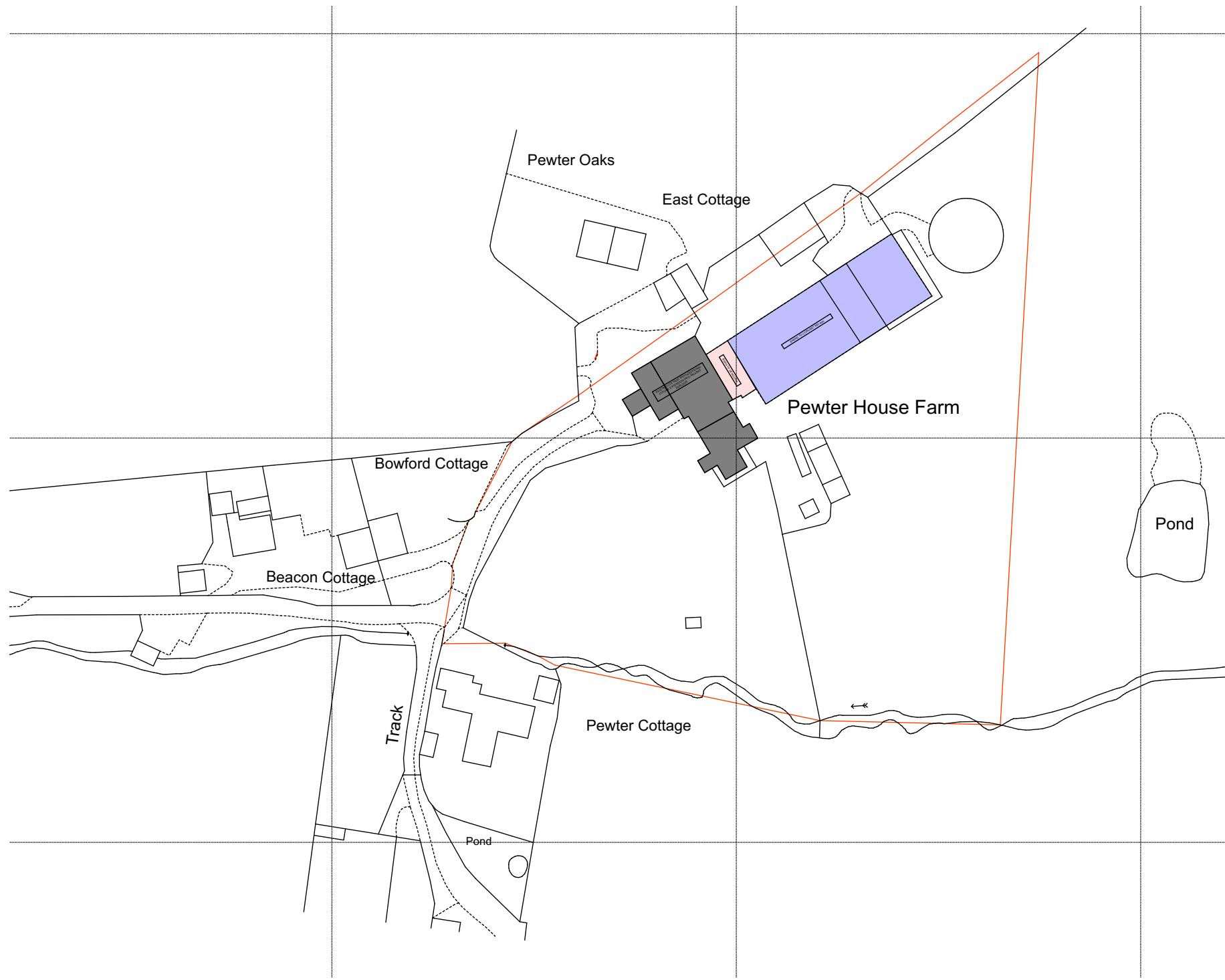
EXISTING LOCATION PLAN 1:1250