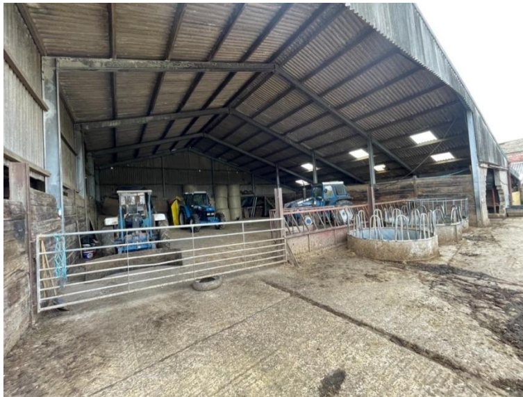
1. Portal frames – concrete hardstanding, timber purlins, 4 bays