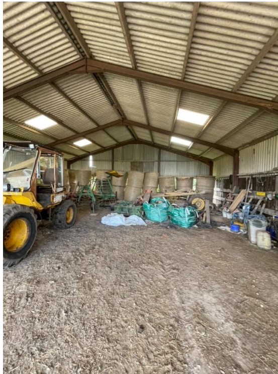
3. Portal frame – unfinished ground