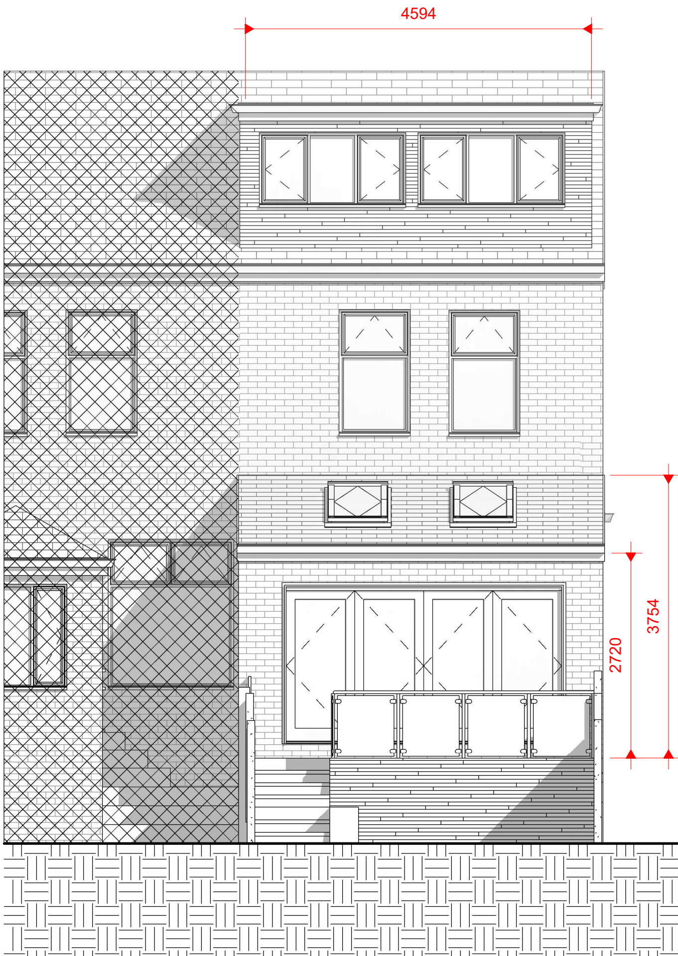
PROPOSED NORTH EAST 1 : 50