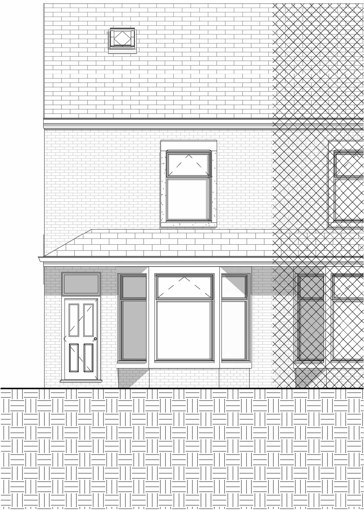
PROPOSED SOUTH WEST 1 : 50