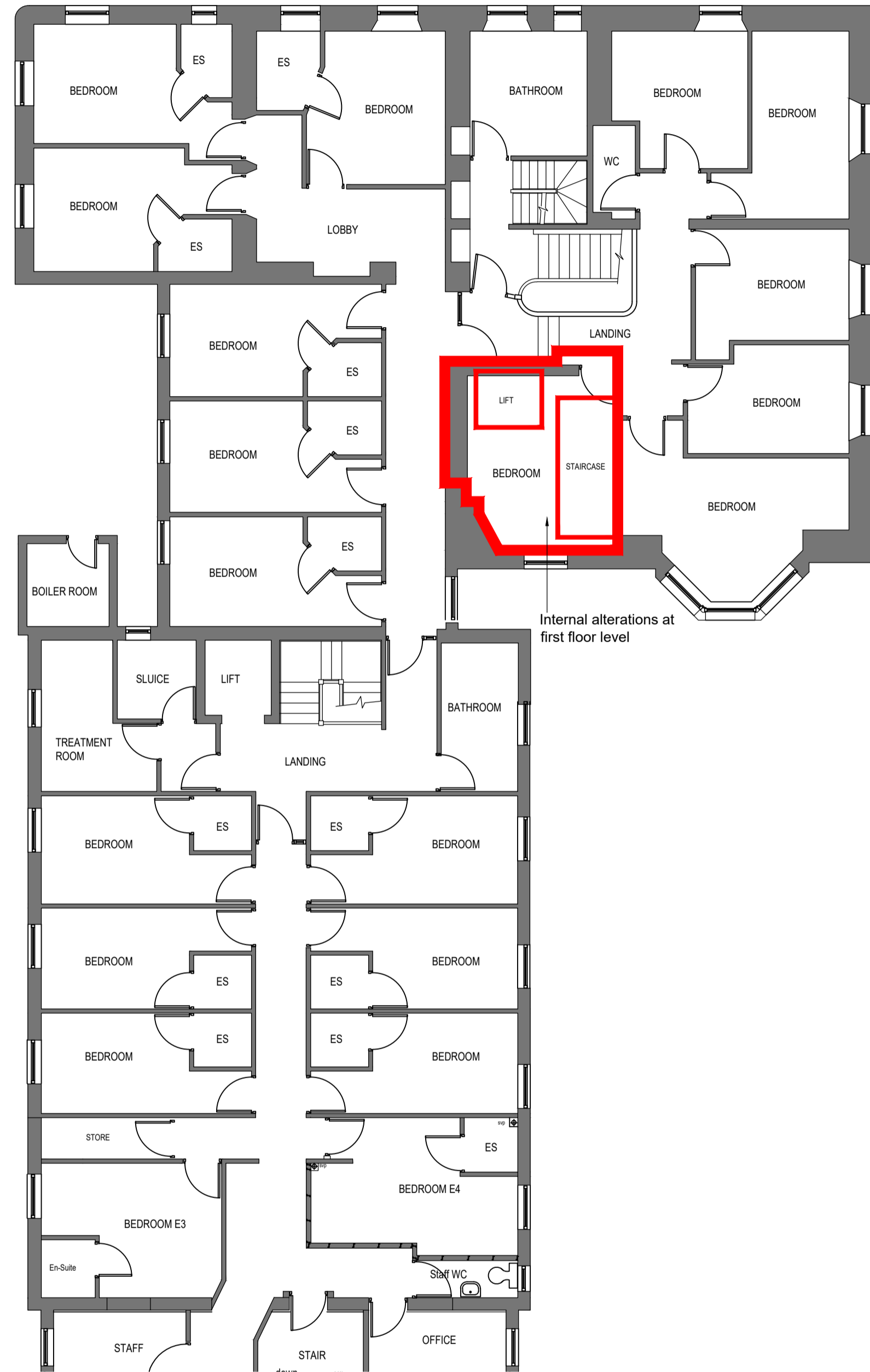
IDENTIFICATION OF PROPOSED ALTERATIONS FIRST FLOOR 1:100