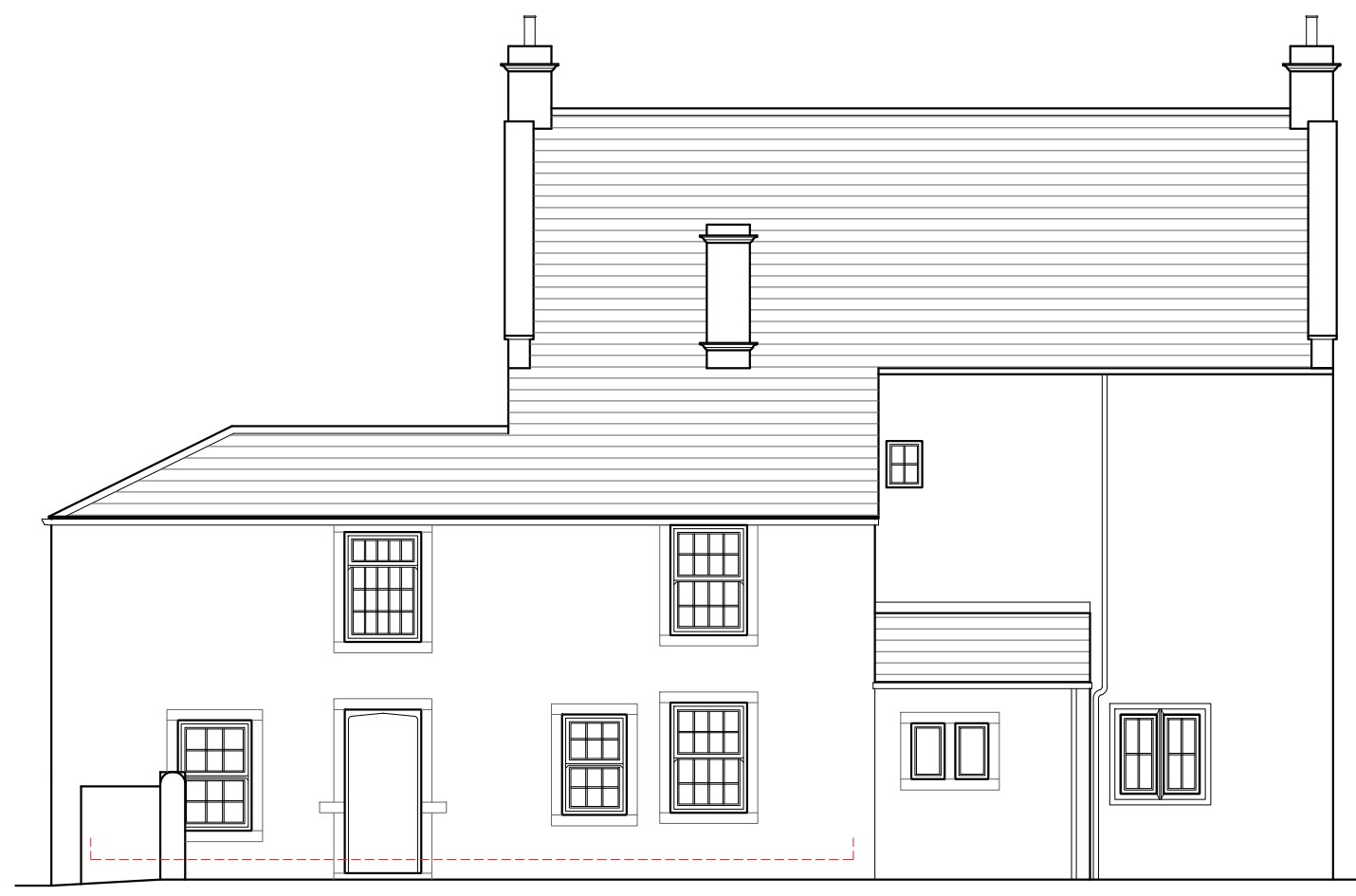
EXISTING NORTH FACING ELEVATION SCALE 1:100