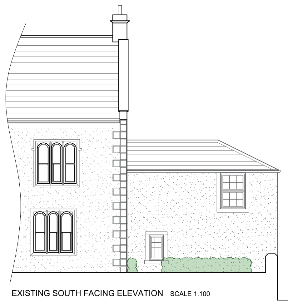
EXISTING SOUTH FACING ELEVATION SCALE 1:100

This drawing is to be read in conjunction with all relevant Architect, consultants' and specialists' drawings and specifications. The Architect is to be notified of any discrepancies before proceeding. Do not scale from this drawing. All dimensions and levels are to be checked on site. This drawing is subject to copyright. All work carried out before Planning and Building Permission has been granted is at the contractor/clients risk. Note: proposed drawing based on OS dwg information. All illustrated dimensions are approximate and all site dimensions are to be checked on site and subject to site survey.