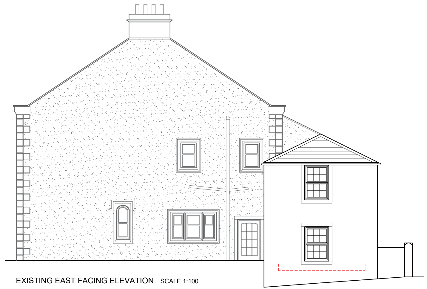
EXISTING EAST FACING ELEVATION SCALE 1:100