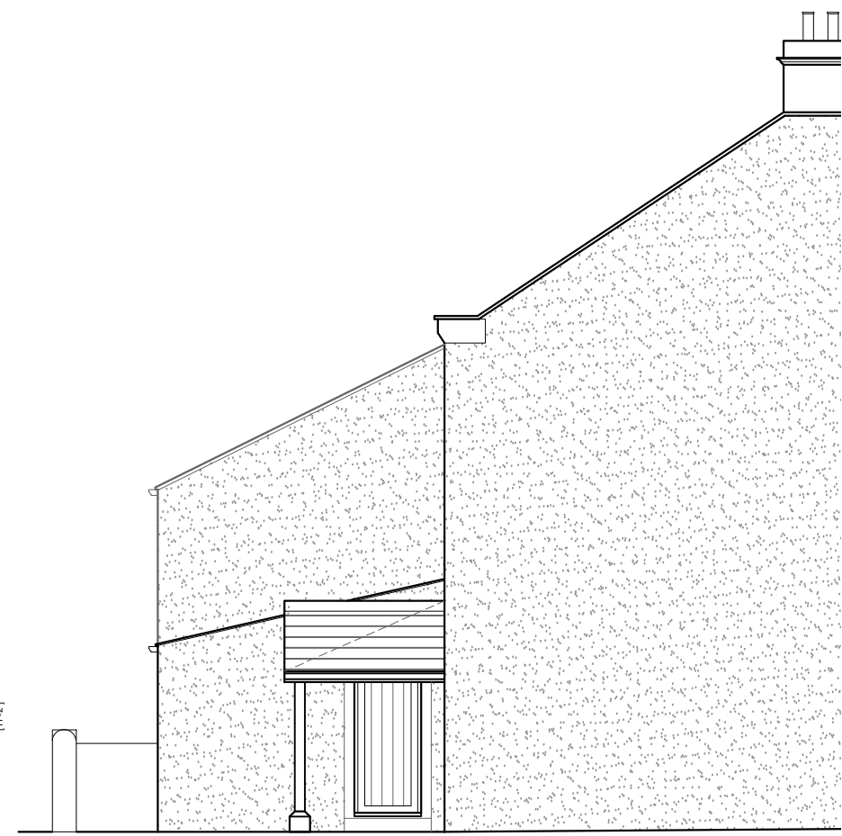
PROPOSED WEST FACING ELEVATION SCALE 1:100