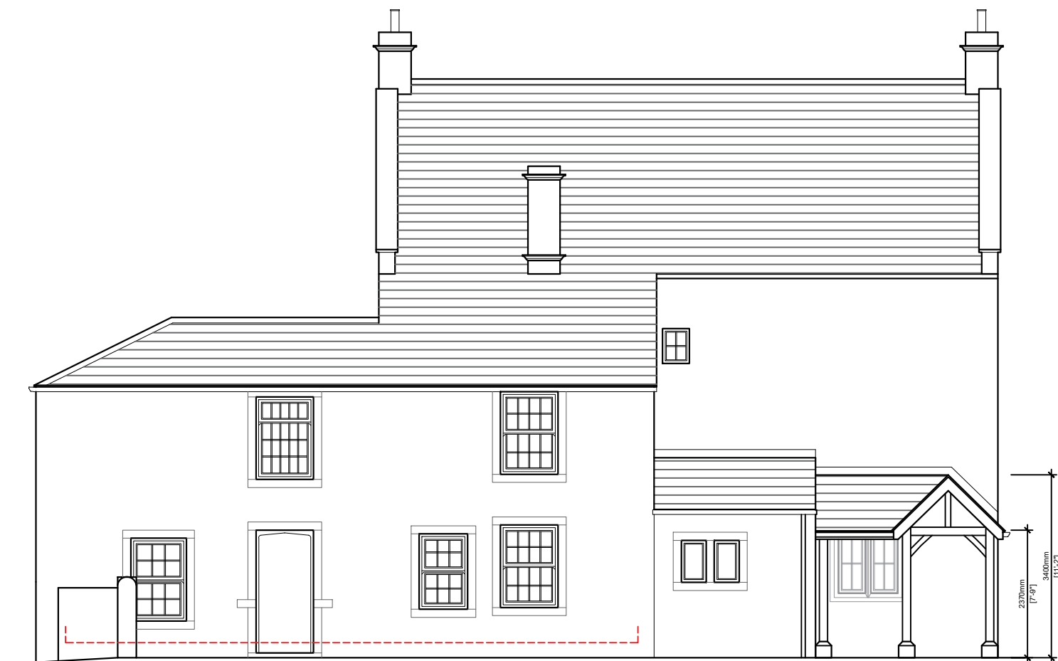
PROPOSED NORTH FACING ELEVATION SCALE 1:100