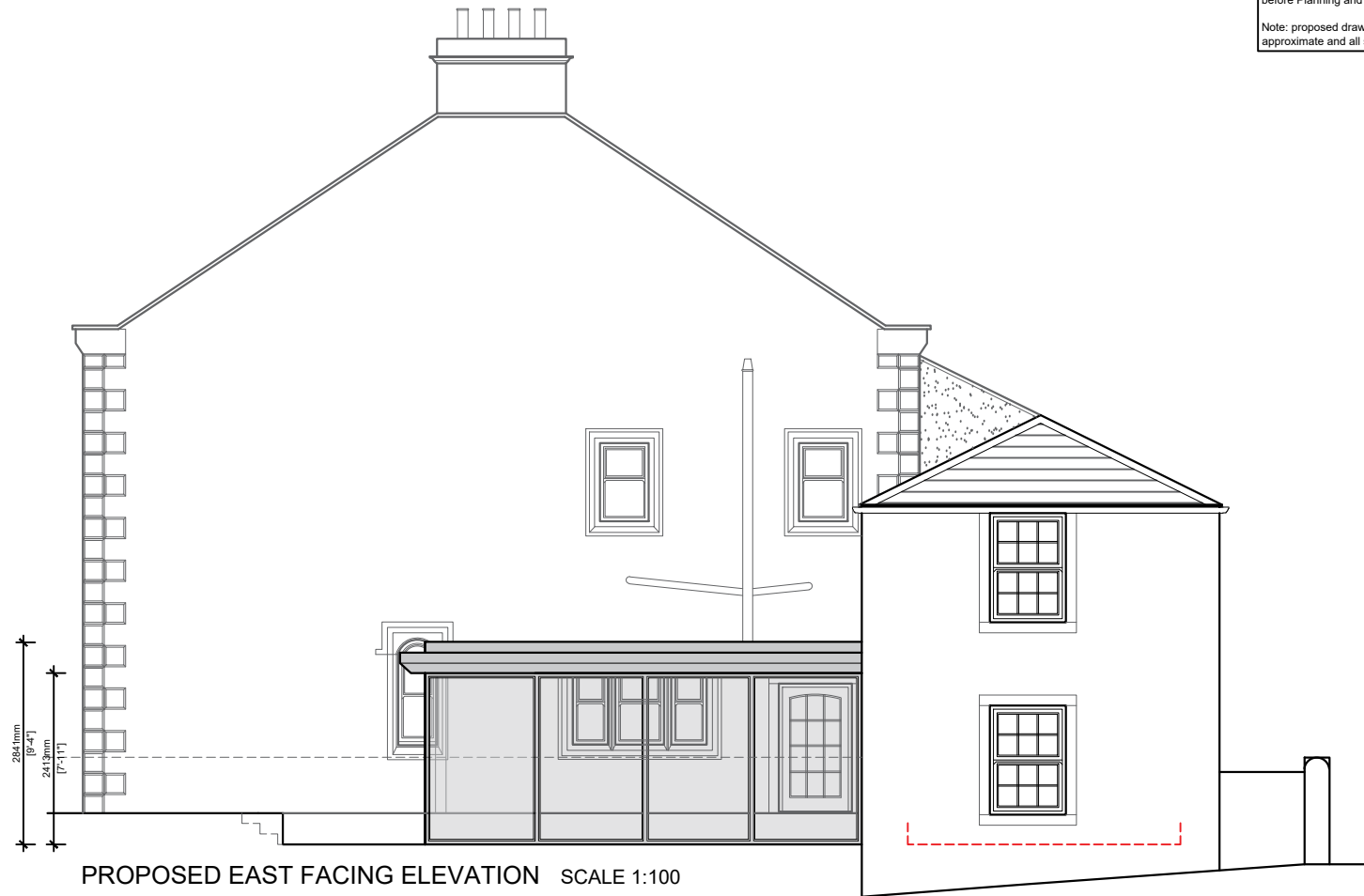
PROPOSED EAST FACING ELEVATION SCALE 1:100