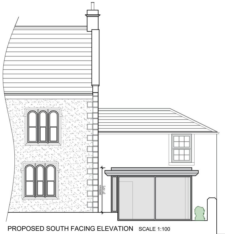
PROPOSED SOUTH FACING ELEVATION SCALE 1:100

This drawing is to be read in conjunction with all relevant Architect, consultants' and specialists' drawings and specifications. The Architect is to be notified of any discrepancies before proceeding. Do not scale from this drawing. All dimensions and levels are to be checked on site. This drawing is subject to copyright. All work carried out before Planning and Building Permission has been granted is at the contractor/clients risk. Note: proposed drawing based on OS dwg information. All illustrated dimensions are approximate and all site dimensions are to be checked on site and subject to site survey.