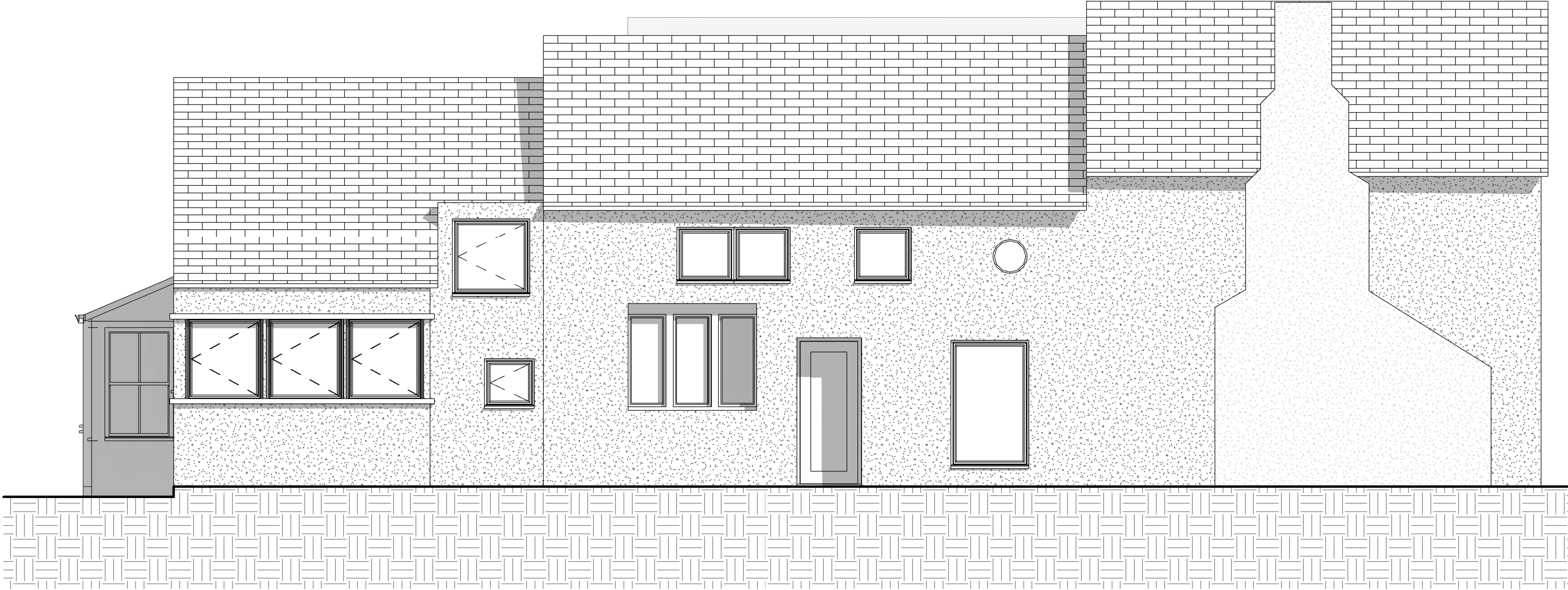
1 PROPOSED WEST 1 : 50