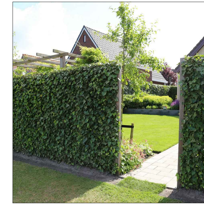
1.8m high Green Screen fencing