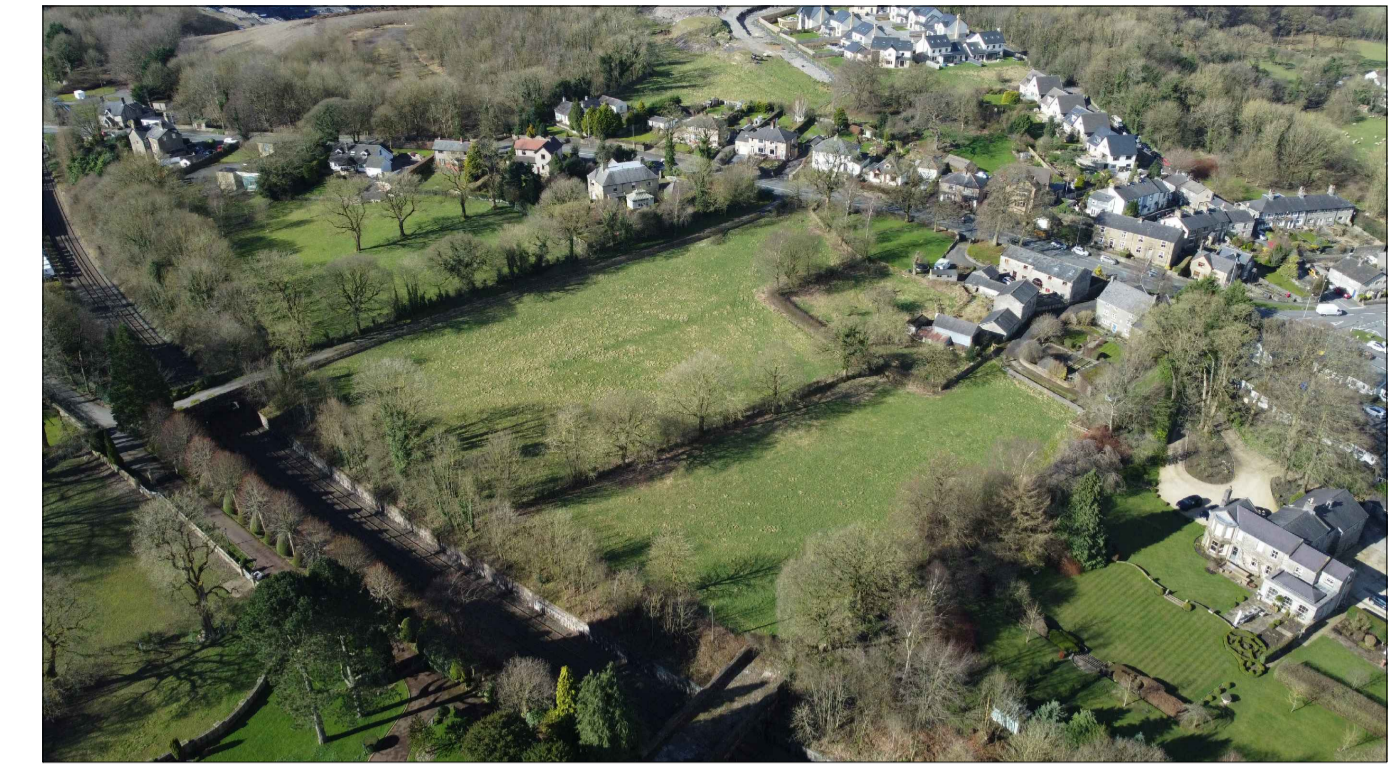
Aerial view of the site looking towards the southern & western boundaries