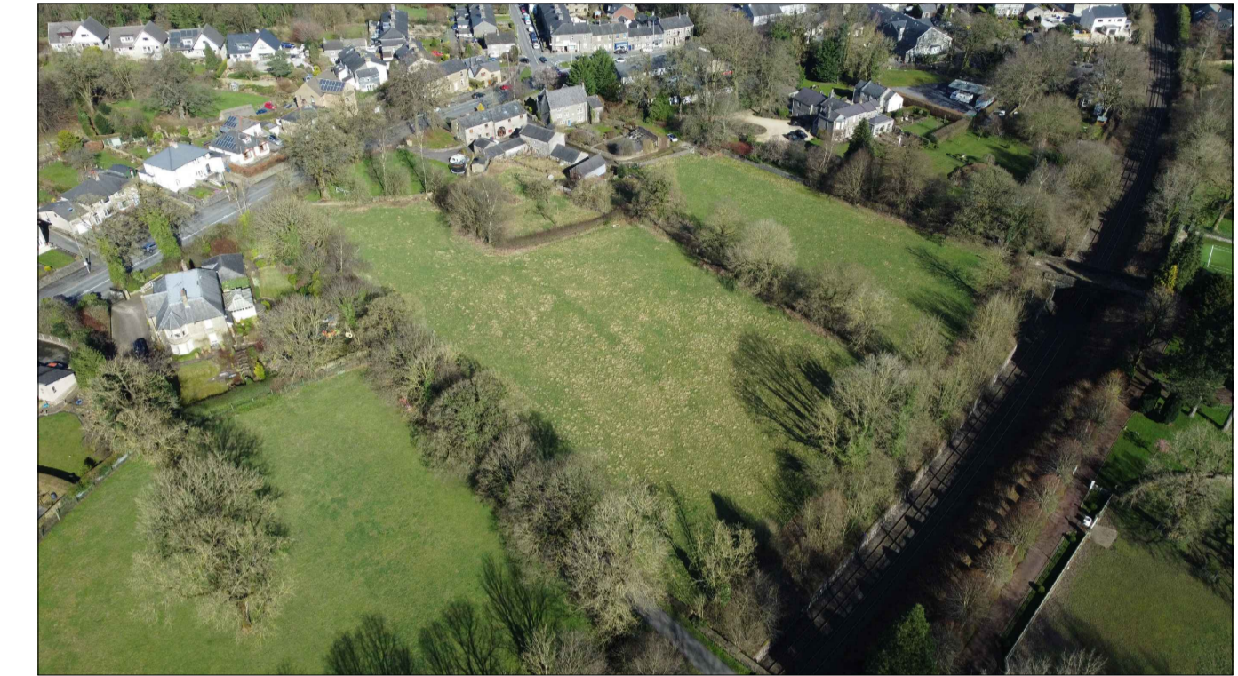
Aerial view of the site looking towards the eastern boundary