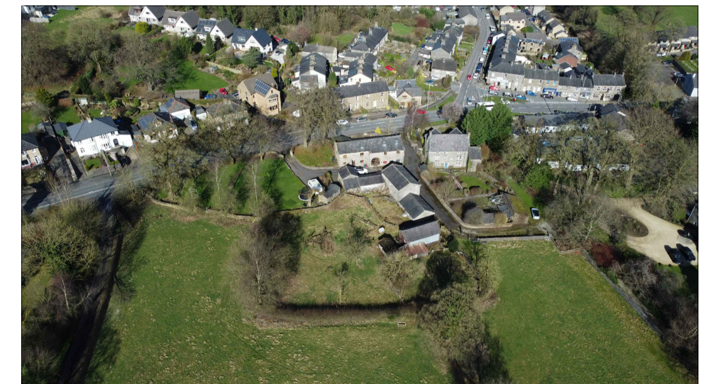
Aerial view of the site looking towards the northern boundary