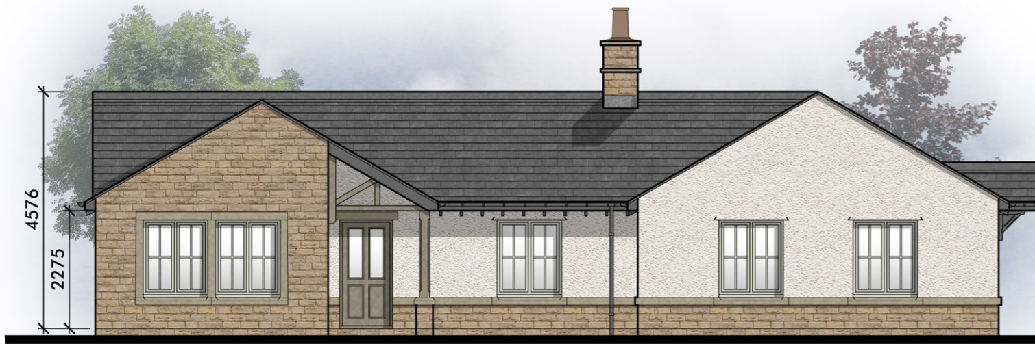
The Hastings FRONT