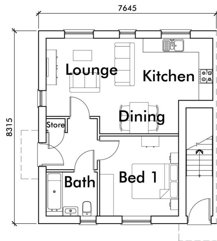
1 BED - 47.59m 2 (512ft 2 )