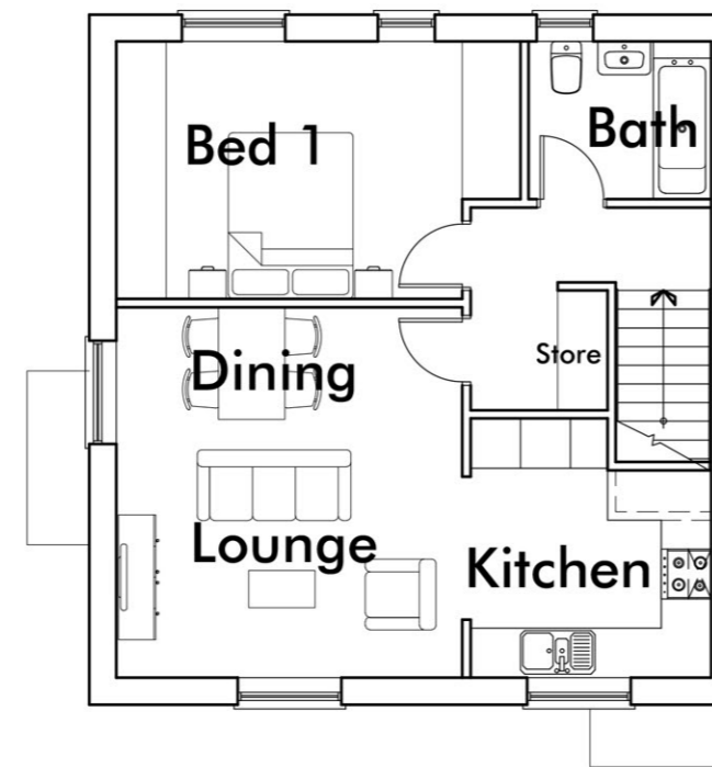
1 BED - 56.95m 2 (613ft 2 )