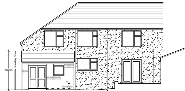
South West Elevation 1:100