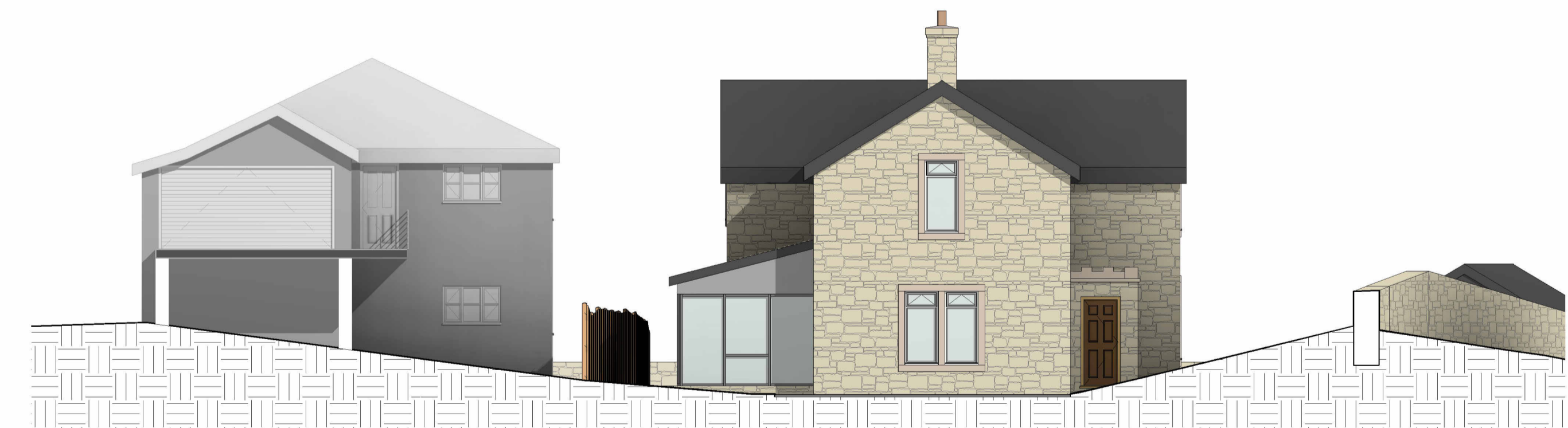
4 PROPOSED EAST 1 : 100