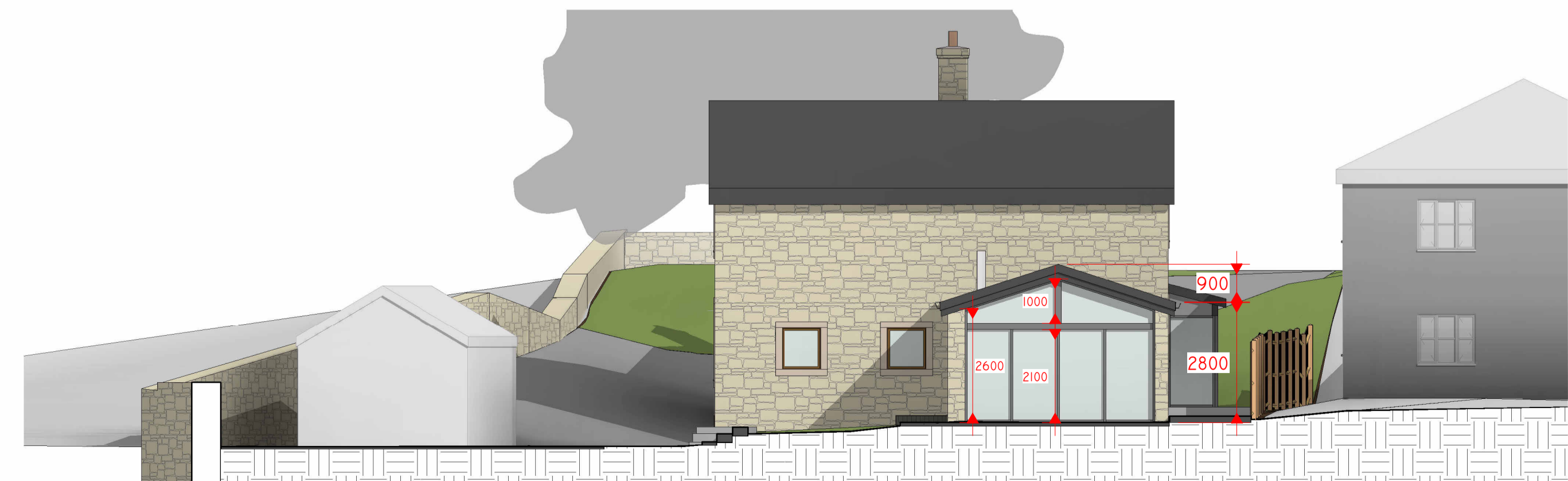
5 PROPOSED WEST 1 : 100