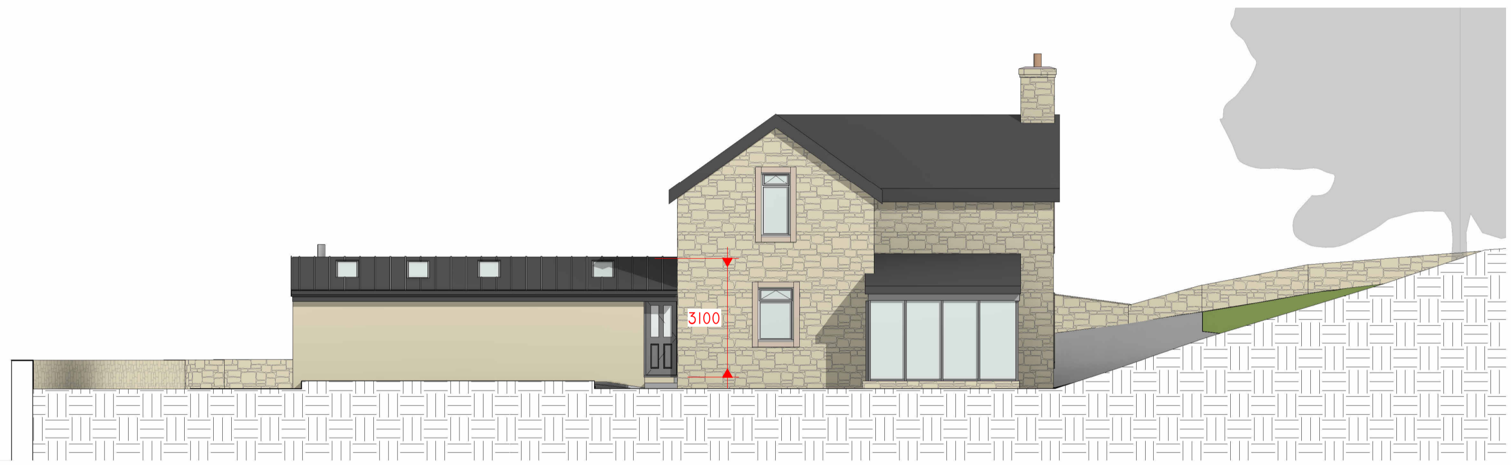
3 PROPOSED SOUTH 1 : 100