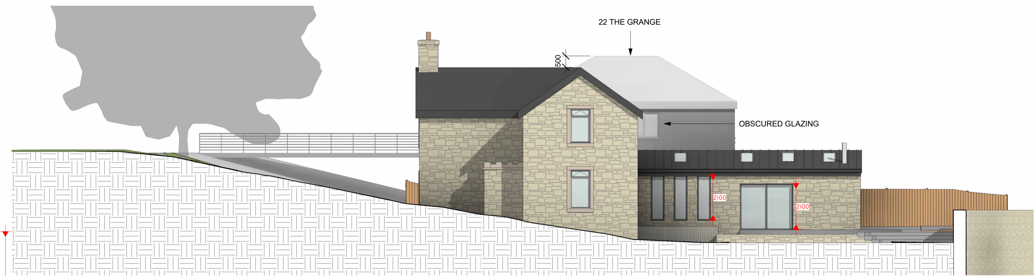
2 PROPOSED NORTH 1 : 100