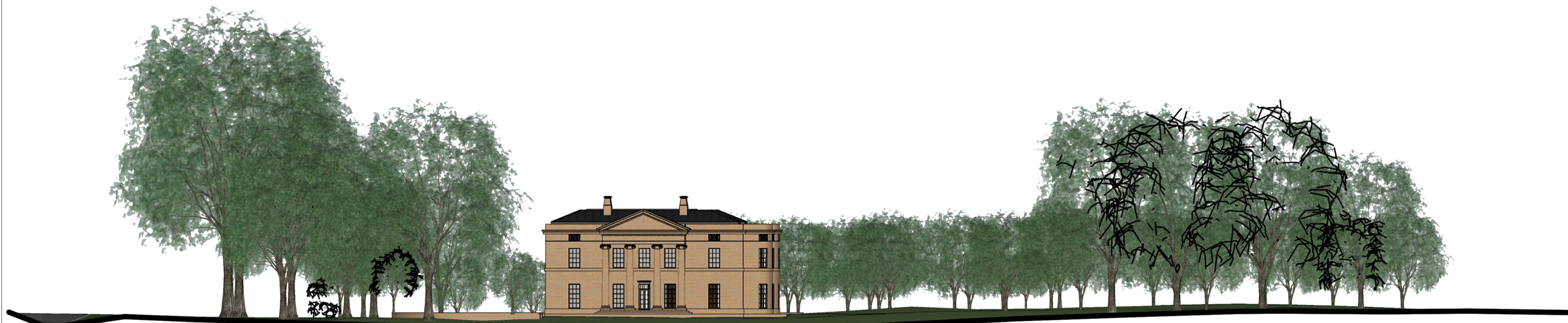
SECTION B:B - 1:250