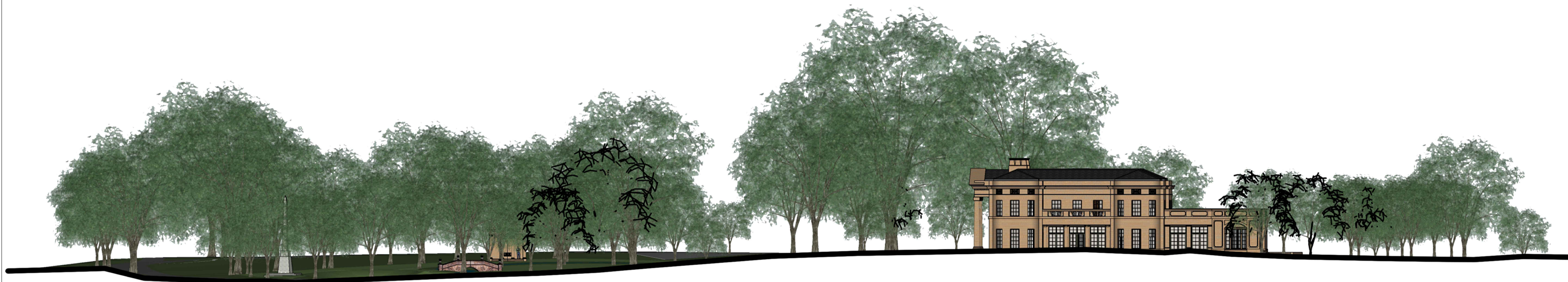
SECTION A:A - 1:250