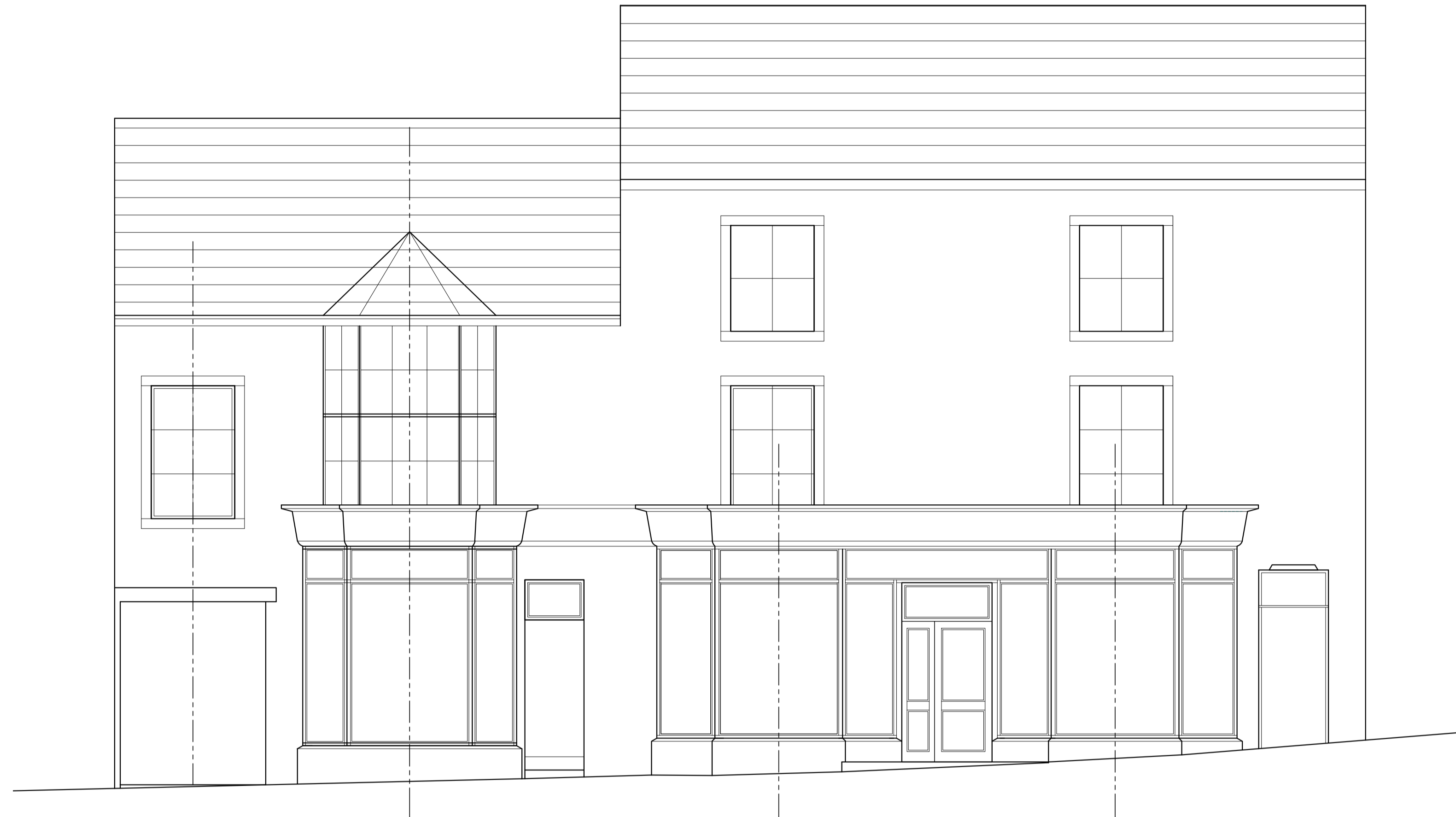
EXISTING FRONT ELEVATION Scale 1:50