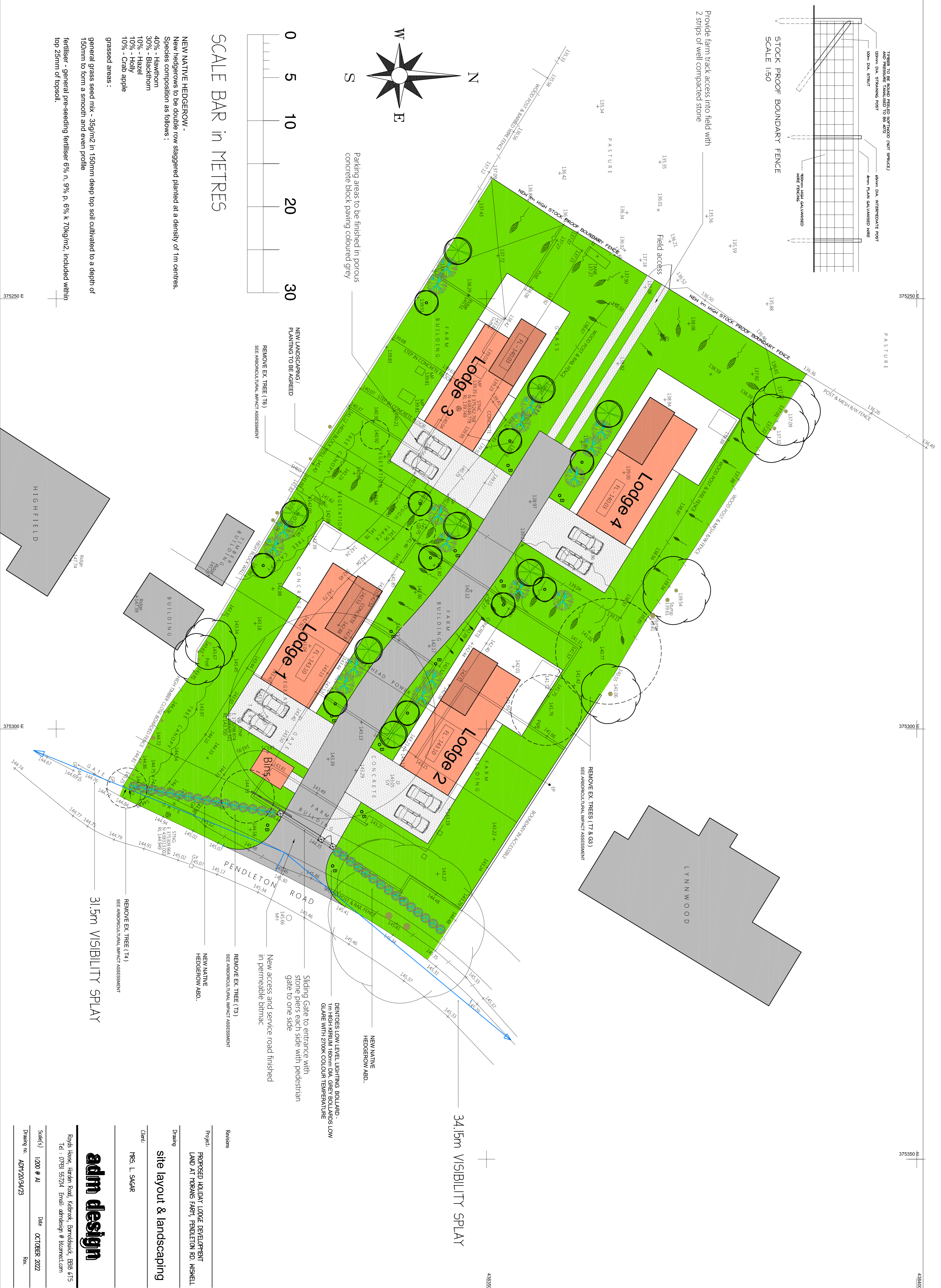
34.15m VISIBILITY SPLAY

fertiliser - general pre-seeding fertiliser 6% n, 9% p, 6% k 70kg/m 2 , included within top 25mm of topsoil.