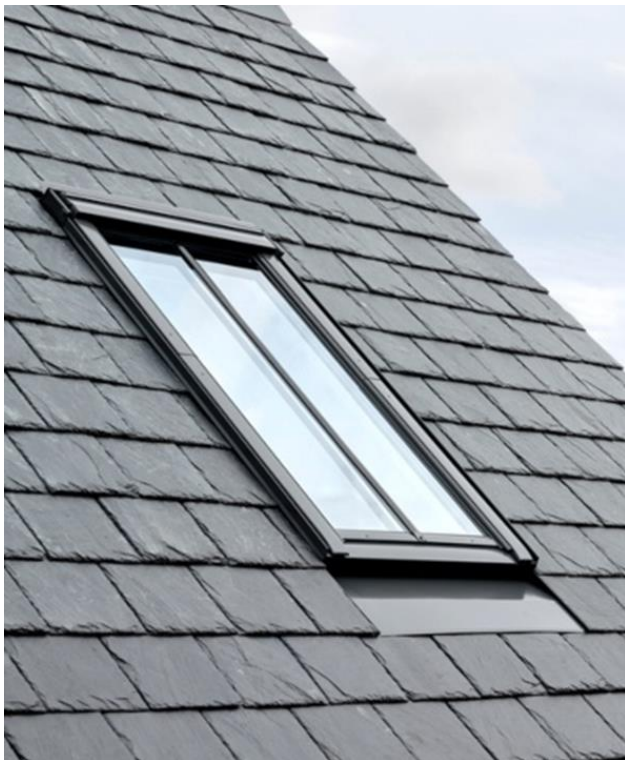
Conservation Rooflight Company or similar