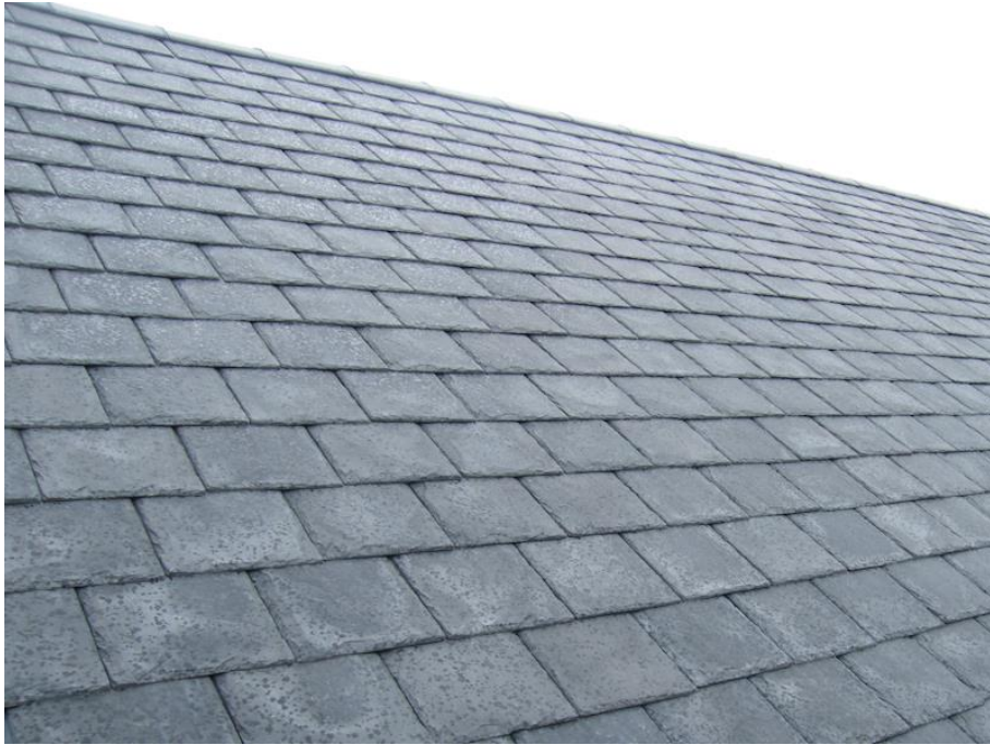
Roof slate, reproduction Greys Roofing Products – Welsh Slate -Welsh Blue/Grey