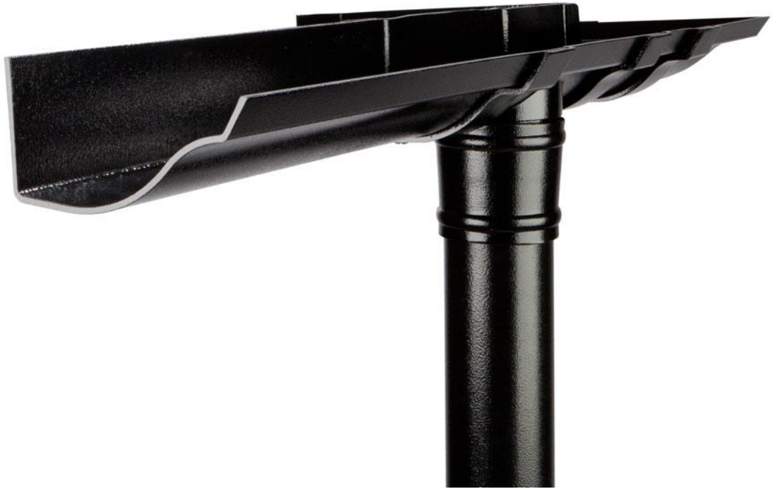
Traditional Ogee Aluminium Guttering 113mm 75mm circular downpipes