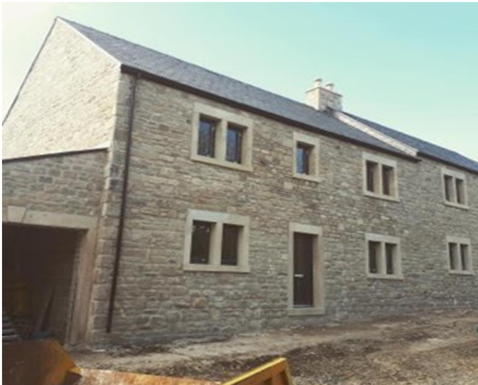
Stone Surrounds to Window