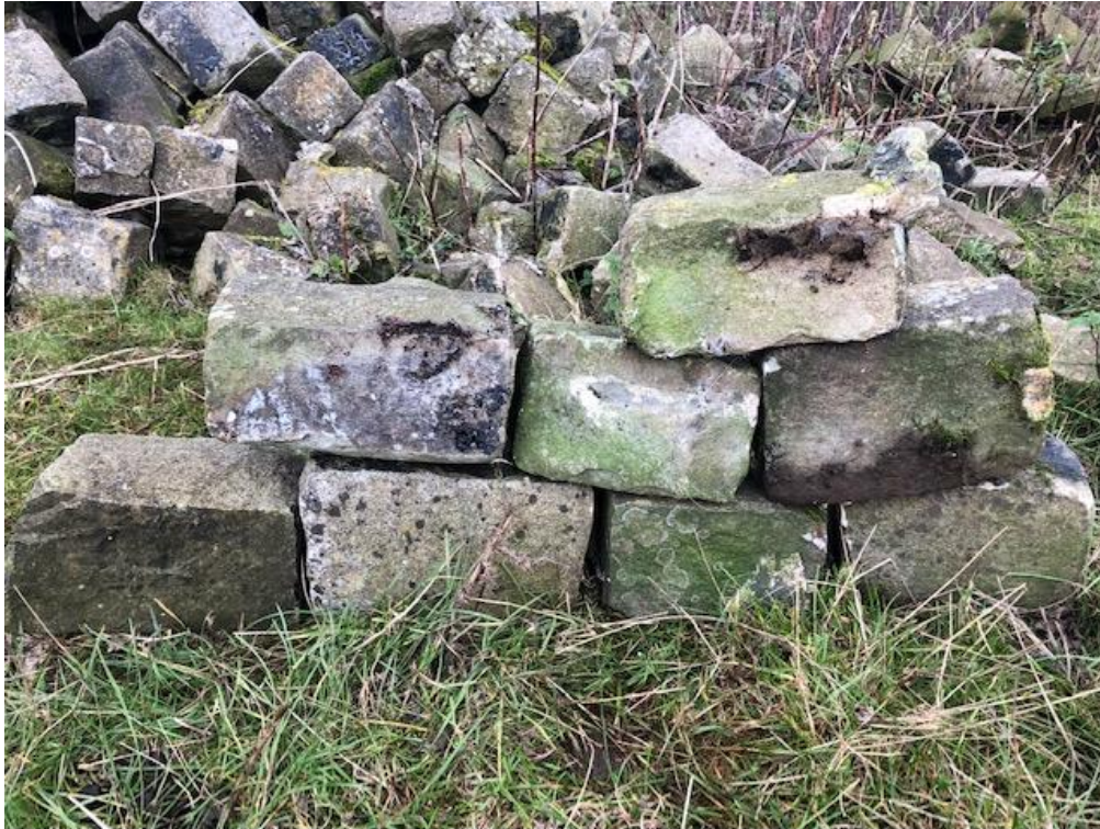
Proposed stone taken from redundant building from farm.