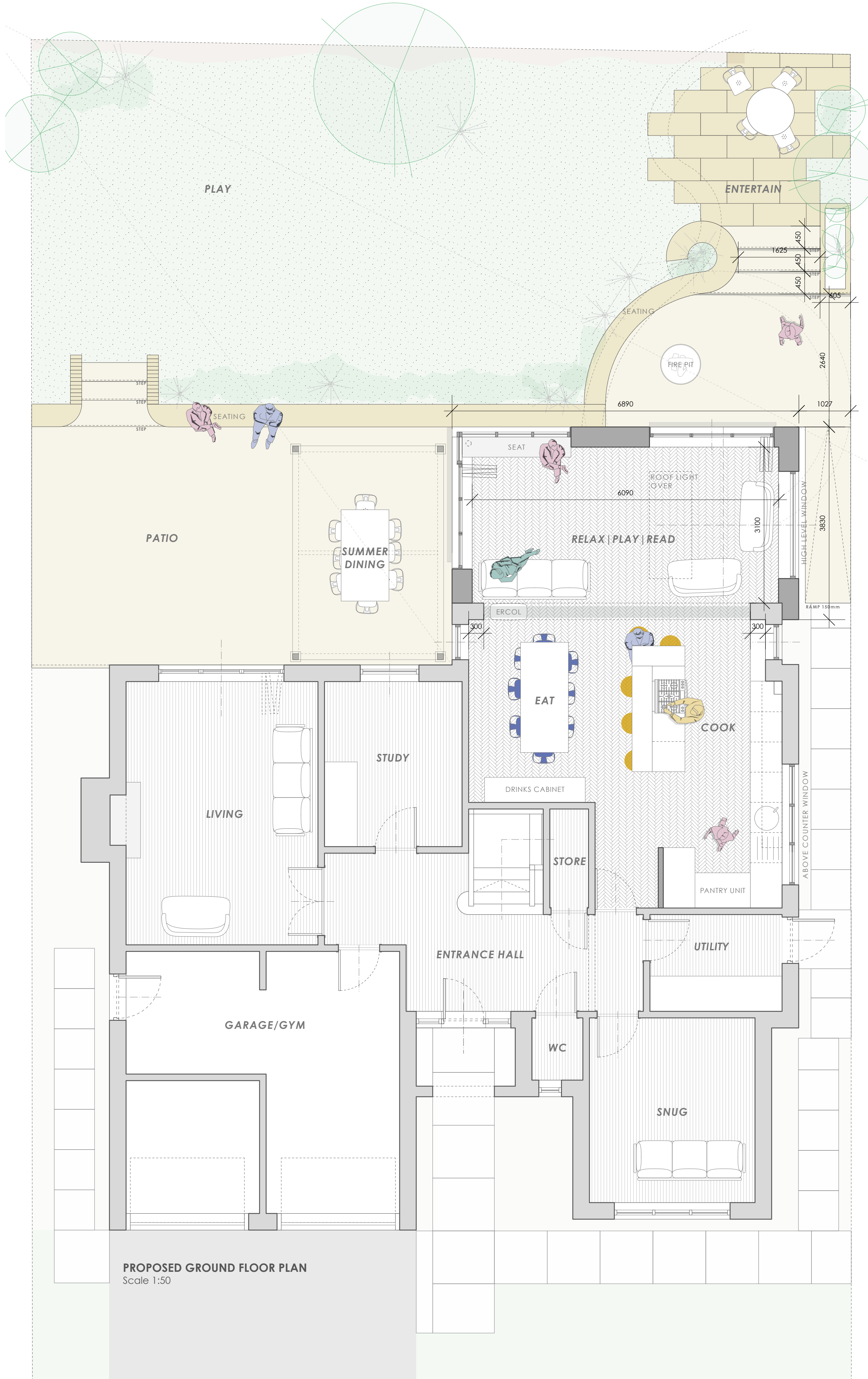
PROPOSED GROUND FLOOR PLAN Scale 1:50