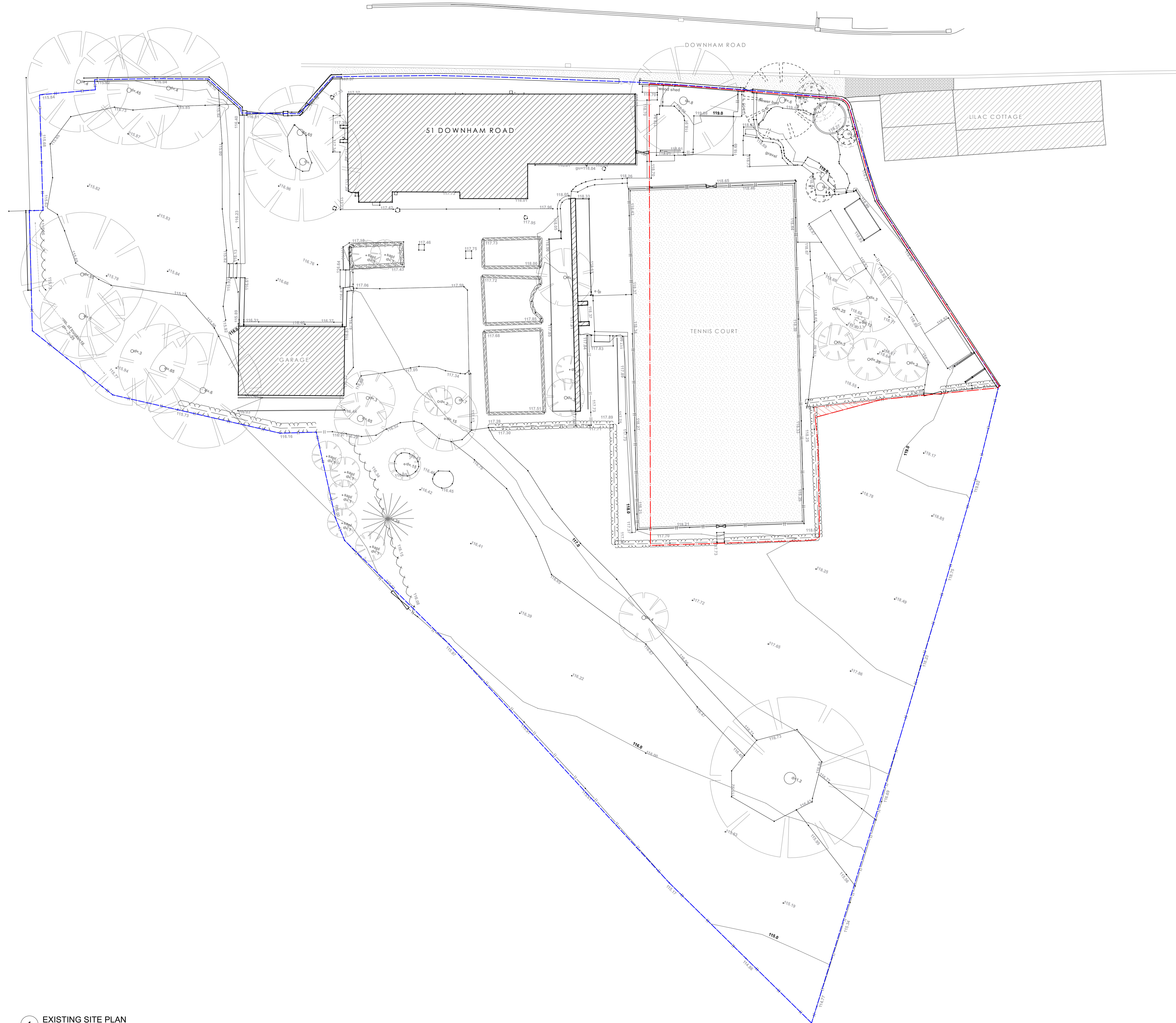
1 EXISTING SITE PLAN Scale: 1:200

Drawing No. A100 Revision 51 Downham Road Date 30 Nov 2022 Drawn By Check