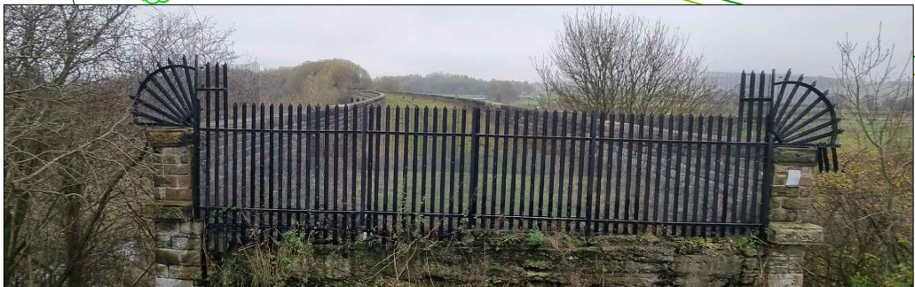
Picture showing fencing to be screened using earth bund and planting