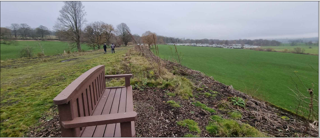
Picture looking towards caravan site for middle bench