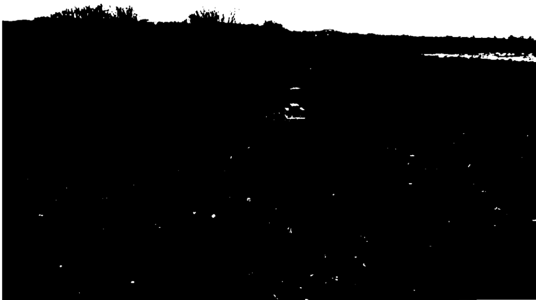
March 2021 Benches installed and gravel sub-base starts to be laid