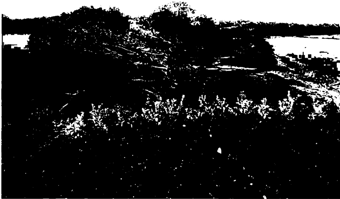
October 2020 the tree felling is well advanced, south side of banking is clear felled.