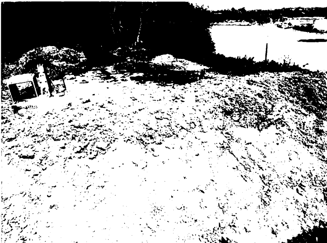
The bund is created and tree felling started July 2020