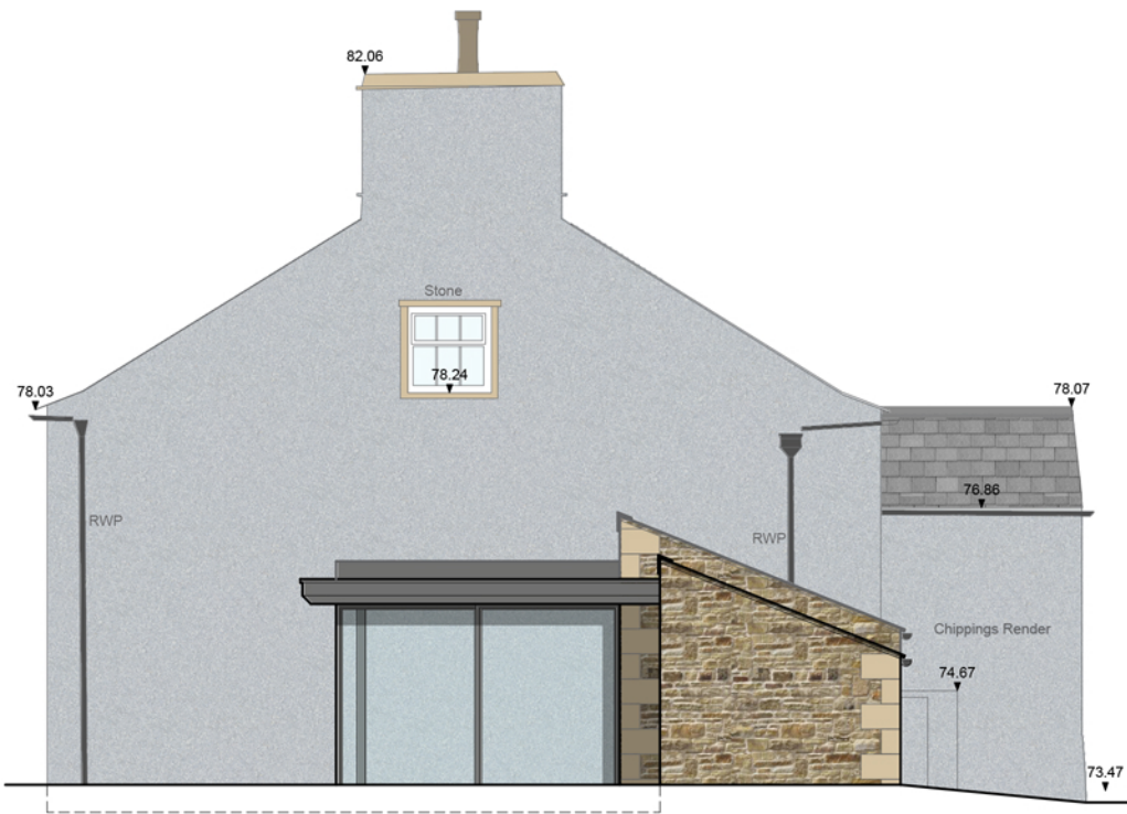
PROPOSED NORTH EAST ELEVATION SCALE 1:100