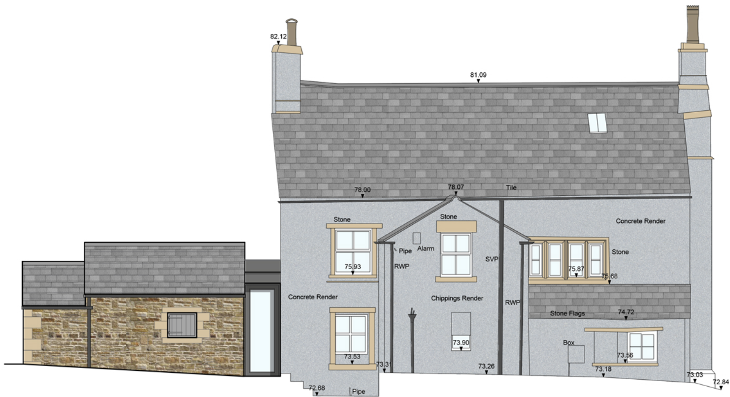
PROPOSED NORTH WEST ELEVATION SCALE 1:100