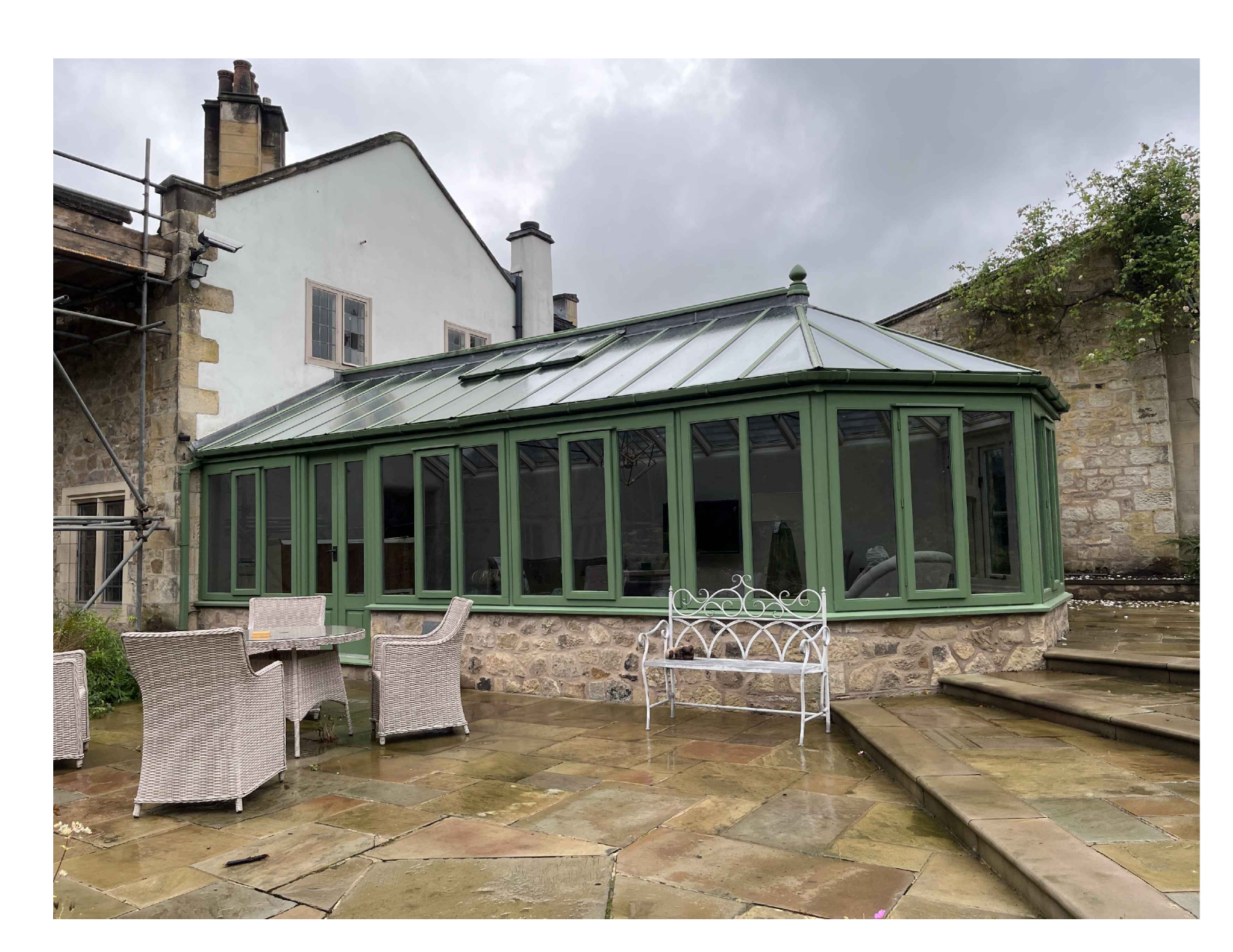
Existing Orangery NTS