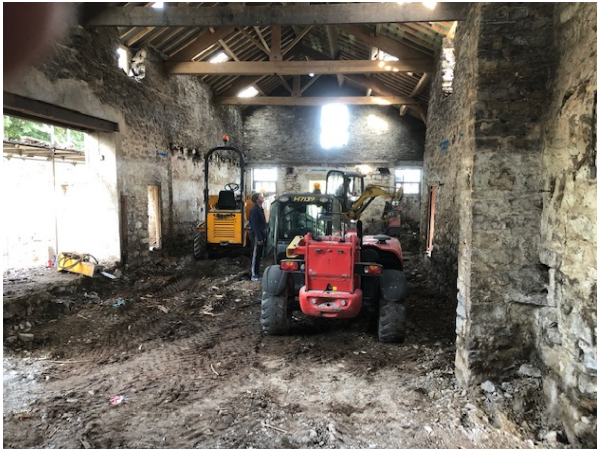
View of ground during construction works.