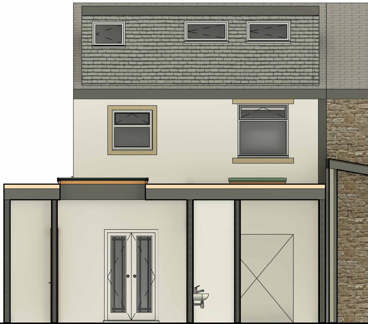
3 PROPOSED REAR ELEVATION 1 : 50

The rear of the property will also be re-finished in a render finish. The proposed rear extension will be finsihed in render aswell to be in keeping with the altered side and rear facade. The rear extension will open into the existing kitchen and will house a garden store , larger overall kitchen and a small utility bathroom. These spaces will be illuminated by two lantern lights , one window and a set of double doors.