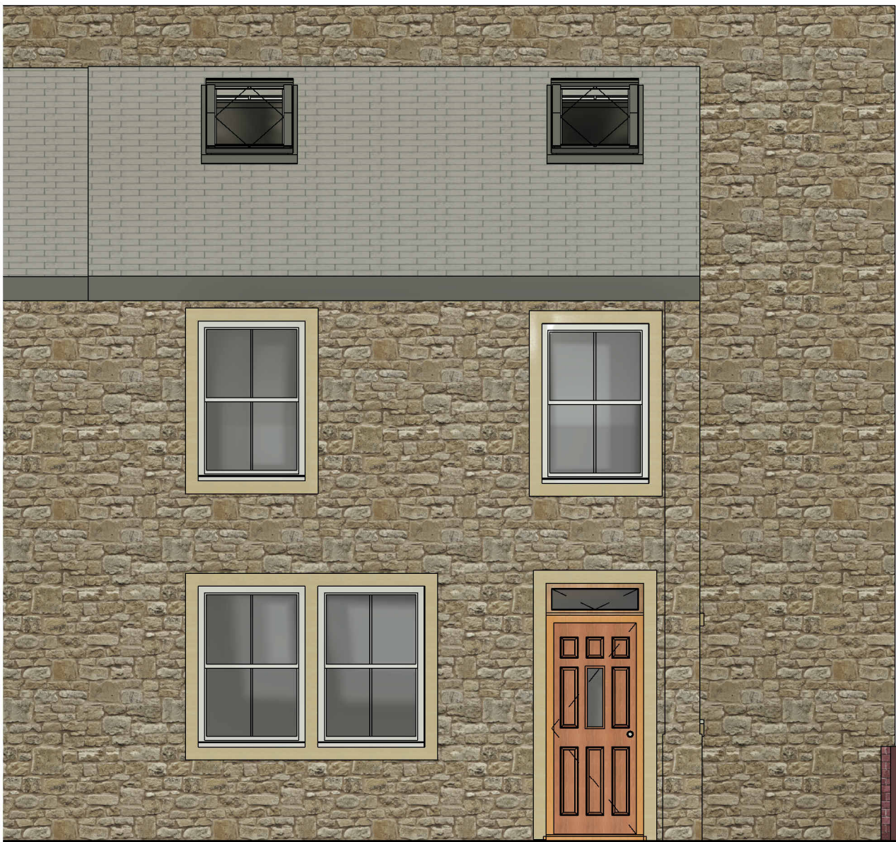
4 EXISTING FRONT ELEVATION 1 : 50