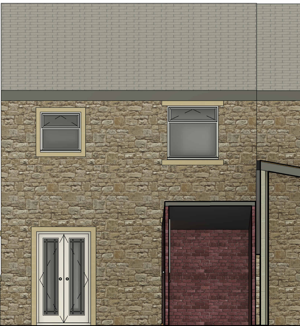
6 EXISTING REAR ELEVATION 1 : 50