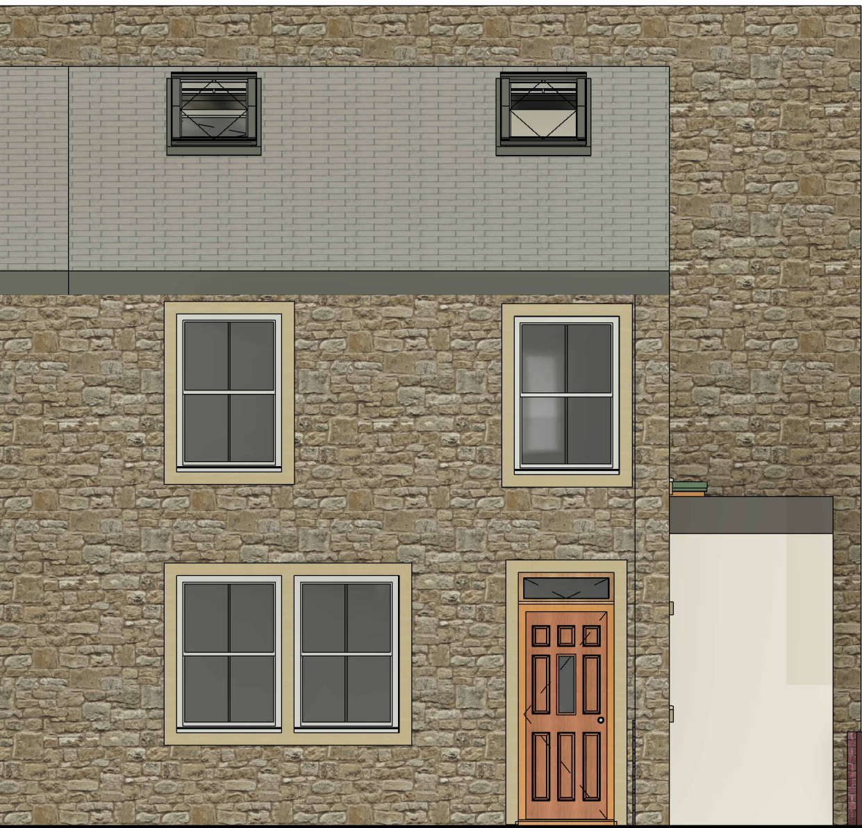
1 PROPOSED FRONT ELEVATION 1 : 50

Rooflights to attic space have been previously installed and no changes to the principal elevation. The rear extension may be visable to the side of the entrance but due to the topography of the site and its location , this will be barely visable from within the public domain.