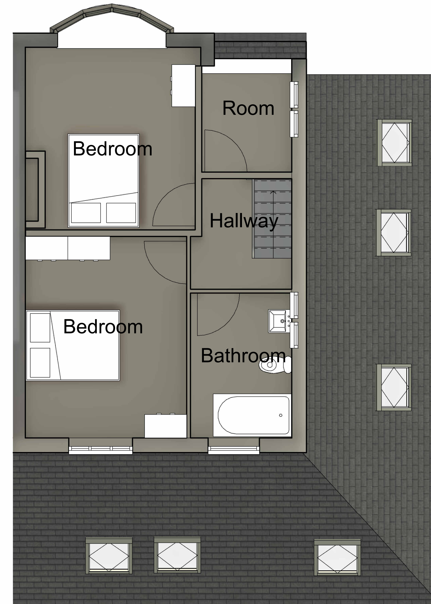
2 1 FIRST FLOOR 1 : 50